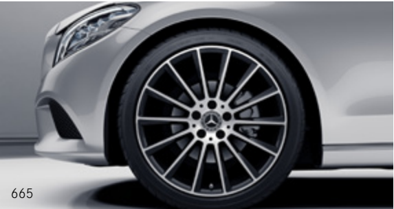
665 48.3 cm (19") AMG multi-spoke light-alloy wheels (OICW P31+776) In conjunction with P55 R 18,300 In conjunction with 956