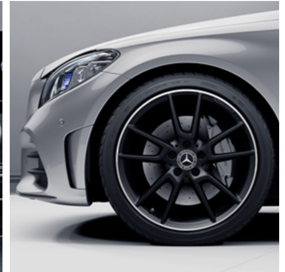
48.3 cm (19") AMG 5-twin-spoke light-alloy wheels (RTA)