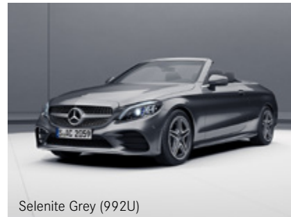
Selenite Grey (992U)