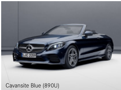
Cavansite Blue (890U)