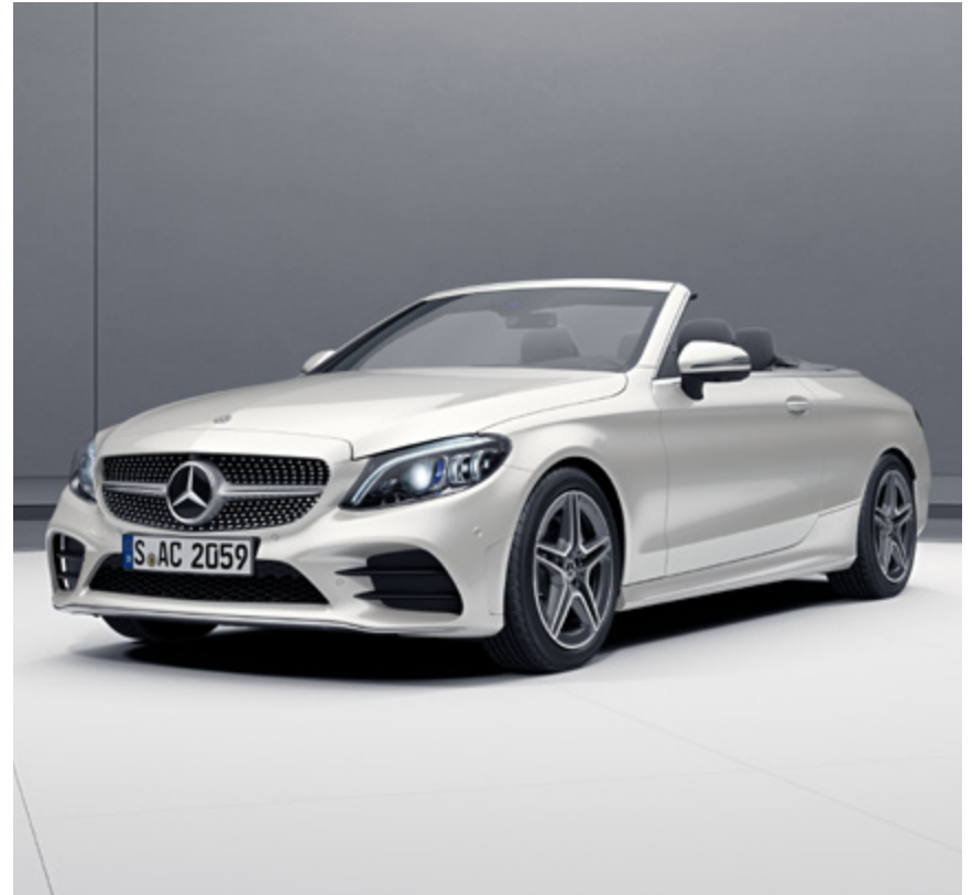
Diamond grille (5U4) | AGILITY CONTROL (677) | AMG bodystyling (772)