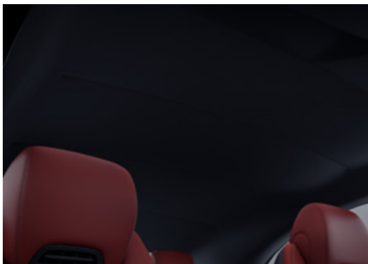
Roof liner in black fabric (51U)