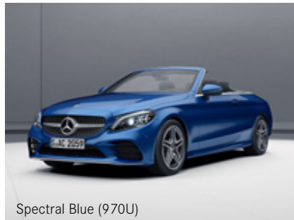
Spectral Blue (970U)