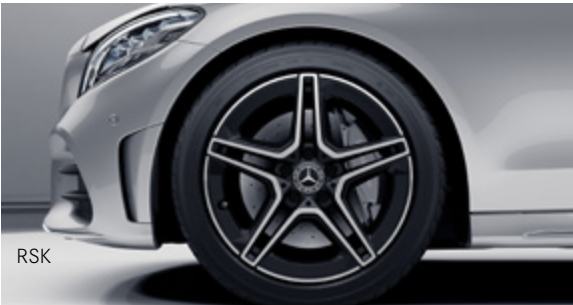
RSK 45.7 cm (18") AMG 5-spoke light-alloy wheels (OICW P31+P55)