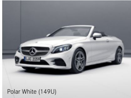
Polar White (149U)