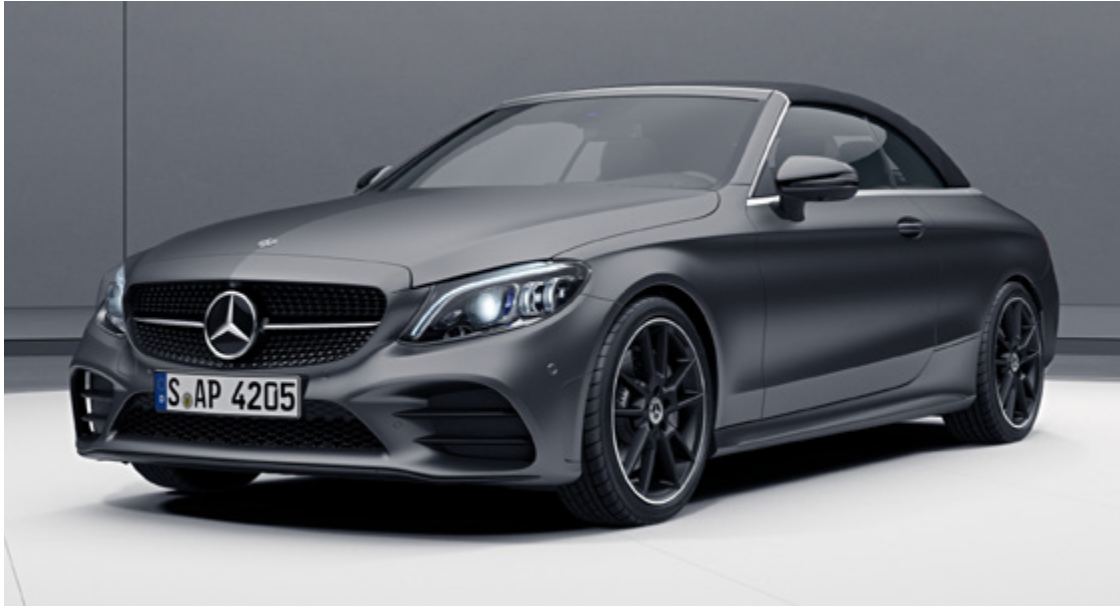
AMG Line Interior (P29) | AMG line Exterior (P31) | Night Package(P55) | AMG spoiler lip (U47) Surround lighting with projection of brand logo (586) | Interior Light package (876)