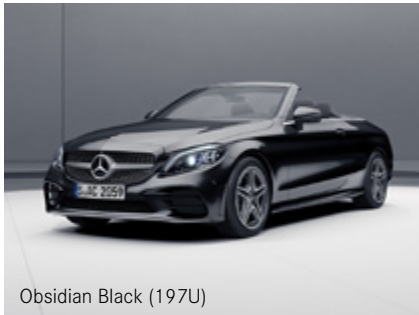
Obsidian Black (197U)