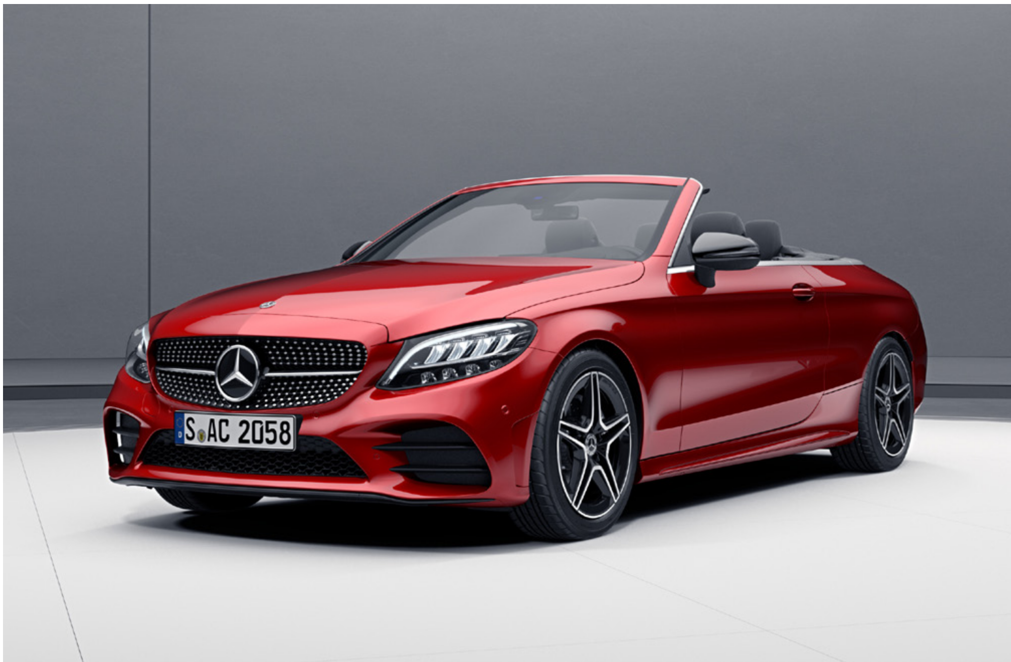
MANUFAKTUR Hyacinth red metallic (996U) | 45.7 cm (18") AMG 5-spoke light-alloy wheels (RSK) | AMG Line exterior (P31) | Night package (P55)