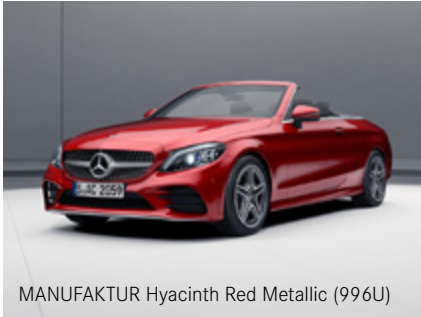
MANUFAKTUR Hyacinth Red Metallic (996U)