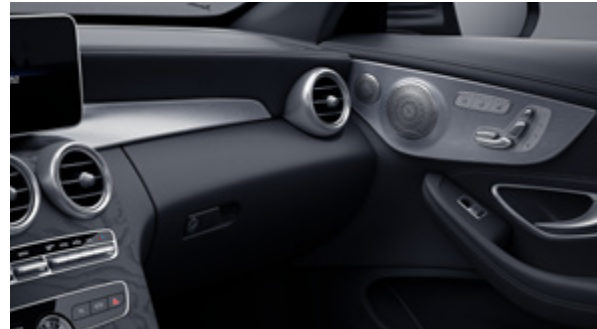
Open-pore black ash wood (737) | light longitudinal-grain aluminum (739)