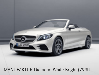
MANUFAKTUR Diamond White Bright (799U)