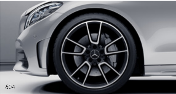
604 AMG twin-spoke wheels, 19", with mixed-size tyres (OICW P31+R66) R 20,800