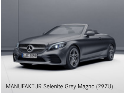
MANUFAKTUR Selenite Grey Magno (297U)