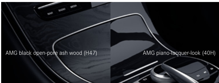
AMG black open-pore ash wood (H47)