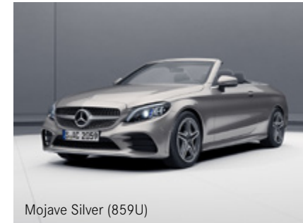
Mojave Silver (859U)