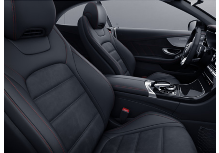
ARTICO man-made leather / DINAMICA microfibre AMG black (641A) | Red Seat Belts (Y05 - Optional)