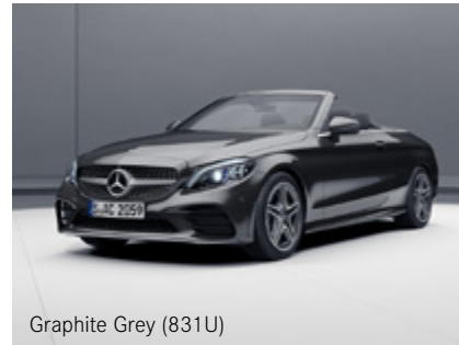
Graphite Grey (831U)