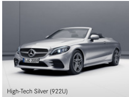
High-Tech Silver (922U)