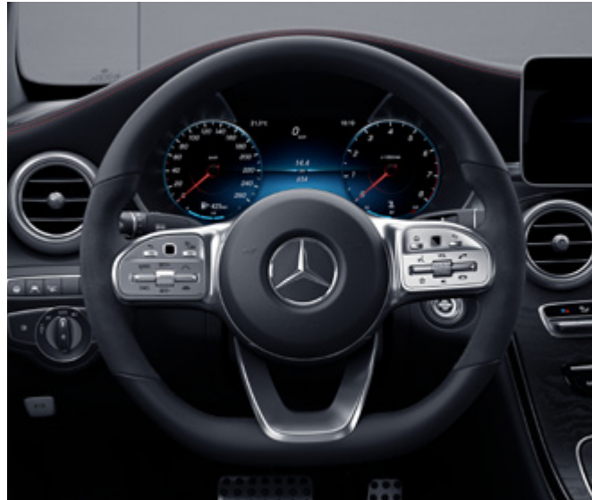
Multifunction sports steering wheel in nappa leather/DINAMICA microfibre (L51)