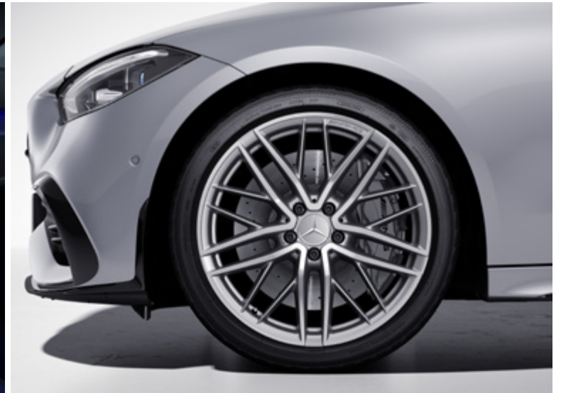
5-twin-spoke 48.3 cm (19") AMG light-alloy wheels (RSW) | Brake callipers painted silver (B06)