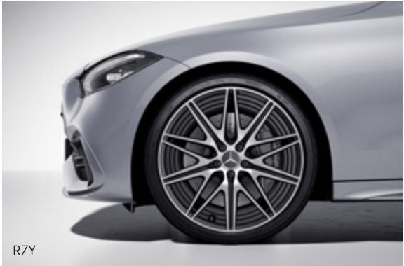
50.8 cm (20") AMG 5-twin-spoke light-alloy wheels