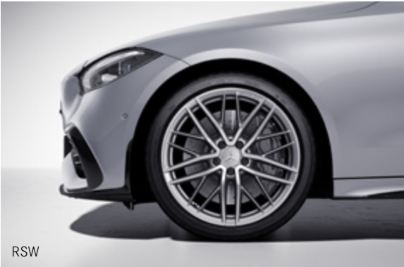
5-twin-spoke 48.3 cm (19") AMG light-alloy wheels