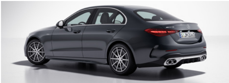
AMG bodystyling (772) | AMG spoiler lip (U95)