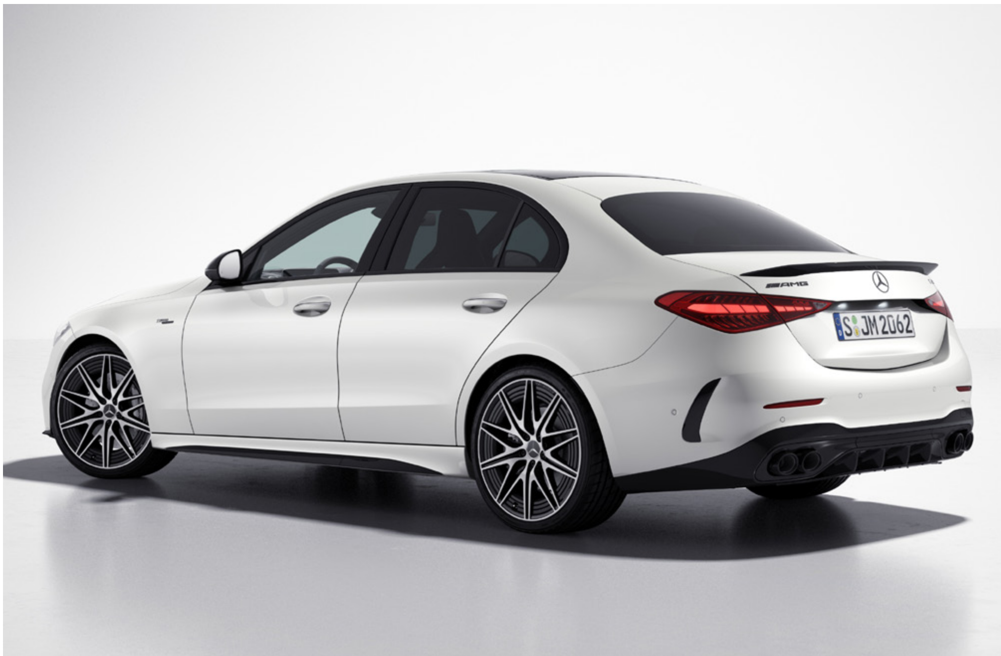
MANUFAKTUR opalite white bright (885U) | 50.8 cm (20") AMG 5-twin-spoke light-alloy wheels (RZY) | AMG Exterior Night package (P60) | AMG Night Package II (PAZ)