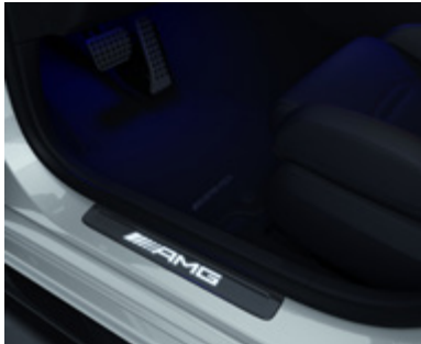
AMG illuminated door sills with "AMG" lettering with exchangeable cover (U45) Instrument panel & beltlines in ARTICO man-made leather in nappa look (U34)