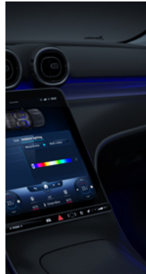
Ambient lighting (891)