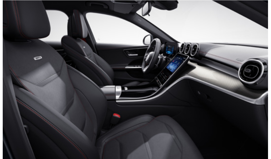
ARTICO man-made leather/DINAMICA microfibre AMG black (651A) | Sports Seats (7U3) | Metal structure trim element (H64)