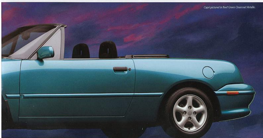
Capri pictured in Reef Green Clearcoat Metallic.