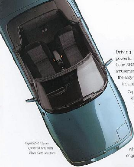
Capri's 2+2 interior is pictured here with Black Cloth seat trim.