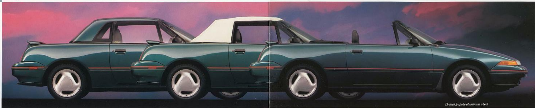
15-inch 3-spoke aluminum wheels