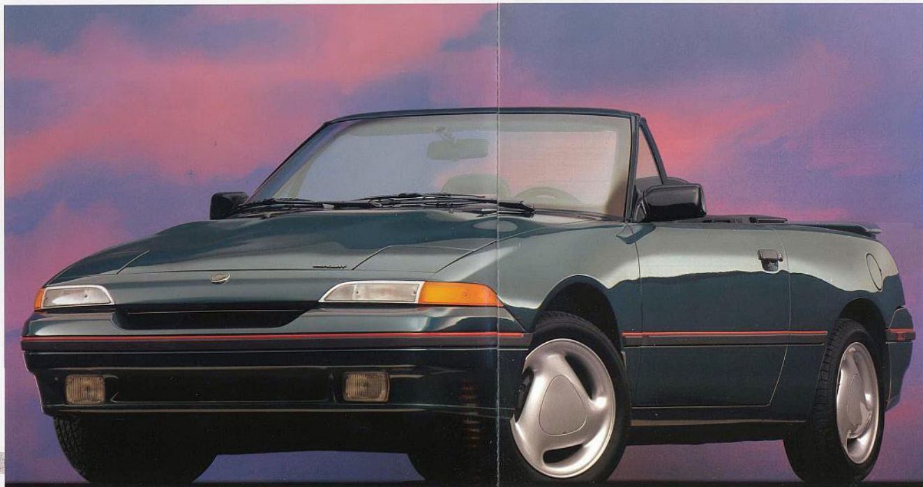
Capri XR2 pictured in Everglade Green Clearcoat Metallic.

Capri XR2's independent suspension is performance-tuned for navigating through the twisty stretches. The rear suspension's twin independent link design actually adjusts to lateral forces as you're rounding a turn, providing improved stability.