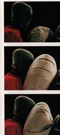
Shown here is a representation of a driver-side air bag Supplemental Restraint System deployment. The air bag inflates in less than one-tenth of a second in the event of a moderate to severe frontal impact, then deflates in a fraction of a second.