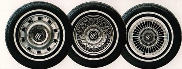
Left to right: full wheel cover, locking wire-style wheel cover, turbine spoke aluminum wheel.