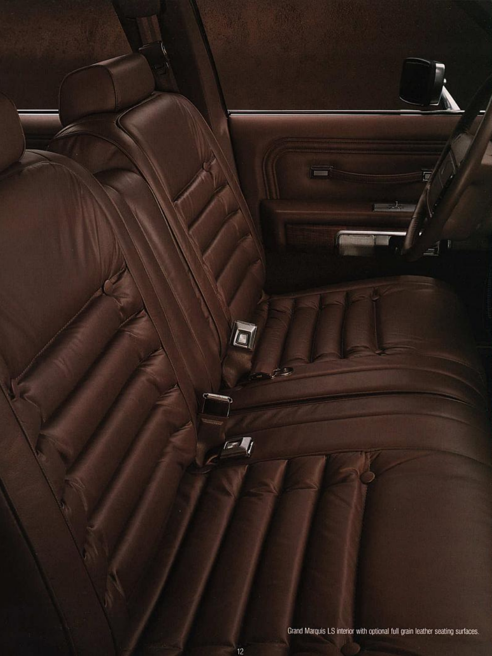
Grand Marquis LS interior with optional full grain leather seating surfaces.