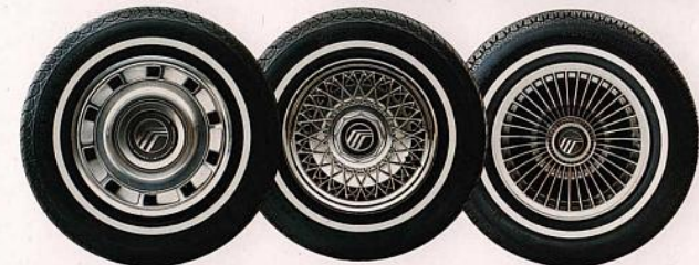
Left to right: full wheel cover, locking wire-style wheel cover, turbine spoke aluminum wheel.