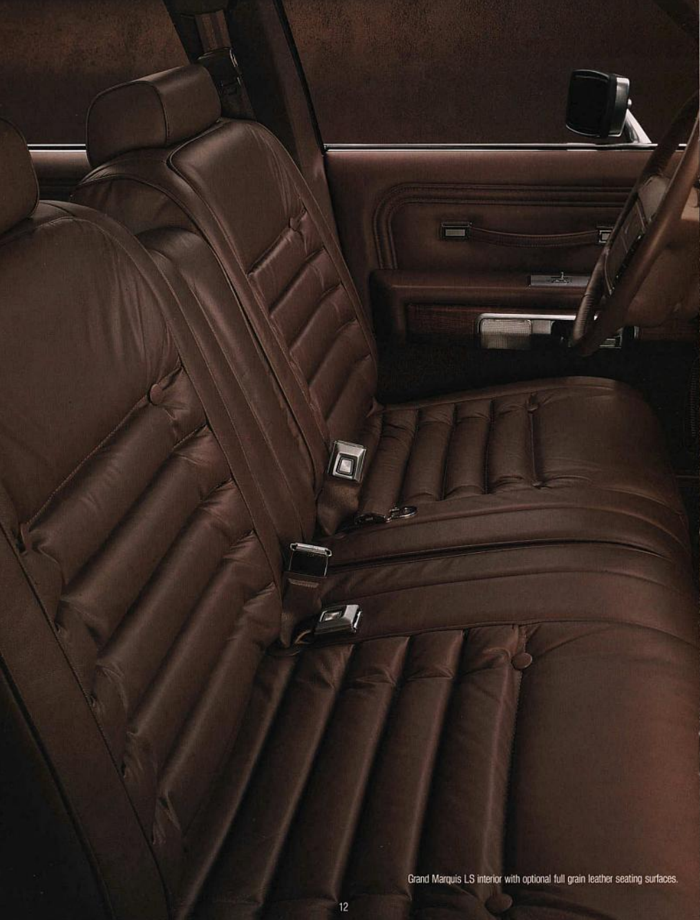
Grand Marquis LS interior with optional full grain leather seating surfaces.