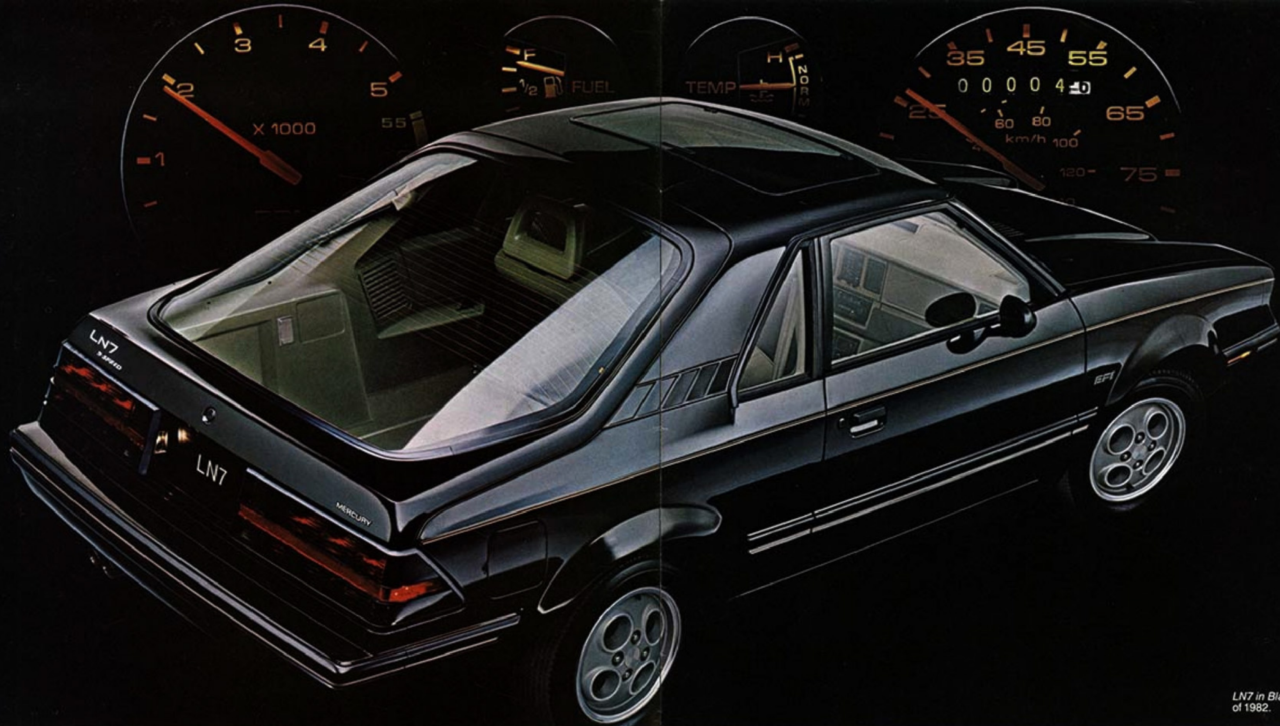
LN7 in Black with RS Package...available fall of 1982.