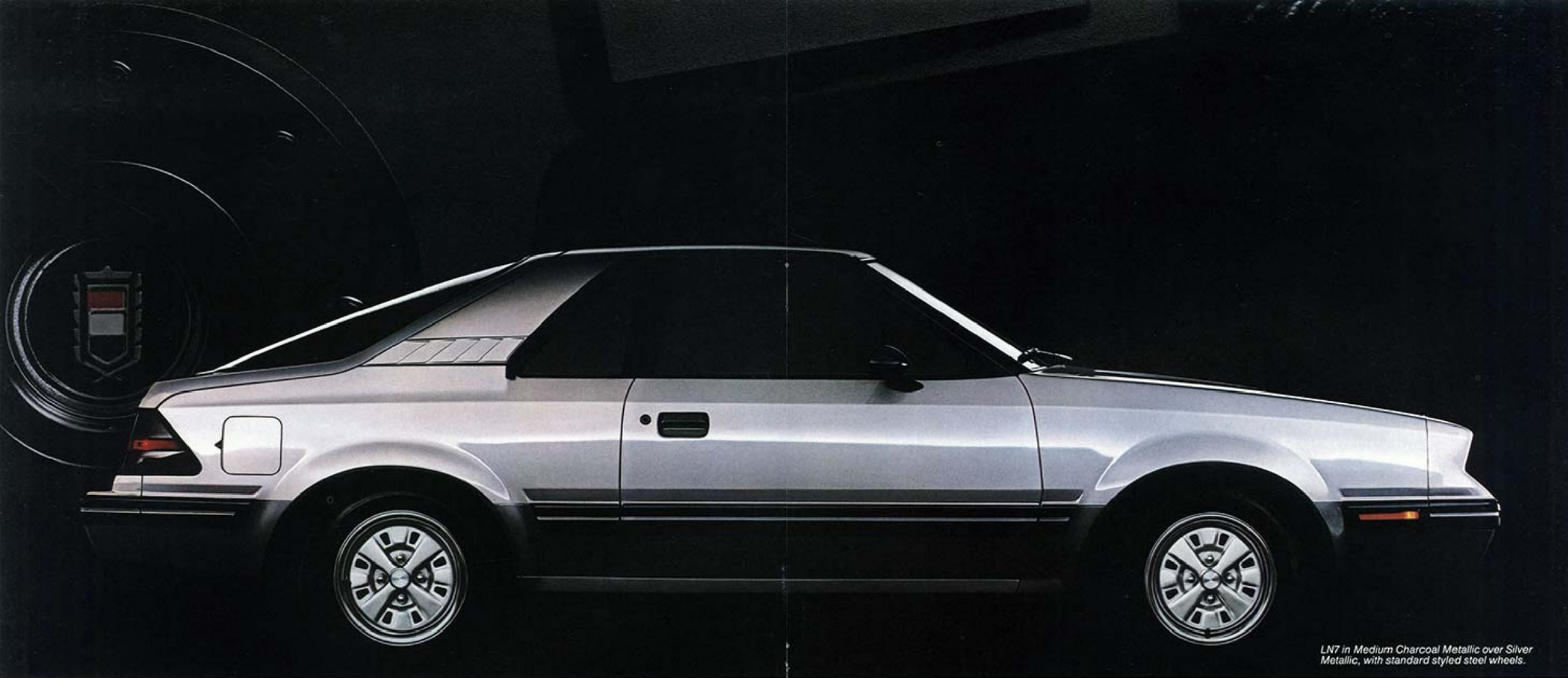
LN7 in Medium Charcoal Metallic over Silver Metallic, with standard styled steel wheels.