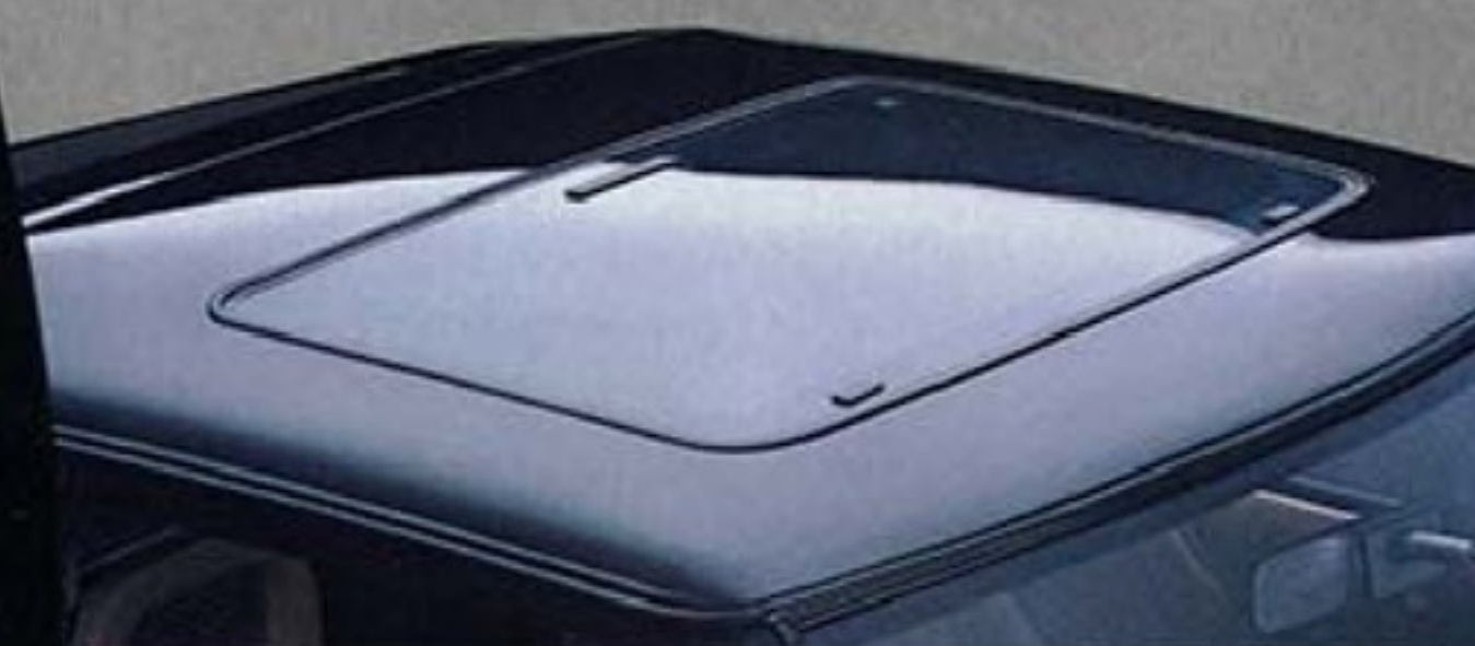
FLIP-UP OPEN AIR ROOF. Has pattern in the glass to act as sunshade. Let sunshine, fresh air, and moonlight in with this easy-to-handle, easy-to-love option. Available on every LN7.

SPEED CONTROL. Maintains the speed you select, lessens fatigue on long trips. Includes deluxe Black four-spoke steering wheel and "resume" feature. Standard with Grand Sport and RS Packages.