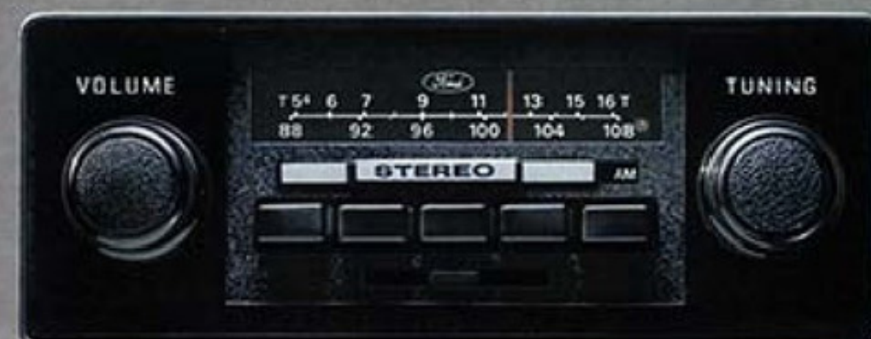
AM/FM STEREO RADIO. Optional on LN7. Standard with Sport Package. Or upgrade your