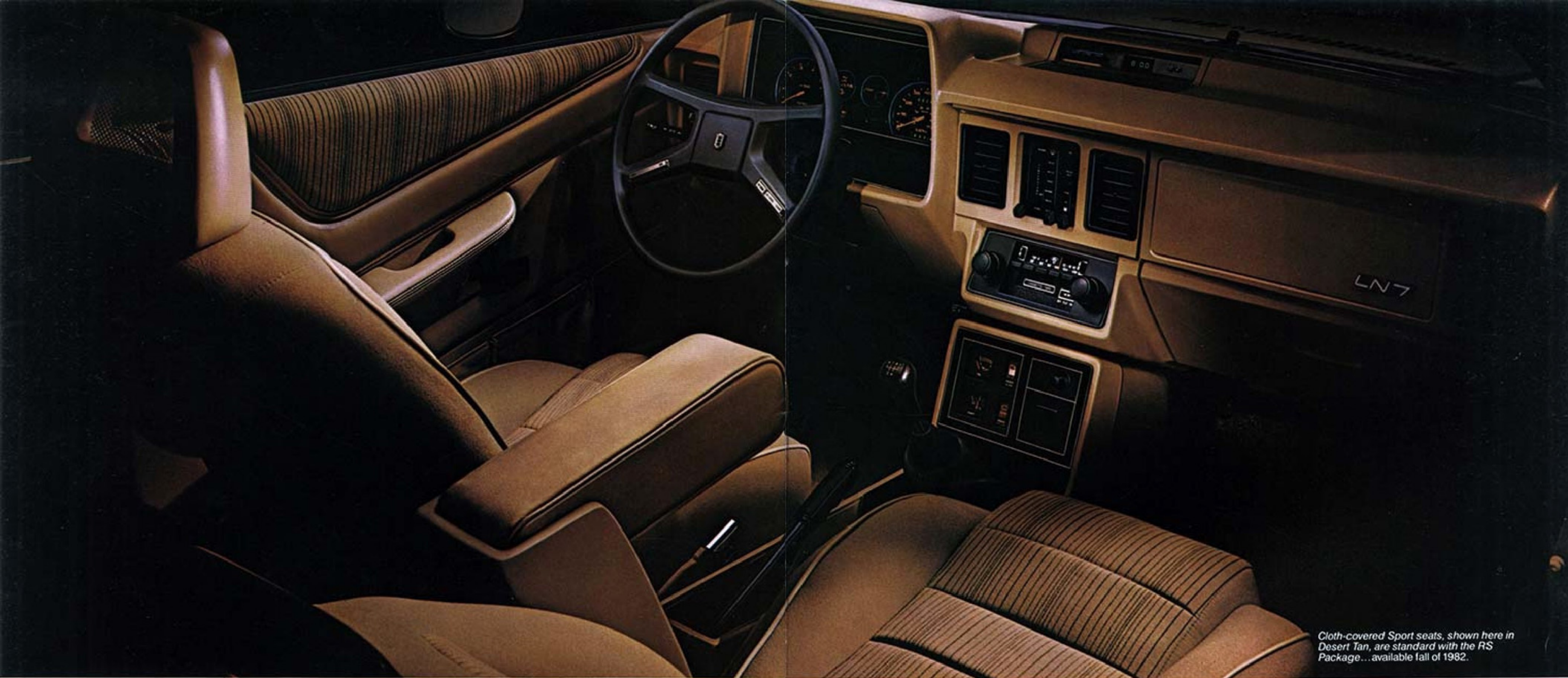
Cloth-covered Sport seats, shown here in Desert Tan, are standard with the RS Package...available fall of 1982.