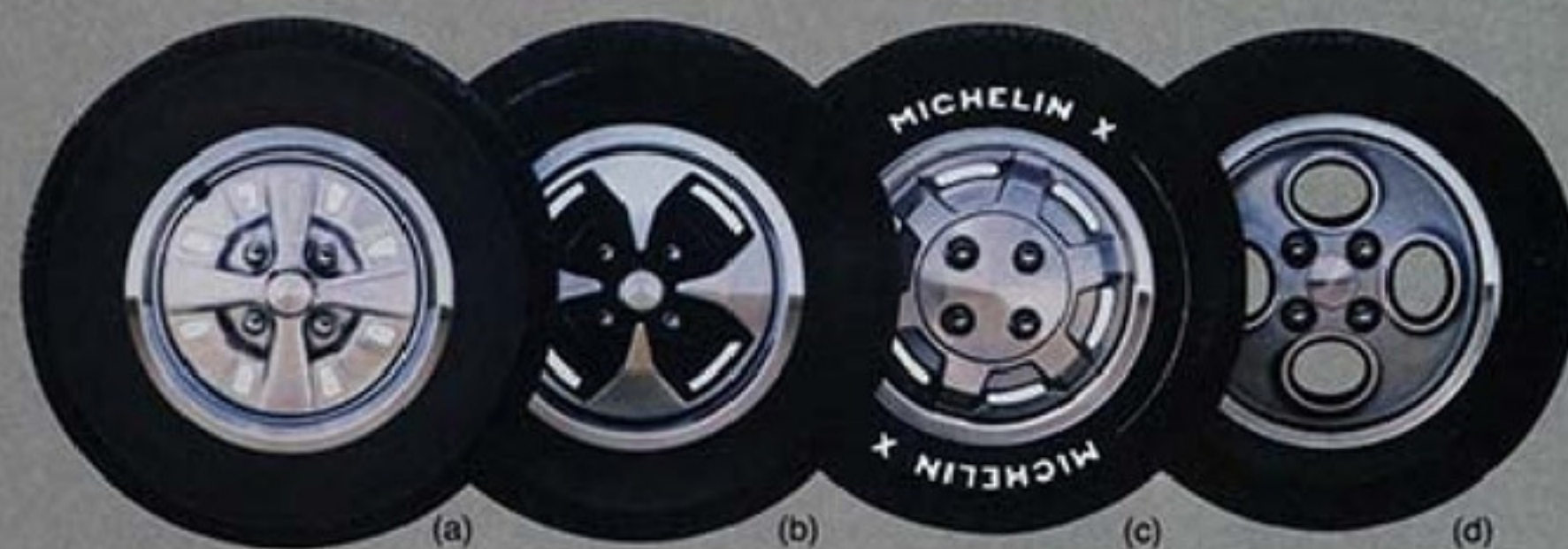
WHEELS AND TIRES. Handsome fully styled steel wheels (a) are standard on LN7.