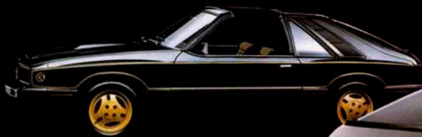
Mercury Capri Black Magic in Black and Gold with standard forged metric aluminum wheels and optional T-rod.