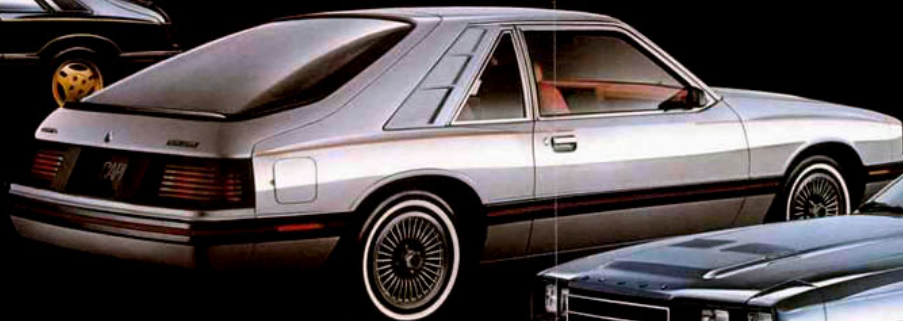
Mercury Capri GS in Dark Academy Blue with optional wire wheel covers.