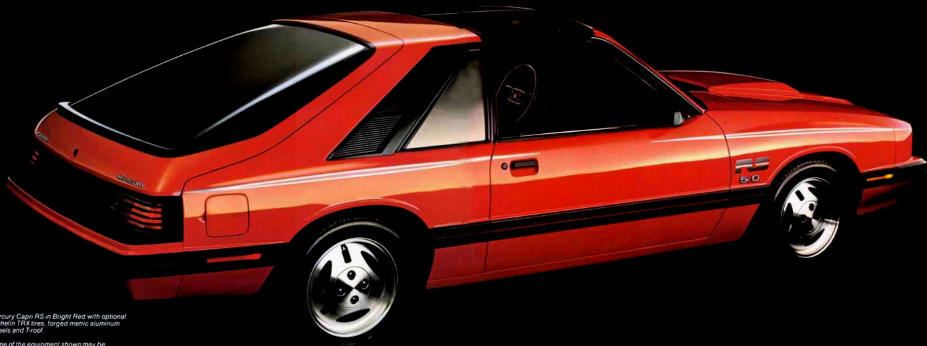
Mercury Capri RS in Bright Red with optional Michelin TRX tires, forged metric aluminum wheels and T-roof.

Some of the equipment shown may be available only at extra cost. Please see pages 8 through 11 for specific information regarding standard and optional equipment.