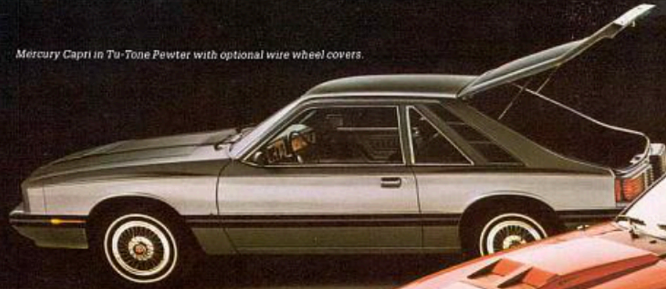
Mercury Capri in Tu-Tone Pewter with optional wire wheel covers.