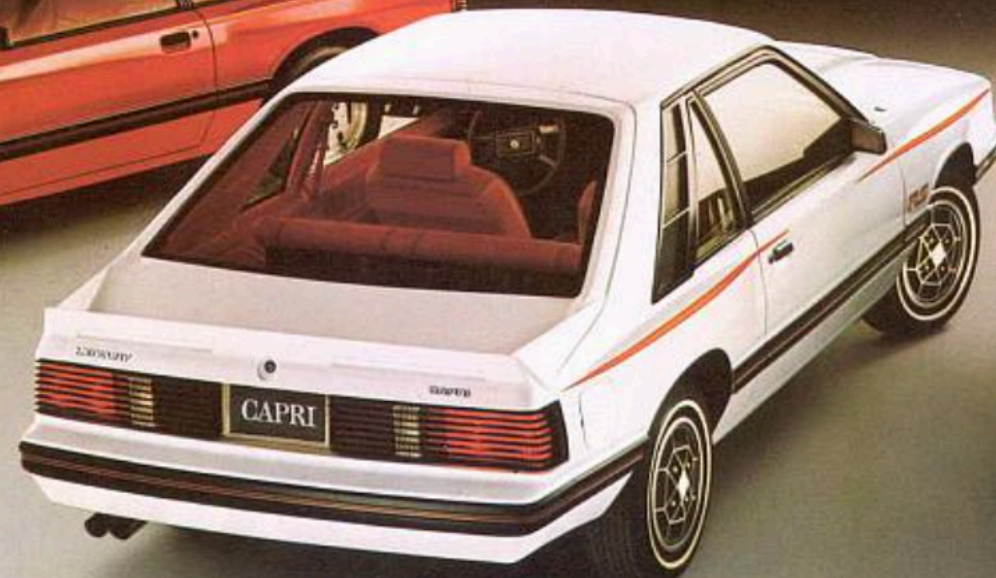
Mercury Capri RS in White with sport wheel covers.