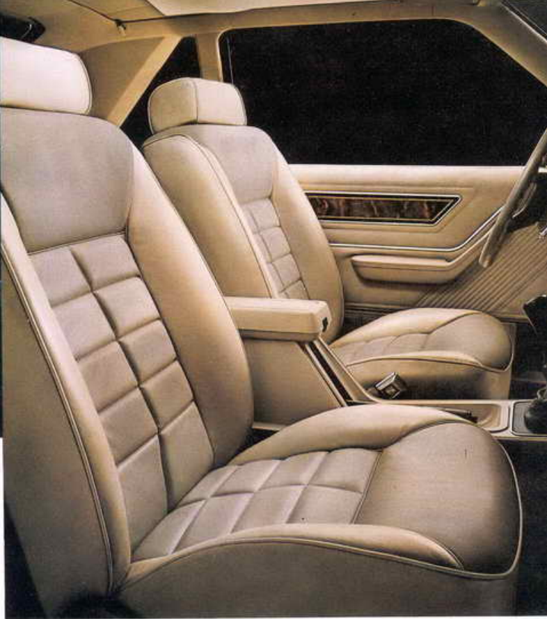
Optional leather interior. Low-back bucket seats shown in leather with vinyl trim, optional console.

No matter which interior you choose, you'll be in comfort in Capri.