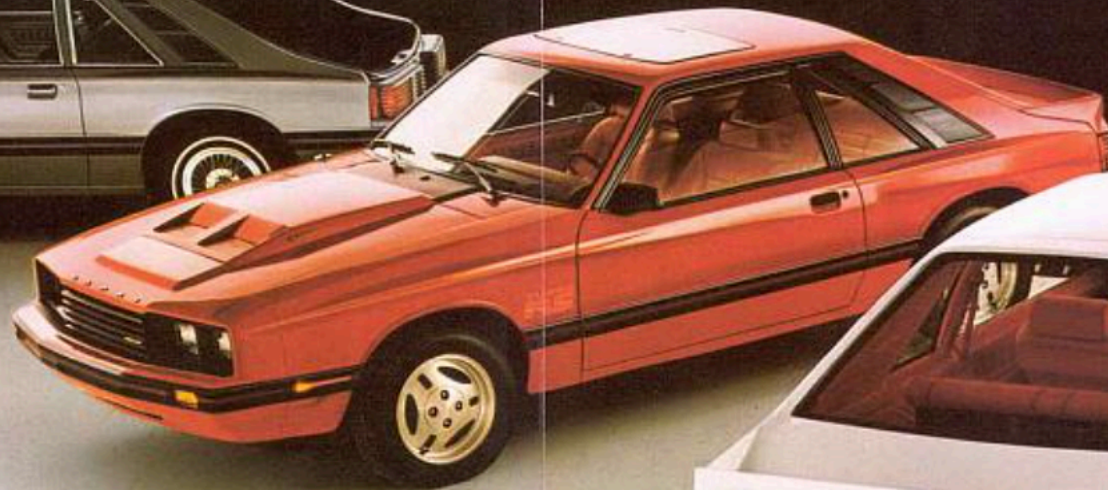
Mercury Capri Turbo RS in Bright Red with TRX forged aluminum wheels and optional flip-up removable moonroof.