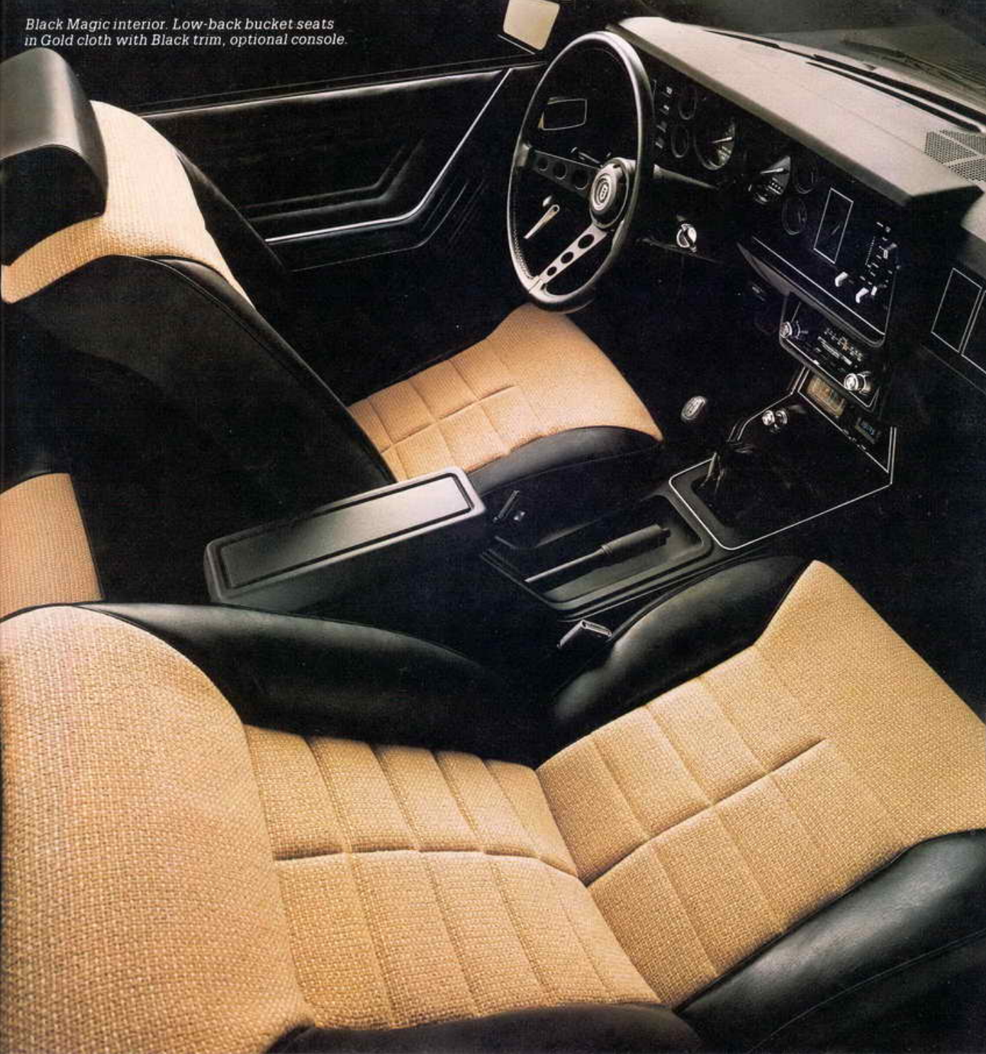
Black Magic interior. Low-back bucket seats in Gold cloth with Black trim, optional console.