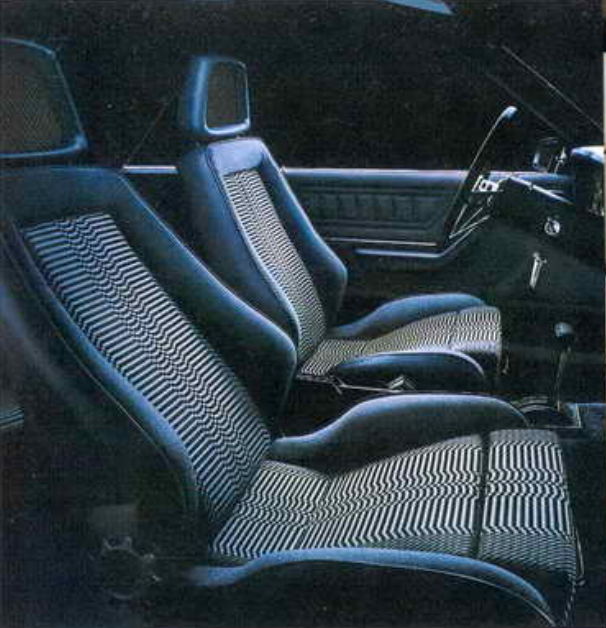
Optional Recaro bucket seats in Blue cloth.

In one glance you'll see that Capri's bold, exciting styling extends to its interiors. All Capris come with sporty low-back bucket seats with reclining seatbacks. And you have many choices of materials, colours, and configurations.