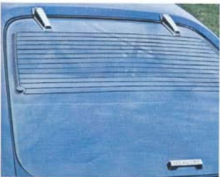
Standard rear window defroster