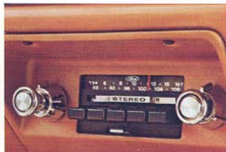
Optional AM/FM Stereo radio