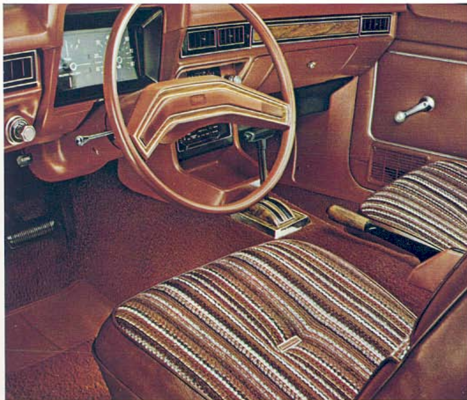
Optional deluxe interior trim with Vaquero Scanda cloth seat trim option

NOTE: Some items are optional. See notable standard features, measurements and color code reference listed throughout this catalog.