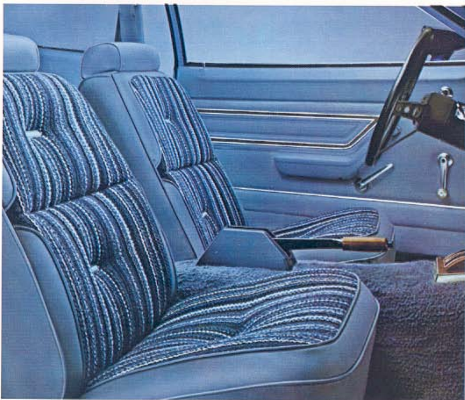
Deluxe interior in Wedgewood blue Scanda cloth—also available in medium red, caramel and Vaquero colors

back panel. Each package offers a wealth of sporty accents detailed on page 7.