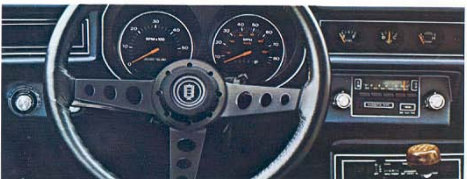
Optional Sports Instrumentation Group, including tach, gauges and sports steering wheel

NOTE: Some items are optional. See notable standard features, measurement and color code reference listed throughout this catalog.