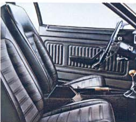
Runabout standard interior in black vinyl

NEW EXTERIOR FLAIR! To liven up your 1980 Runabout, you can choose between two packages. The Runabout in the foreground features the new Sport Option . It's the sportiest looking Runabout ever! Check the front air dam, racy rear spoiler, sporty paint and tape treatment and optional cast aluminum wheels. Its handsome mate features the Sports Accent Group , shown with the new Tu-tone paint option. It can be distinguished by the tape and paint treatment on the lower bodyside and lower