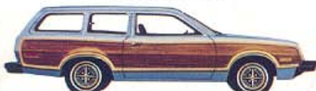
Bobcat Villager Wagon