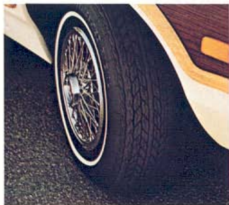
Optional white sidewall steel-belted radial

DRESS YOUR WAGON WITH DESIRABLE OPTIONS. The options pictured