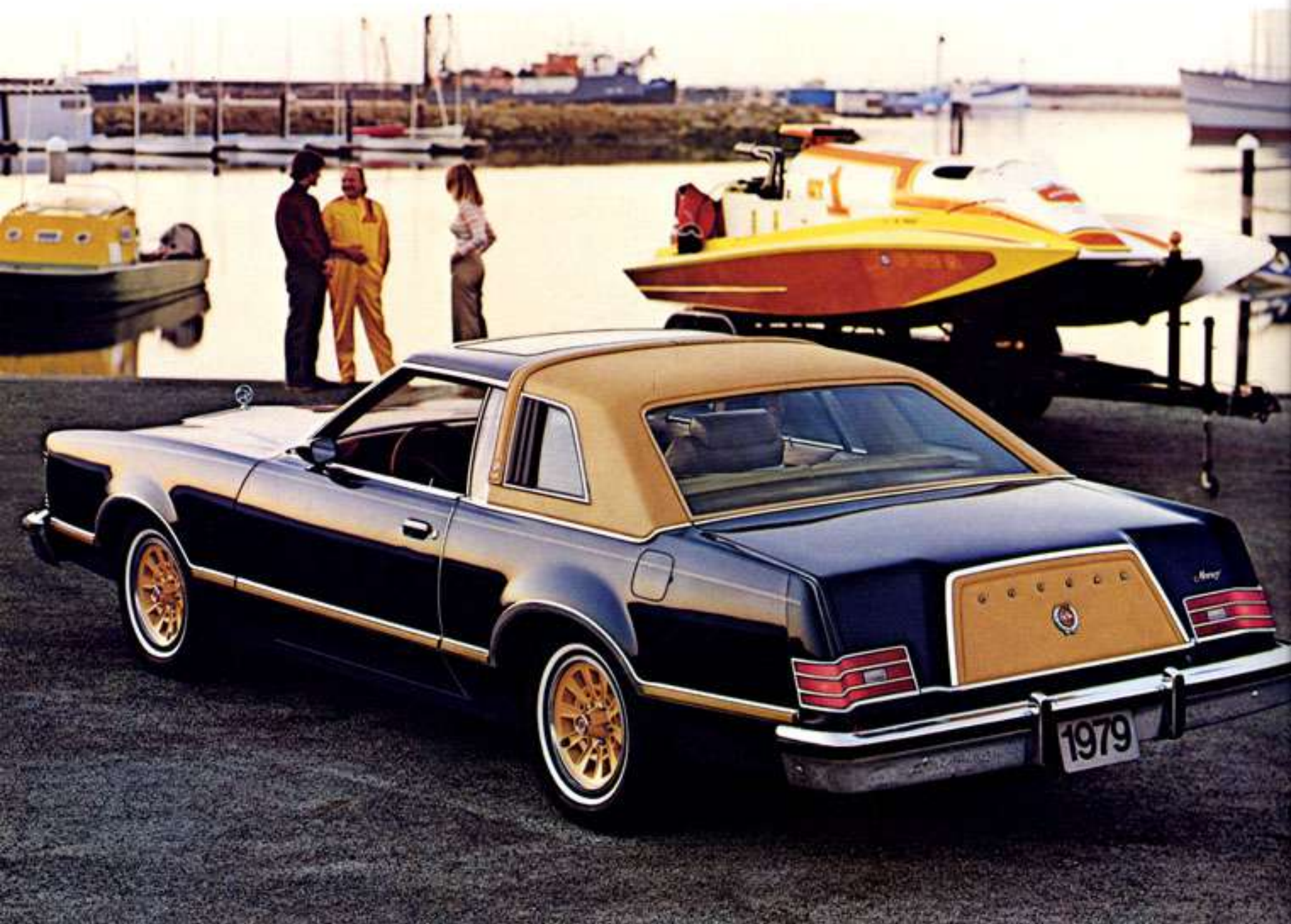
1979 Mercury Cougar XR-7 w/Chamois Decor Group Option

In addition to Cougar XR-7, there are two-door and four-door Cougars with Brougham Option, and the Mercury Cougar two-door and four-door models. A wide choice in fine Cougars to help make entry into the Cat Set compatible with your budget and taste.