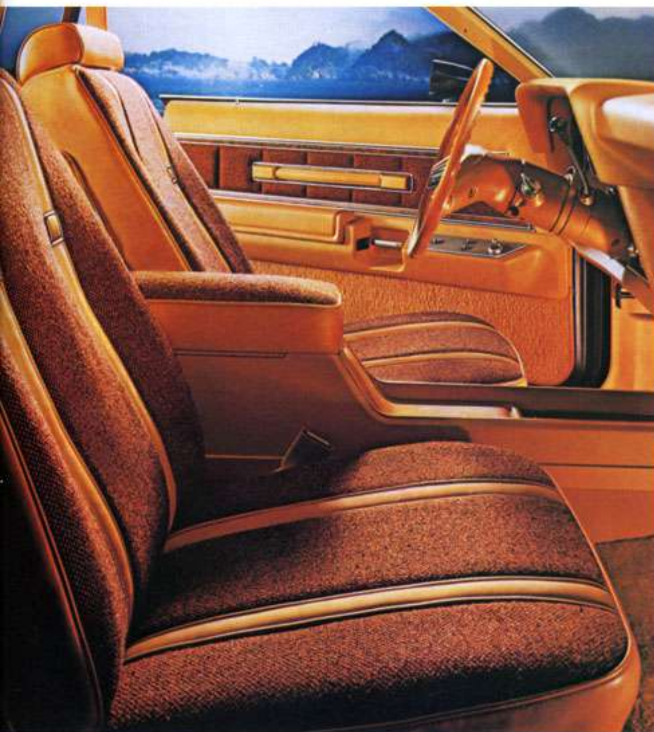
Chamois Decor Group option bucket seats in Huntsman Cloth w/saddle vinyl trim

The optional AM/FM stereo radio with 8-track tape, shown below right, is one of seven entertainment units for Cougar, any one of which may be combined with the optional 40-channel CB radio. And note, in another illustration below right, the spaciousness of the Cougar luggage compartment, with the inflatable space-saver tire available as replacement for the conventional spare at no extra cost.