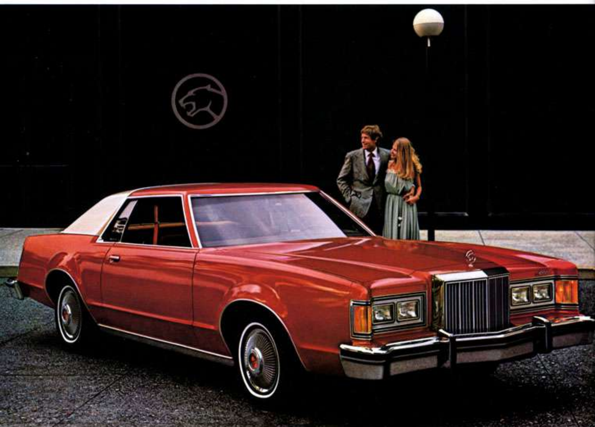
1979 Mercury Cougar 2-door hardtop

Illustrated below right is Cougar's interior with optional Flight Bench seat, including a folding center armrest,