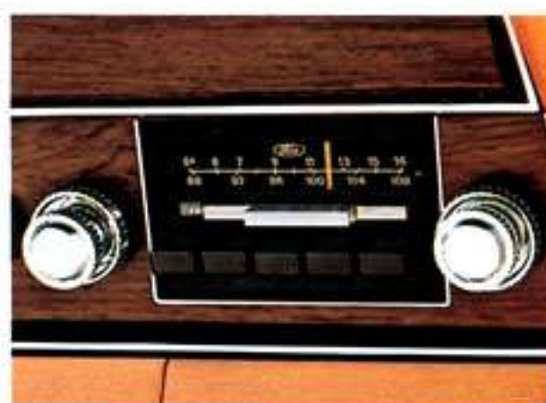
AM/FM Radio option