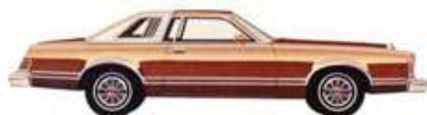
Cougar XR-7 with Decor Option

Corrosion Protection. For 1979 Cougar continues the use of pre-coated steel to provide corrosion protection in several body areas. A sealer is also used liberally on the underside of several lower body areas.