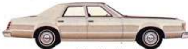
Cougar 4-dr. pillared hardtop