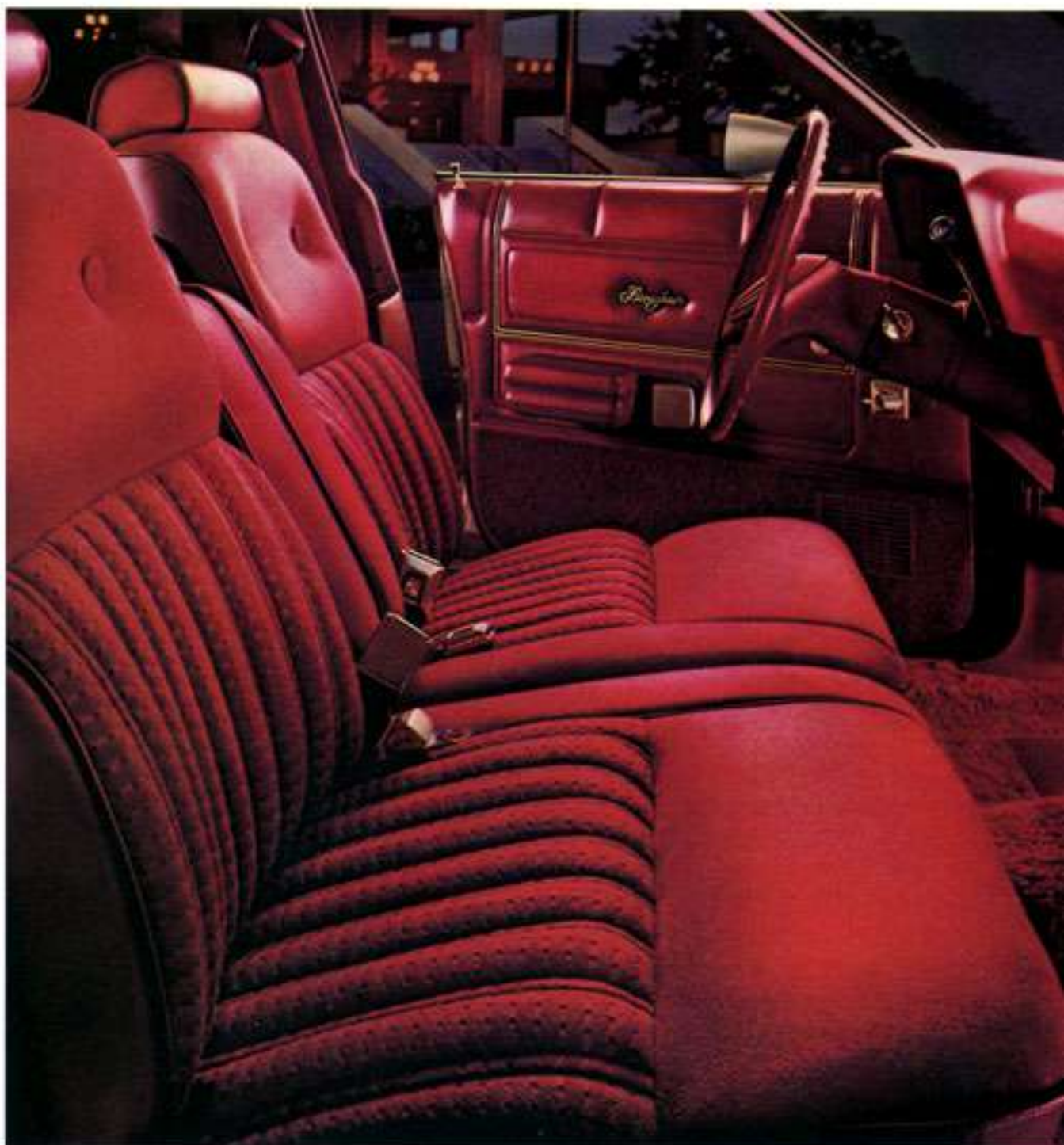
Twin Comfort Lounge seat interior available w/Brougham Decor Group option