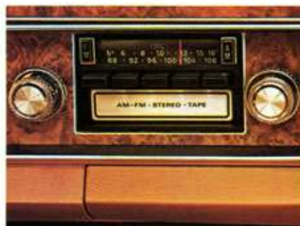
AM/FM stereo radio w/8-track tape