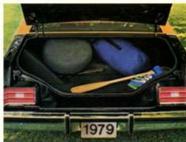
Cougar luggage compartment