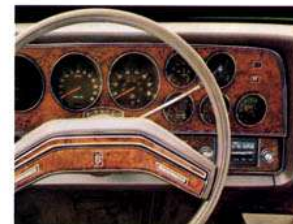
Sports Instrumentation Group option