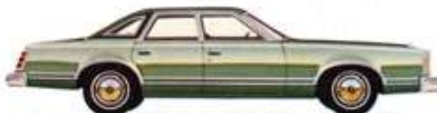
Cougar 4-dr. pillared hardtop with Brougham Option