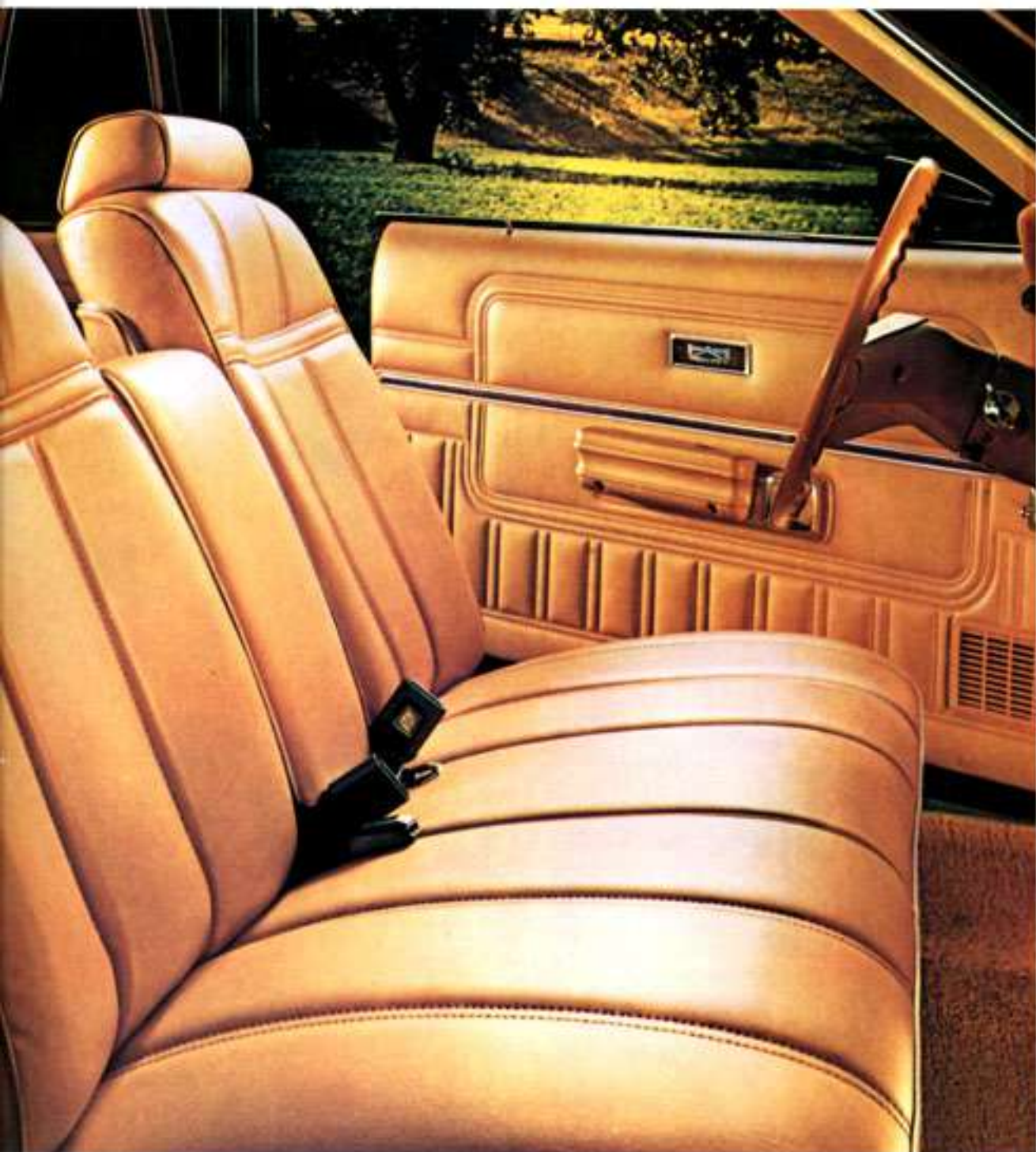
Mercury Cougar interior w/optional Flight Bench seat