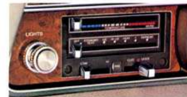
Air Conditioning option