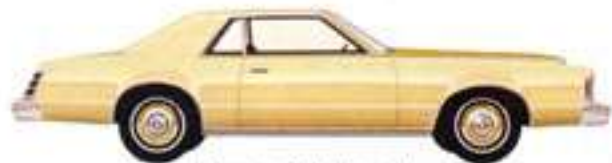
Cougar 2-dr. hardtop