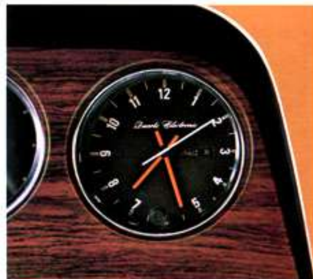
Optional Day/Date electric clock