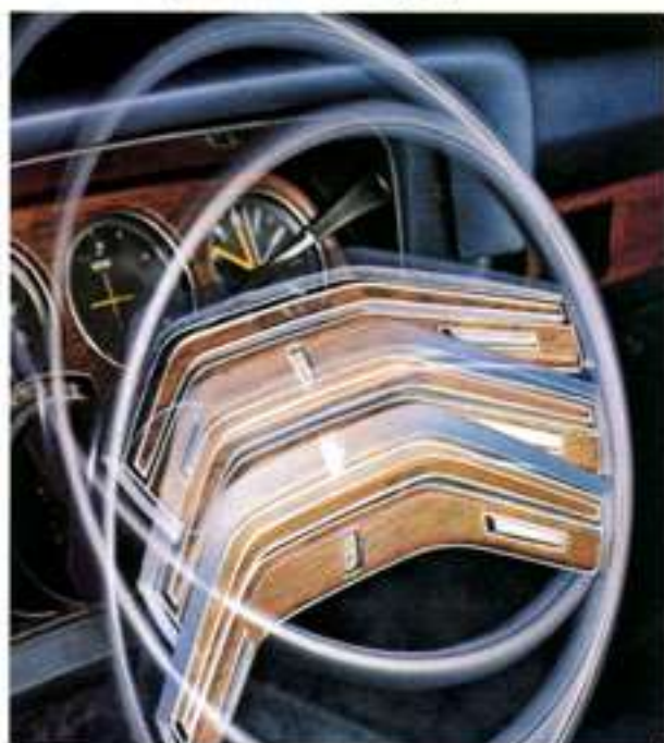
Optional Tilt Steering Wheel w/Speed Control option