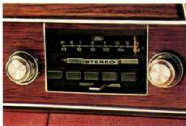
AM/FM Multiplex stereo radio option

Also shown below (left) is the AM/FM stereo radio with search feature, one of seven radio/radio-tape combinations to help entertain you as the miles pass by. You can add to that choice a 40-channel CB that uses the radio speaker system. On pages 10 and 11 you'll find a list of Cougar options—many illustrated—all designed to add to the pleasure of Cougar ownership.