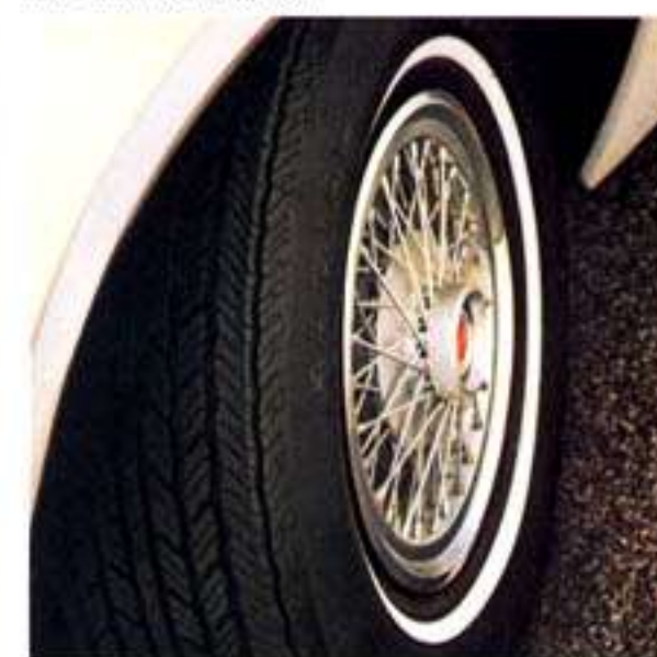
Optional Wire Wheels (4) w/white sidewall tire option