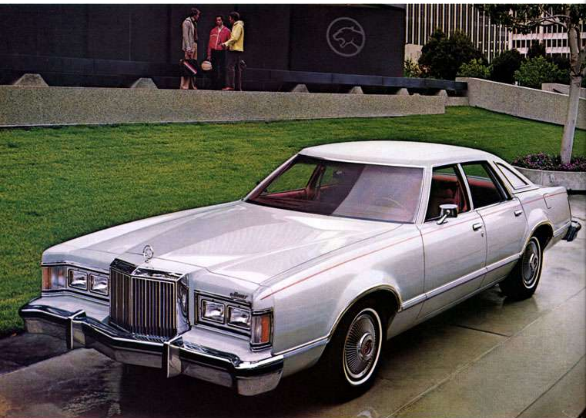
Cougar 4-dr. pillared hardtop w/Brougham Option

For added good looks and comfort with your Brougham Option, you can include the Decor Group option. This features Twin Comfort Lounge seats with passenger recliner. Also included: nylon cut-pile carpeting, luxury steering wheel, deluxe seat belts and color-keyed vinyl inserts in wide bodyside moldings.