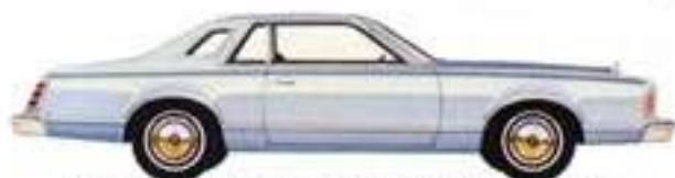
Cougar 2-dr. hardtop with Brougham Option