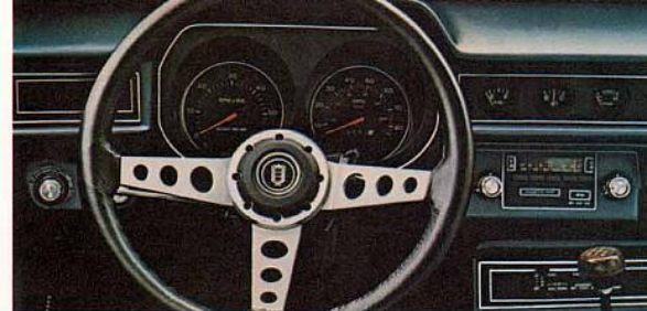
Bobcat optional Sports Accent Group w/Sports Instrumentation (See page 7 for detail)

Check Bobcat's new vertical grille, its new power dome hood, and don't overlook its rectangular headlamps and parking lamps. Inside, Bobcat has a new instrument panel. We think you'll agree that Bobcat's a sporty cat, and a value cat with rack-and-pinion steering, AM radio, tinted glass, styled steel wheels with trim rings and steel-belted radial tires, all standard. (The AM radio may be deleted for credit.)