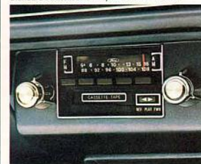
Optional AM/FM radio w/cassette tape

NOTE: Some items are optional. See notable standard features, measurements, and color code reference listed throughout this catalog.