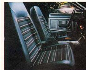
Standard bucket seats in optional Kirsten cloth