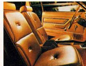
Optional low-back bucket seats in chamois vinyl.

NOTE: Some items are optional. See notable standard features, measurements, and color code reference listed throughout this catalog.