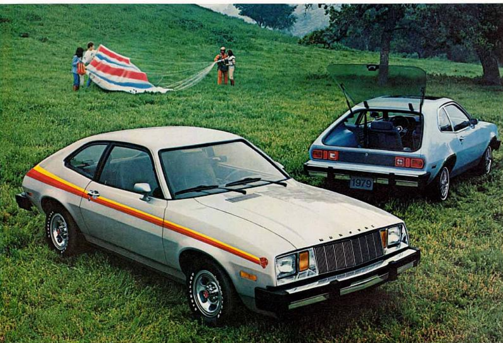
Mercury Bobcat Runabout w/Sports Package Option (foreground) and Runabout w/Sports Accent Group