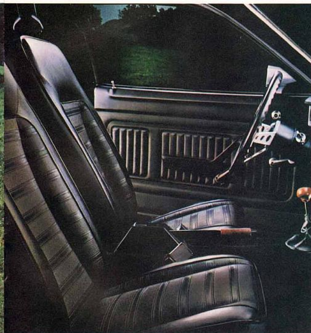
Runabout standard interior in black vinyl