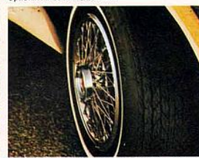
Standard steel-belted radials w/opt. white sidewalls.