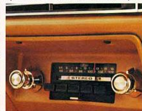
Optional AM/FM stereo radio