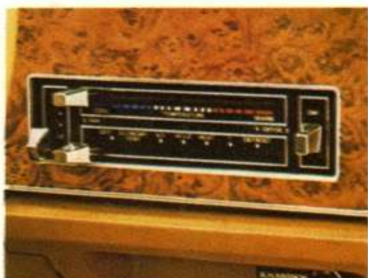
Automatic Temperature Control