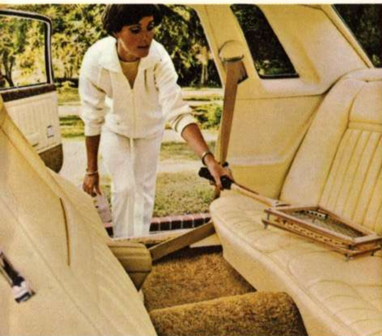
Easy rear entry