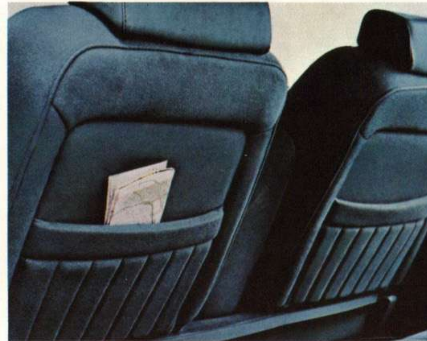
Seat-back map pockets