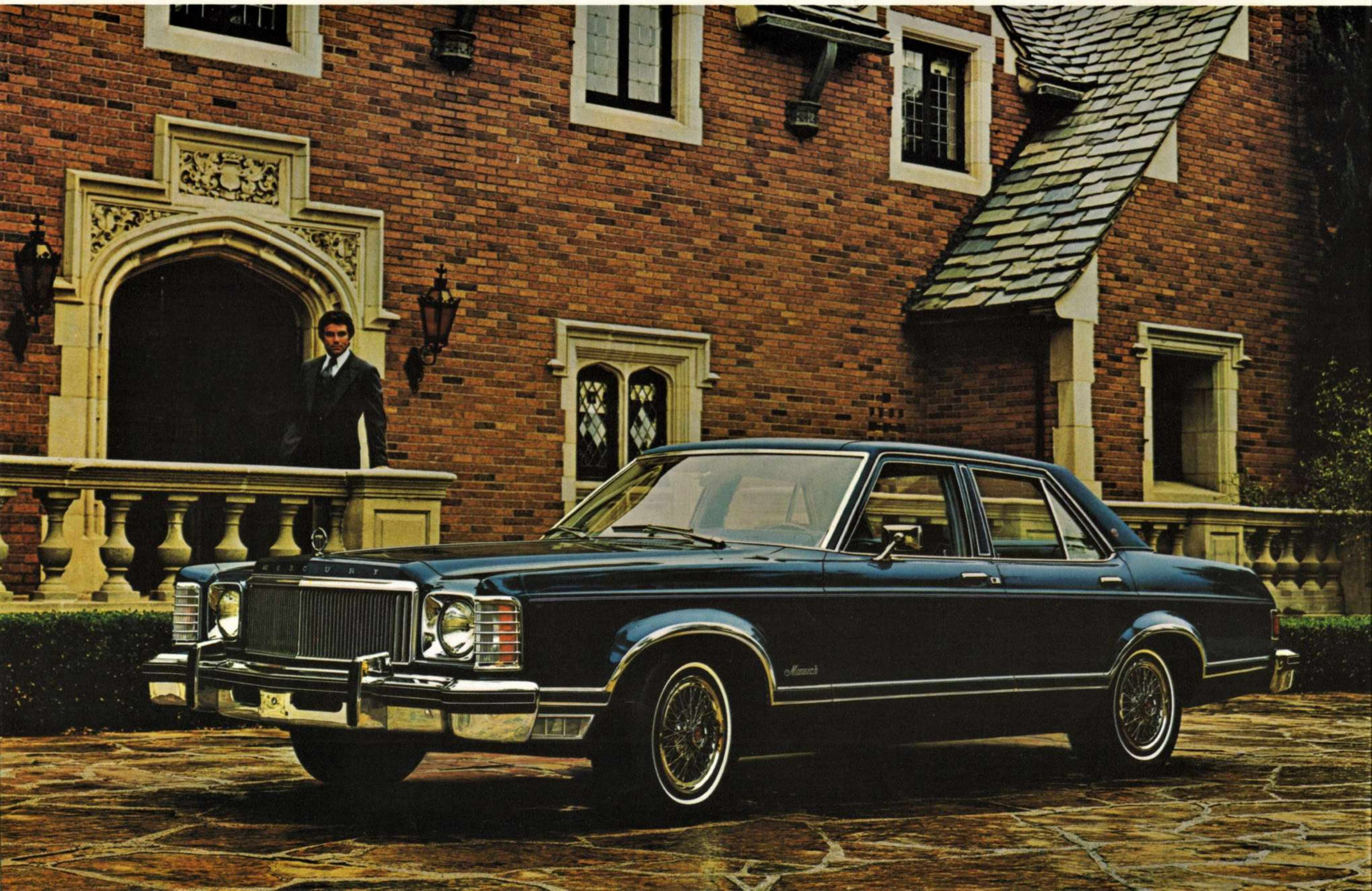
Mercury Monarch Ghia 4-door