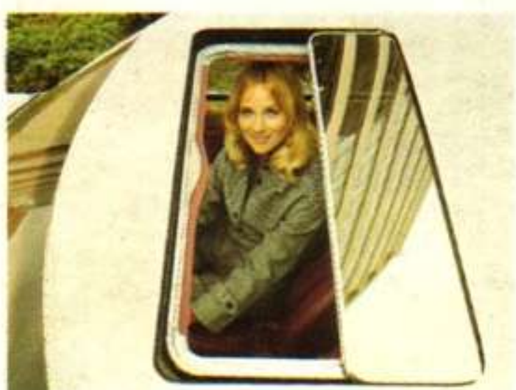
Sliding Glass Moonroof