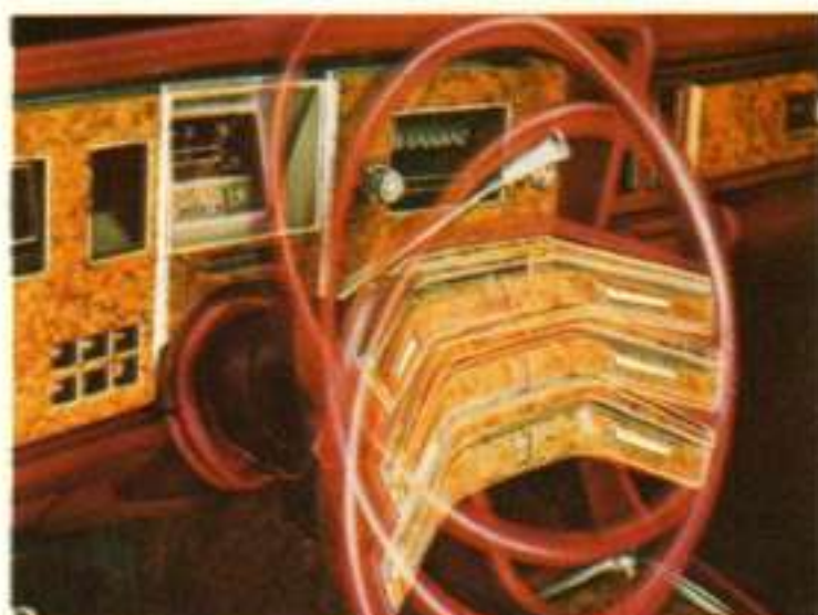
Tilt Steering Wheel