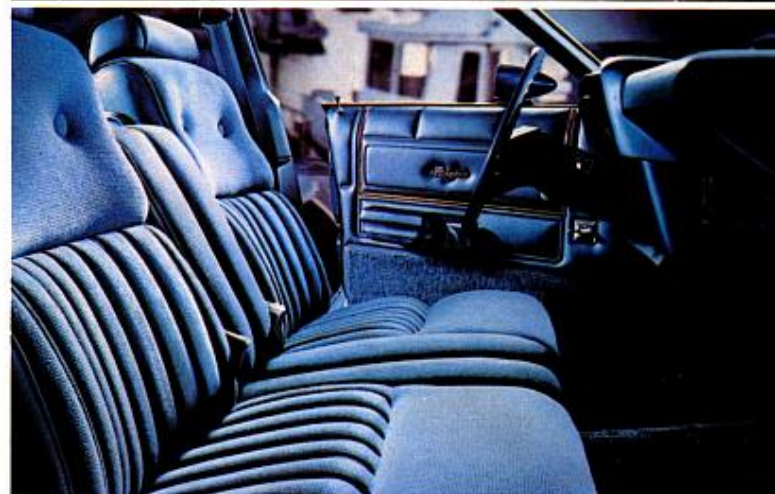
UPPER: Standard Flight Bench Seating