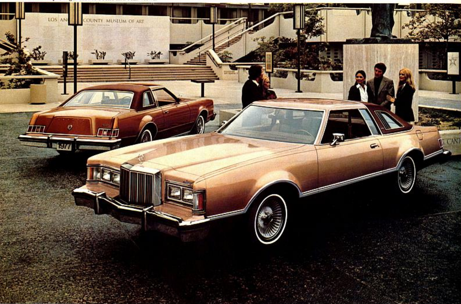
1977 Mercury Cougar XR-7. Front and rear views.