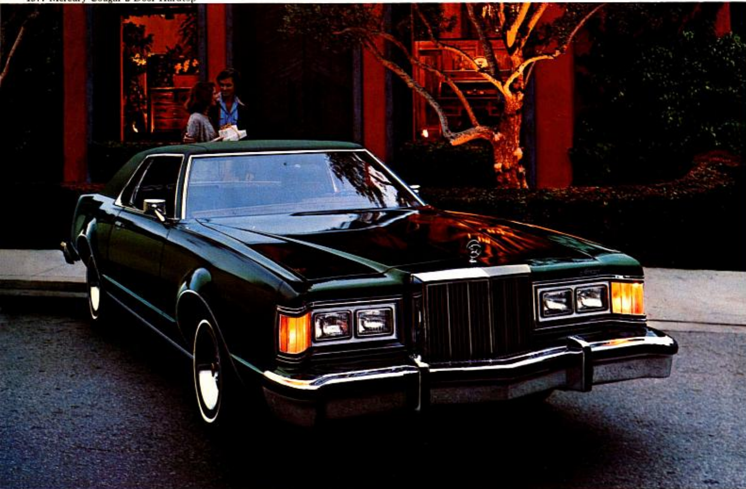
1977 Mercury Cougar 2-Door Hardtop