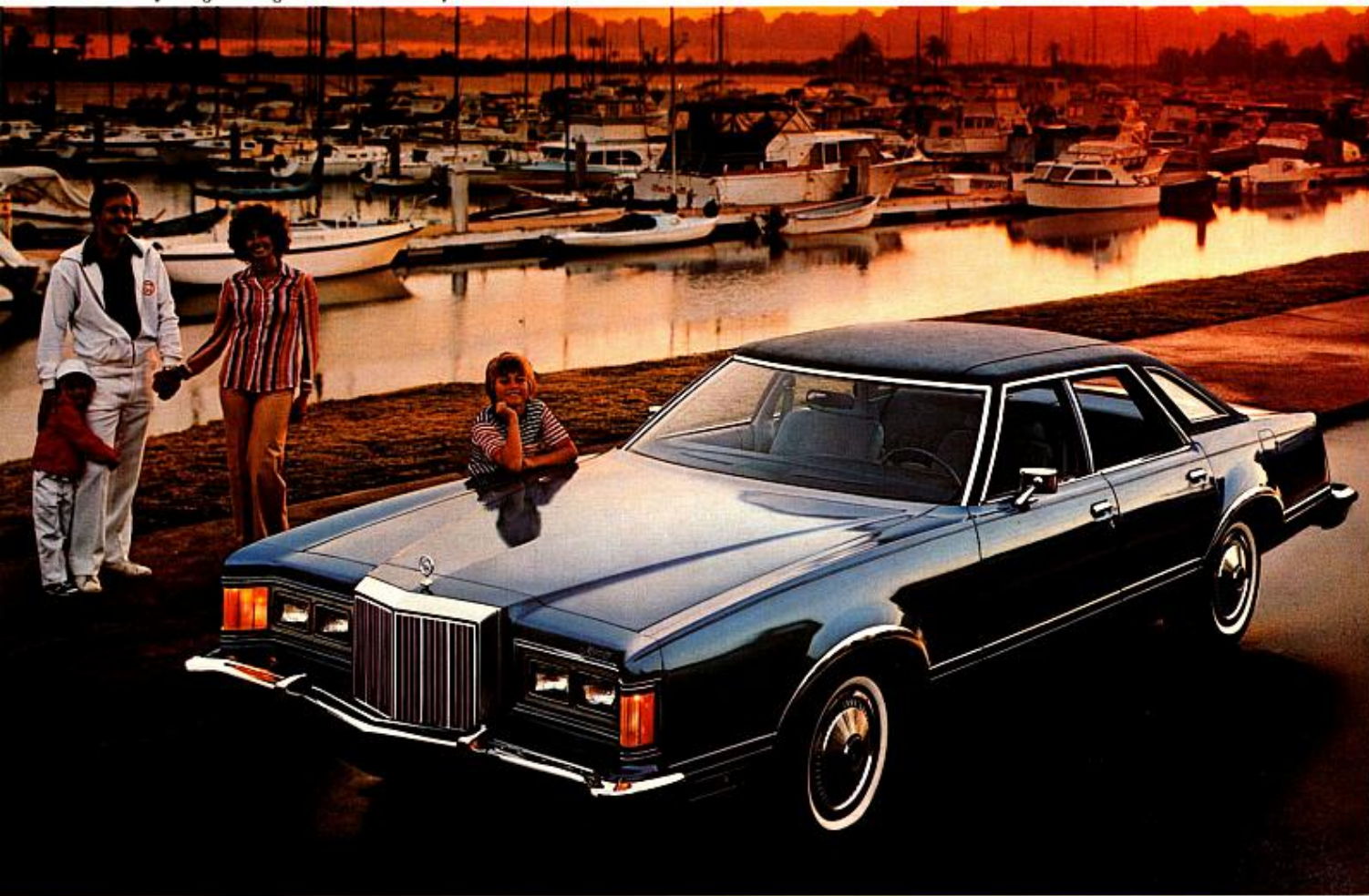
1977 Mercury Cougar Brougham 4-Door Hardtop

An elegant offspring of the renowned XR-7.