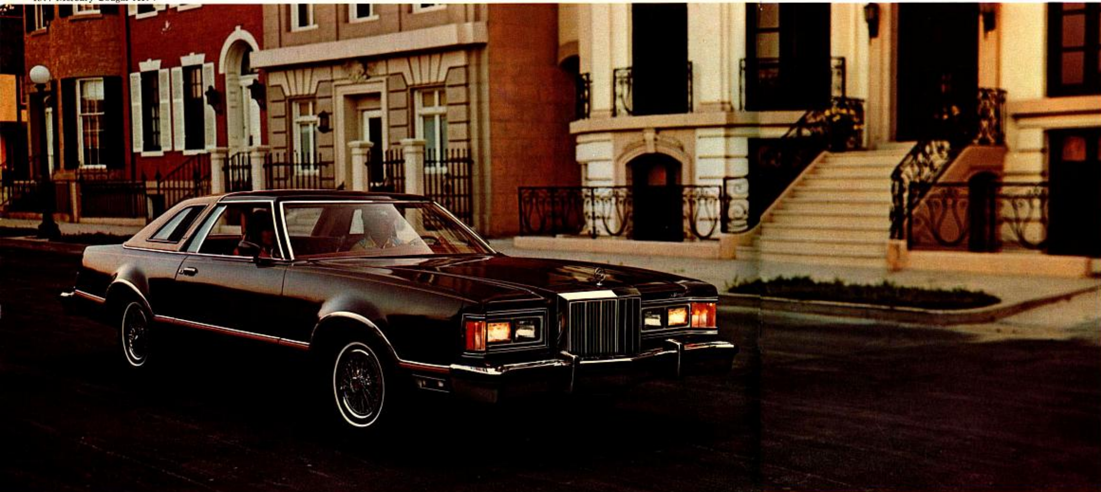
1977 Mercury Cougar XR-7