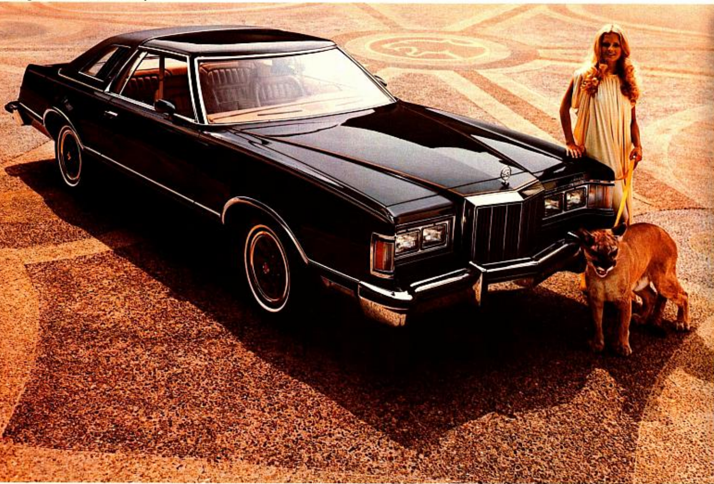
Cougar XR-7 with Decor Group