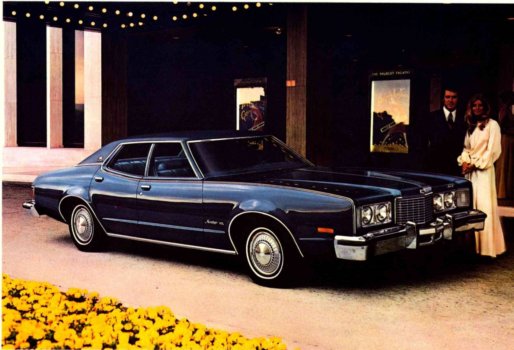
Below: Mercury Montego MX Brougham 4-door pillared hardtop

Standard features on Montego MX Brougham: 351-2V V8 engine • Select-Shift automatic transmission • Power brakes (front disc/rear drum) • Power steering • Solid-state ignition • HR78 x 14 BSW steel-belted radial tires • Impact resistant bumper system • Front bumper guards • Dual headlamps • Dual note horn • Luxury sound insulation • Deluxe wheel covers • Locking steering column • Concealed windshield wipers • Colour-keyed cut-pile carpeting • Flight bench seat • Front and rear armrests • Deluxe colour-keyed seat and shoulder belts • Ford Motor Company Safety Design Features.