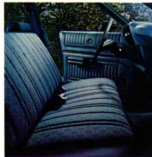
Above: Montego MX standard interior in cloth and vinyl.

There's a full list of options you can add to your new Montego