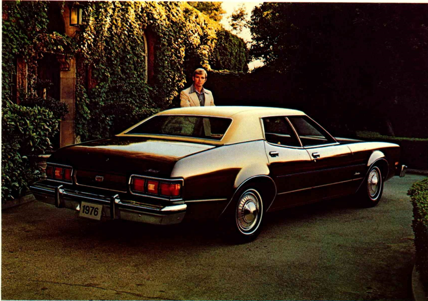
Below: Mercury Montego 4-door pillared hardtop.

351-2V V8 engine • Select-Shift automatic transmission • Power brakes • Power steering • Solid-state ignition • HR78 x 14 BSW steel-belted radial tires • Impact resistant bumper system • Front bumper guards • Dual headlamps • Anti-theft ignition lock • Concealed windshield wipers • Wiper-mounted windshield washer spray jet • Thick cut-pile carpeting • Bright wheelip mouldings • Bright roof drip rail mouldings • Ford Motor Company Safety Design Features.