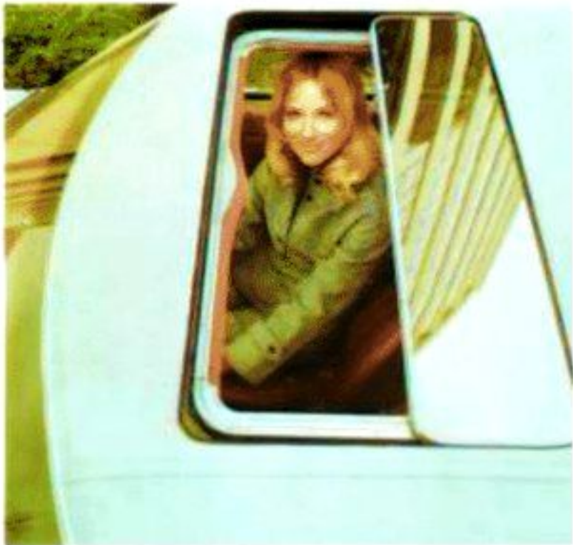
Optional MoonRoof has electrically powered sliding panel of one-way glass.

such standard features as a 250-1V six-cylinder engine, solid-state ignition, high level ventilation and inside hood release. Monarch Ghia