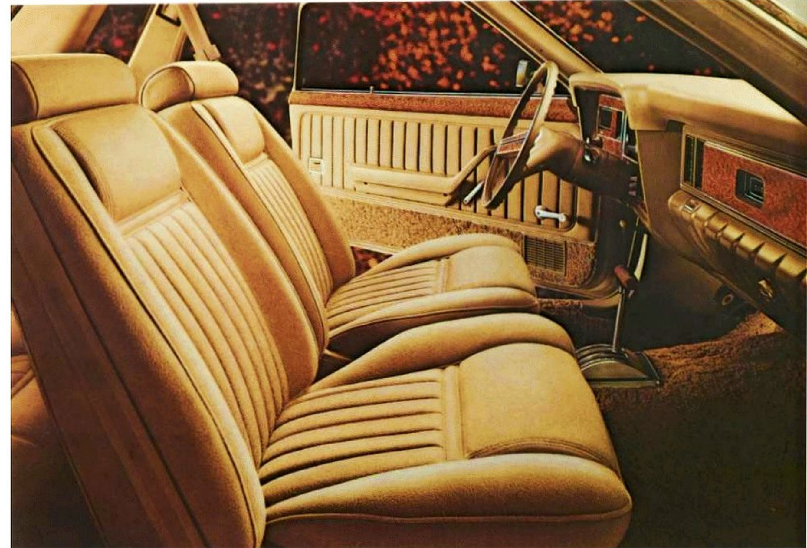
Below: Monarch Ghia interior with optional bucket seats in tan cloth