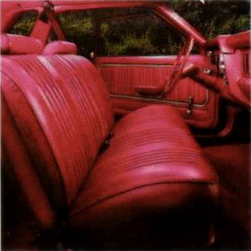
Mercury Monarch standard bench seat in all-vinyl.

covers. And the new Monarch 2-door and 4-door sedans have been