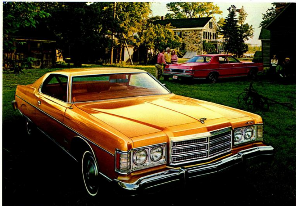
Rear: Montcalm 4-door pillared hardtop.