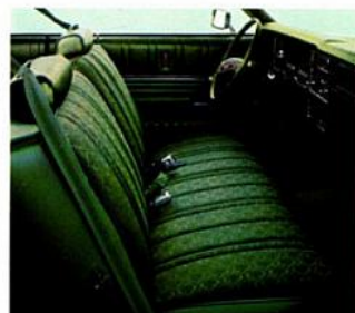
Above: Rideau 500 standard interior in Barletta cloth and vinyl.

And you have the opportunity to add a little taste of your own to your new Rideau 500. There's a list of optional equipment including: tinted glass, digital clock; visibility light group; fingertip speed control; and much more. Your Mercury dealer will be pleased to tell you all about them. Meteor Rideau 500. Basically, a true value car.