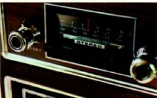
Below: Optional AM/FM multiplex stereo radio (requires power antenna at extra cost).