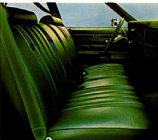
Above: Montcalm optional all vinyl interior.