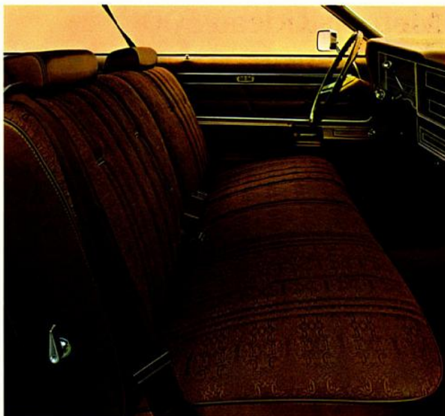
Below: Meteor Montcalm 4-door pillared hardtop.