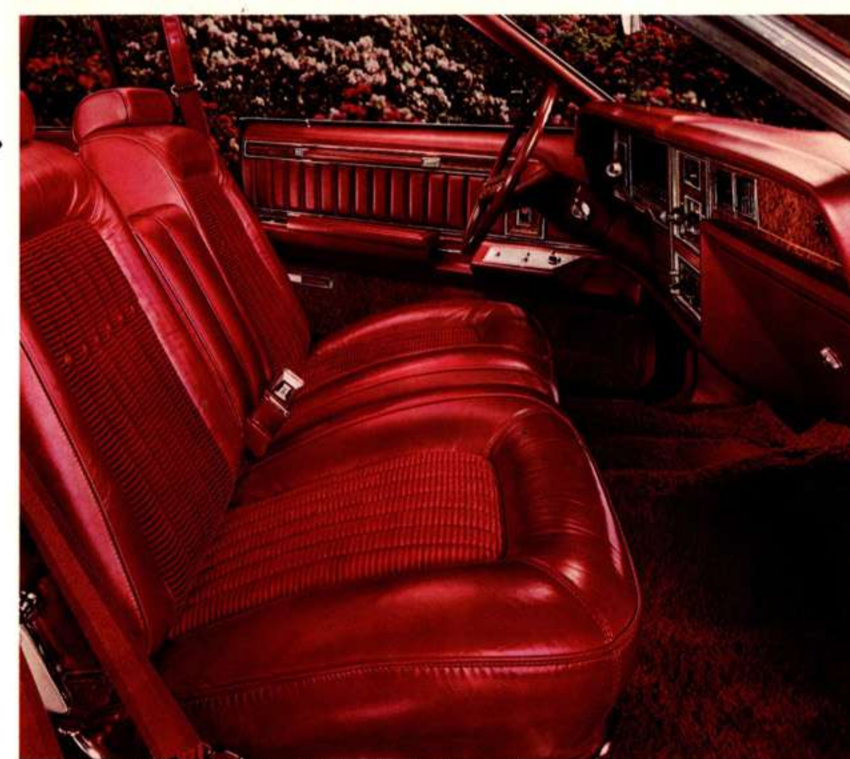
Mercury Grand Marquis interior with Twin Comfort Lounge Seats.

guards • Steel-belted radial tires • Power steering • Power brakes • Power ventilation system • Power windows • Electric rear window defroster • Concealed headlamps • Concealed windshield wipers • Left-hand remote control mirror • Tinted glass • Vinyl roof • Deluxe sound insulation • Fender skirts • Digital clock • Visor-mounted vanity mirror • Deep shag cut-pile carpeting • Luxury steering wheel • Carpeted luggage compartment • Automatic seat back release on 2-door models • Dual dome/map reading lamp • Full-length bodyside moulding with colour-keyed vinyl insert • Twin Comfort Lounge Seats • Hood and deck lid paint stripes • Ford Motor Company Safety Design Features.