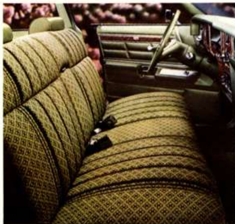
Mercury Marquis standard interior in cloth and vinyl.

fuel economy improvement as well as better driveability in terms of easier starting, better stop-and-go response and smoother acceleration. In addition, there are optional engines that run on lower-priced regular gasoline that's readily avail-