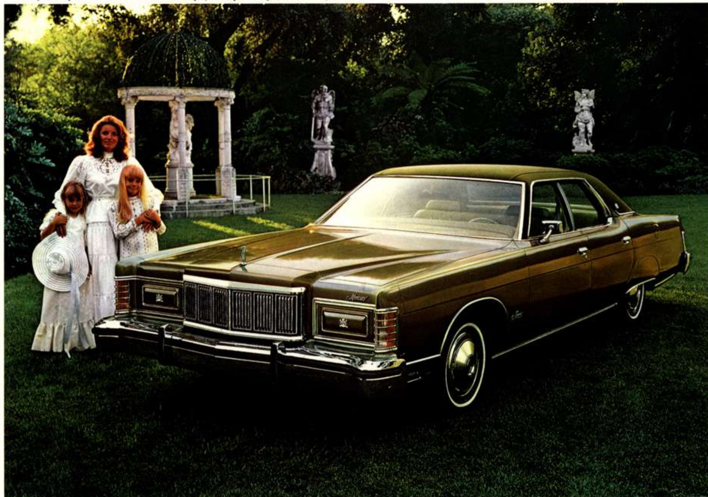
Mercury Marquis 4-Door Pillared Hardtop (with optional fender skirts)

Marquis: 400-2V V-8 engine • Select-Shift automatic transmission • Solid state ignition • HR78 x 15 steel-belted radial tires • Power steering • Power front disc and rear drum brakes • Automatic seat back release on 2-door models • Power ventilation system • Concealed headlamps • Concealed windshield wipers • Electric rear window defroster • Deep cut-pile carpeting • Deluxe wheel covers • Automatic parking brake release • Rocker panel and wheel lip mouldings • Ford Motor Company Safety Design Features.