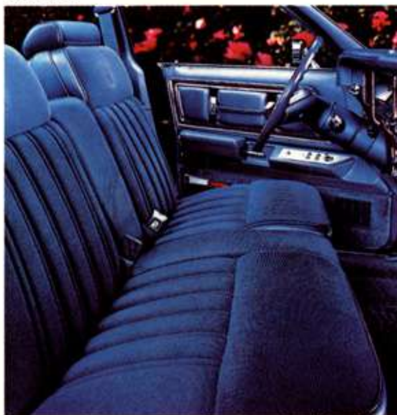
Mercury Marquis Brougham standard interior with Flight bench seat.

And outside, Marquis Brougham features the elegance of a standard vinyl roof, bright fender peak mouldings, fender skirts and the classic touch of Brougham wheel covers.