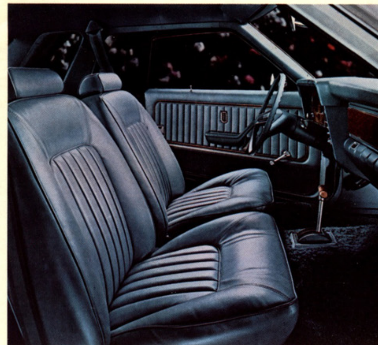
Mercury Monarch standard interior with optional floor mounted shift.

instrument panel with high-gloss vinyl woodgrain, there is a look of rich luxury about this interior (shown right). Individually reclinable bucket seats are upholstered in supple vinyl, available in black, dark red, silver blue, green and tan. A Decor Option is also available in super-soft vinyl seat trim with map pocket and assist rails. This interior includes 22-oz. cut-pile shag carpeting, luxury steering wheel and day/night mirror.