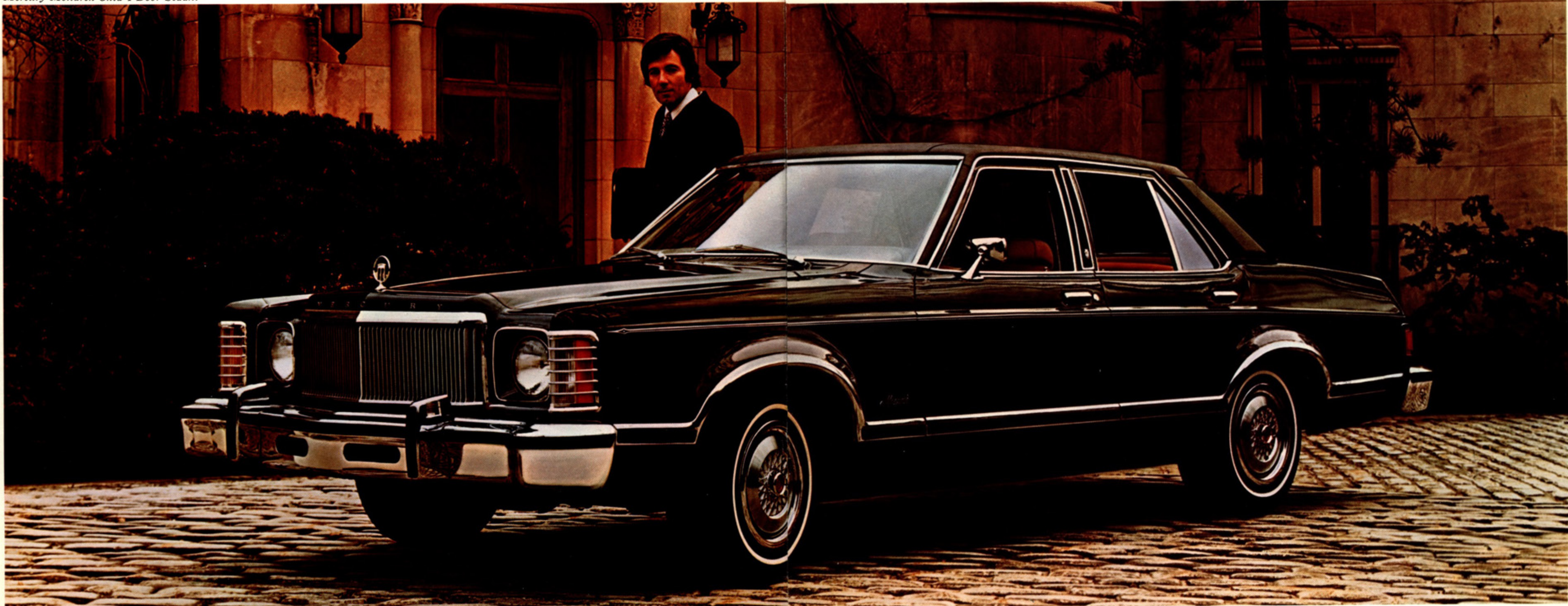
Mercury Monarch Ghia 4-Door Sedan.