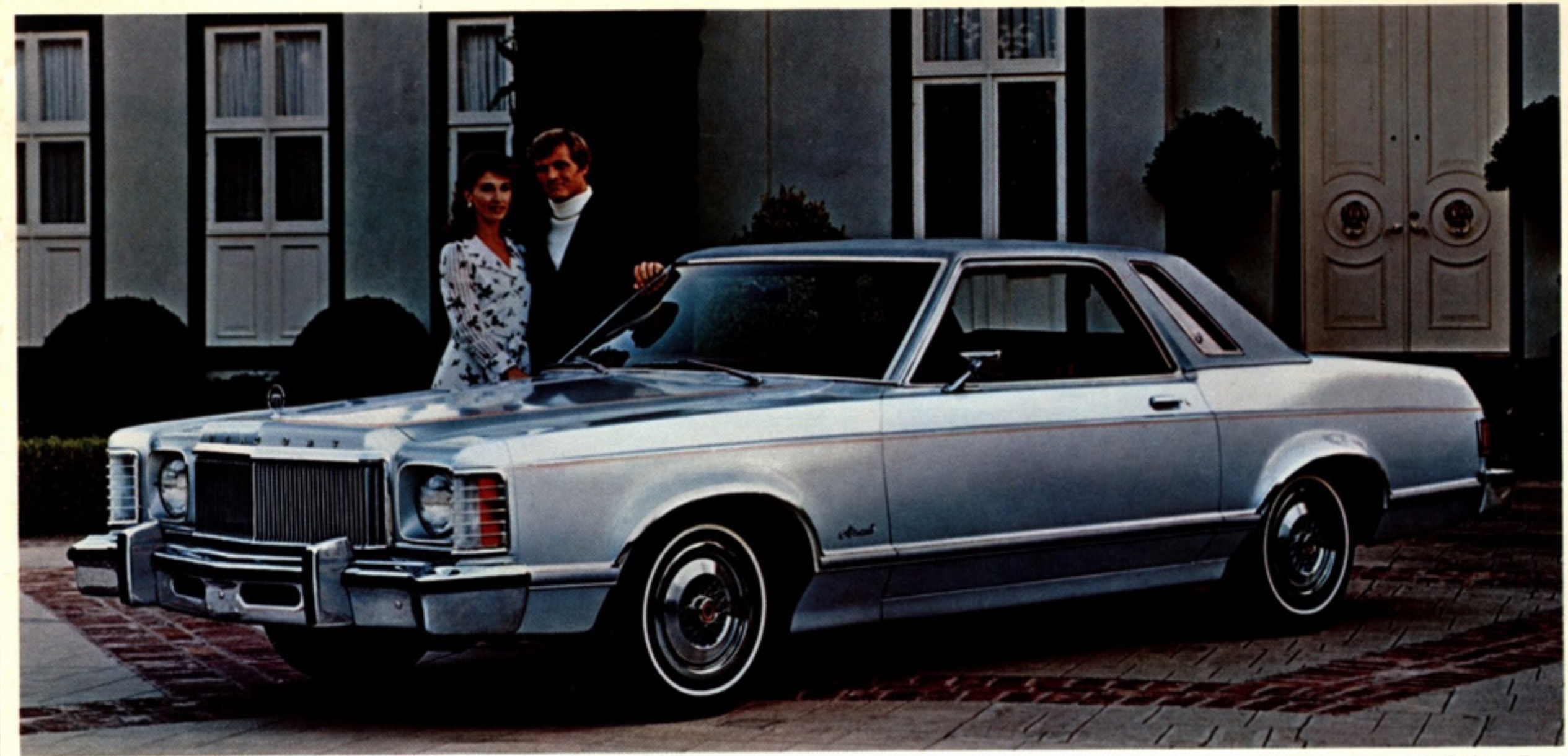
Mercury Monarch Ghia 2-Door

250-IV "Six" engine • 3-speed manual transmission • Front disc brakes • Solid-state ignition • High-level ventilation • Inside hood release • Foot-operated parking brake • WSW steel-belted radial tires • Odense grain bodyside molding • Energy absorbing bumper system with front and rear bumper guards • Articulated windshield wipers • Deluxe sound and ride package • Dual note horn • Digital clock • Luxury steering wheel • Day/night interior mirror • 22-oz. cut-pile carpeting • Left-hand remote control outside mirror • Odense grain vinyl roof • Unique Ghia wheel covers • Deluxe colour-keyed seat belts • Carpeted luggage compartment • Ford Motor Company Safety Design Features.