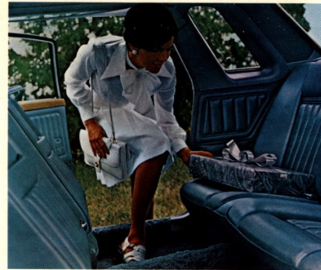
The Mercury Monarch 2-Door Sedan affords remarkable ease of entry and exit, this is a luxury touch unusual in a car of this size.