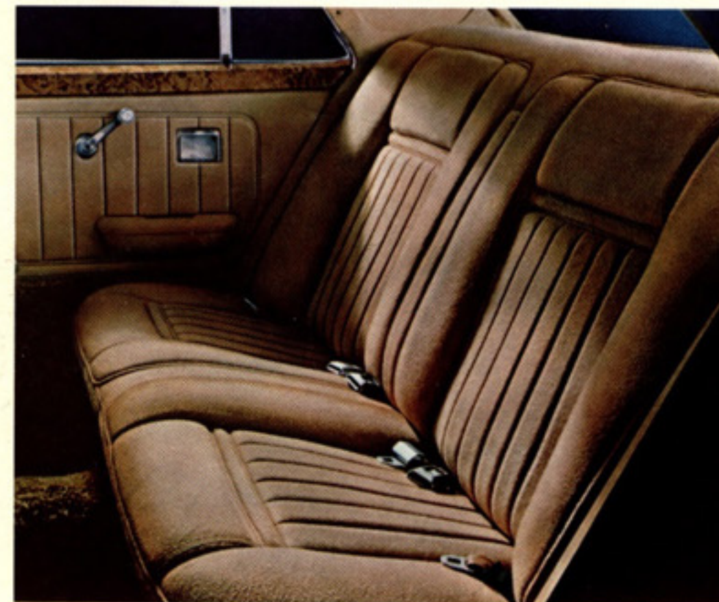
Mercury Monarch's rear contoured seats offer passengers rewarding comfort together with plush luxury.

Seldom has such a high level of interior luxury been presented in a car of such precision size. Monarch Ghia's seats are deeply contoured; the front seat backs individually reclinable. In front, you settle back in deep, glove-soft bucket seats with extra thickness and foam padding to cushion you in long distance comfort. Underfoot is thick shag carpeting. Instrument panel registers afford "comfort control" ventilation as you drive. Handsomely set off against vinyl woodgrain, instruments and digital clock are positioned for ideal visibility. Rear door hinges are canted to permit graceful entry and exit. Note the handsome detailing of map pockets, assist handles, grab bars and deep-padded door panels with large, cushioned armrests — all engineered with your comfort in mind.