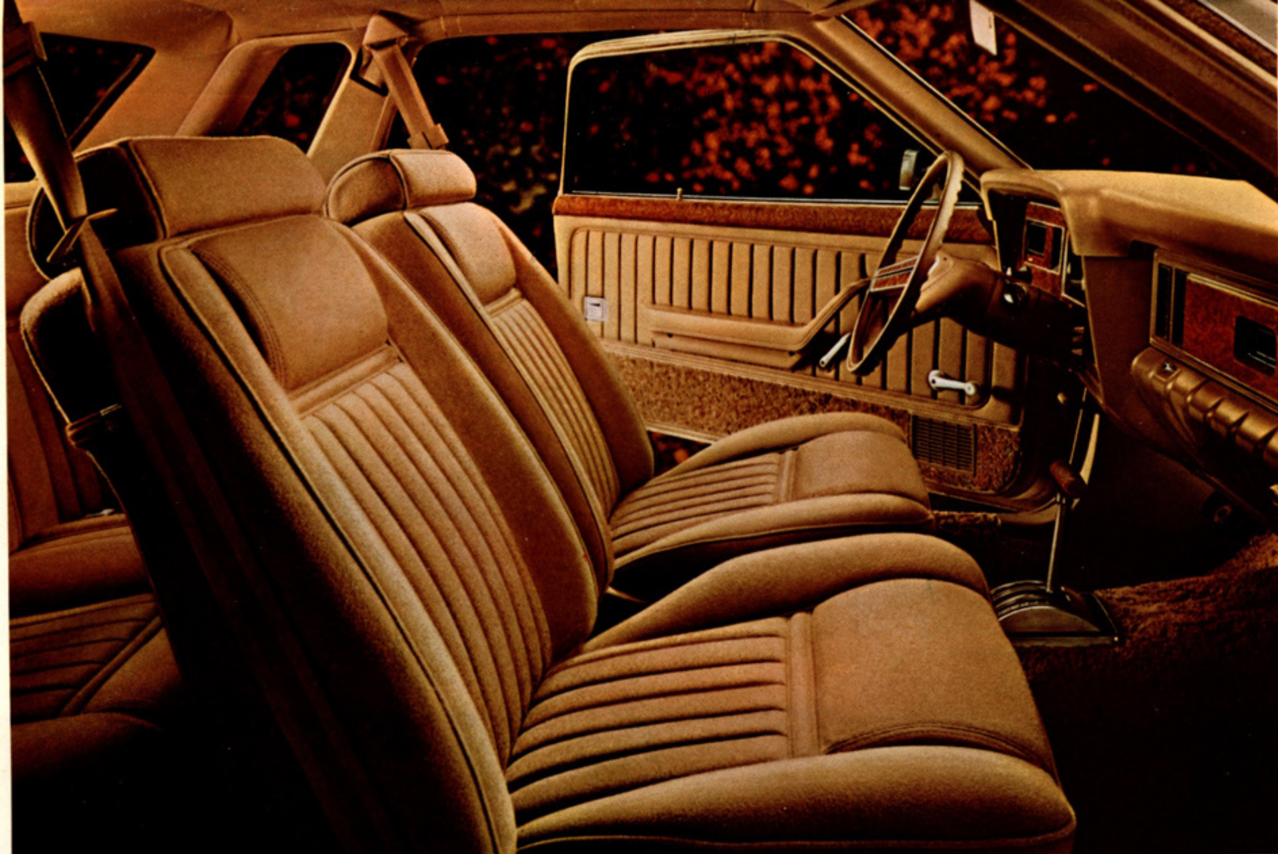
Above: Monarch Ghia's optional luxury cloth interior. Below: Optional leather interior. Both with floor mounted shift.