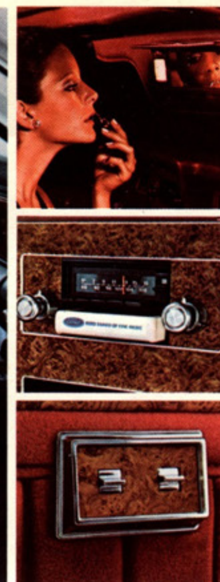
Options shown: illuminated visor vanity mirror, AM/FM stereo radio with tape, power windows and power glass moonroof.