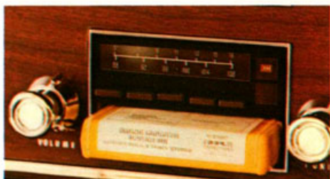
Optional AM/FM multiplex stereo radio with stereo tape.

Yet another reason is Meteor's big car strength. It starts with a separate body/frame construction. The body is welded together to form a rigid unit and is mounted to a strong 5 cross-member perimeter frame. Extra protection comes from a steel guard rail in each of the doors and a double panelled roof. Add these to the long list of Safety Design features and you have the reasons why many people choose a Mercury Meteor.