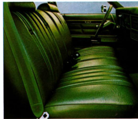
Above: Montcalm optional all-vinyl interior (standard on Montcalm station wagon)