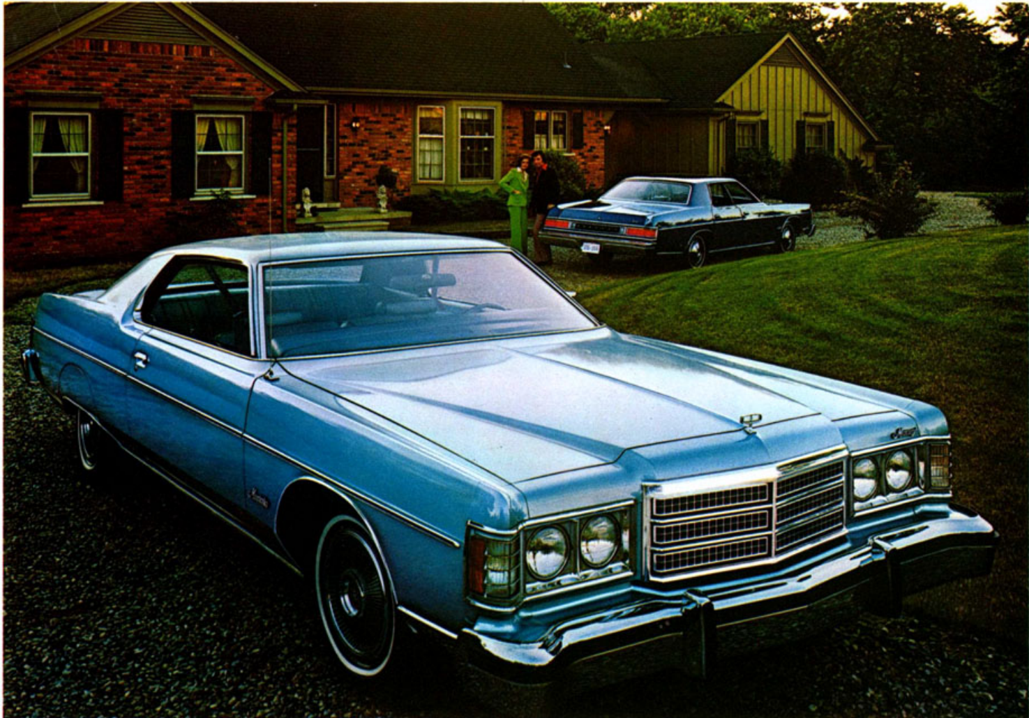
Background—Montcalm 4-door pillared hardtop.