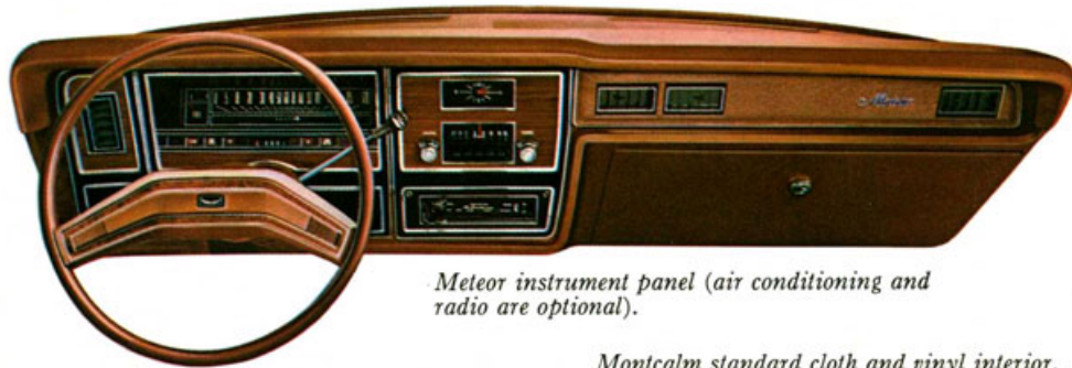
Meteor instrument panel (air conditioning and radio are optional).

As well as experiencing comfort in a Meteor interior, you and your passengers will experience the peace of quiet. Many pounds of sound deadening materials are placed strategically throughout Meteor's body for a truly enjoyable ride. Quiet and comfort are two more reasons that make 1975 Mercury Meteor a solid sensible buy.