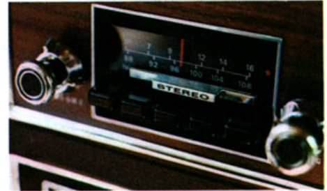
Optional AM/FM multiplex stereo radio.

body-side mouldings with vinyl insert; and more.