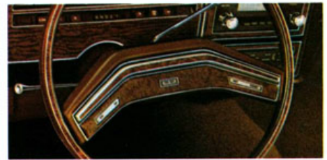
Optional fingertip speed control with new 2-spoke rim blow steering wheel.

To give your 1975 Montcalm a more distinctive and "personally yours" look, there is a wide array of options to choose from like: fender skirts; glamour metallic paint; vinyl roof; luxury wheel covers;