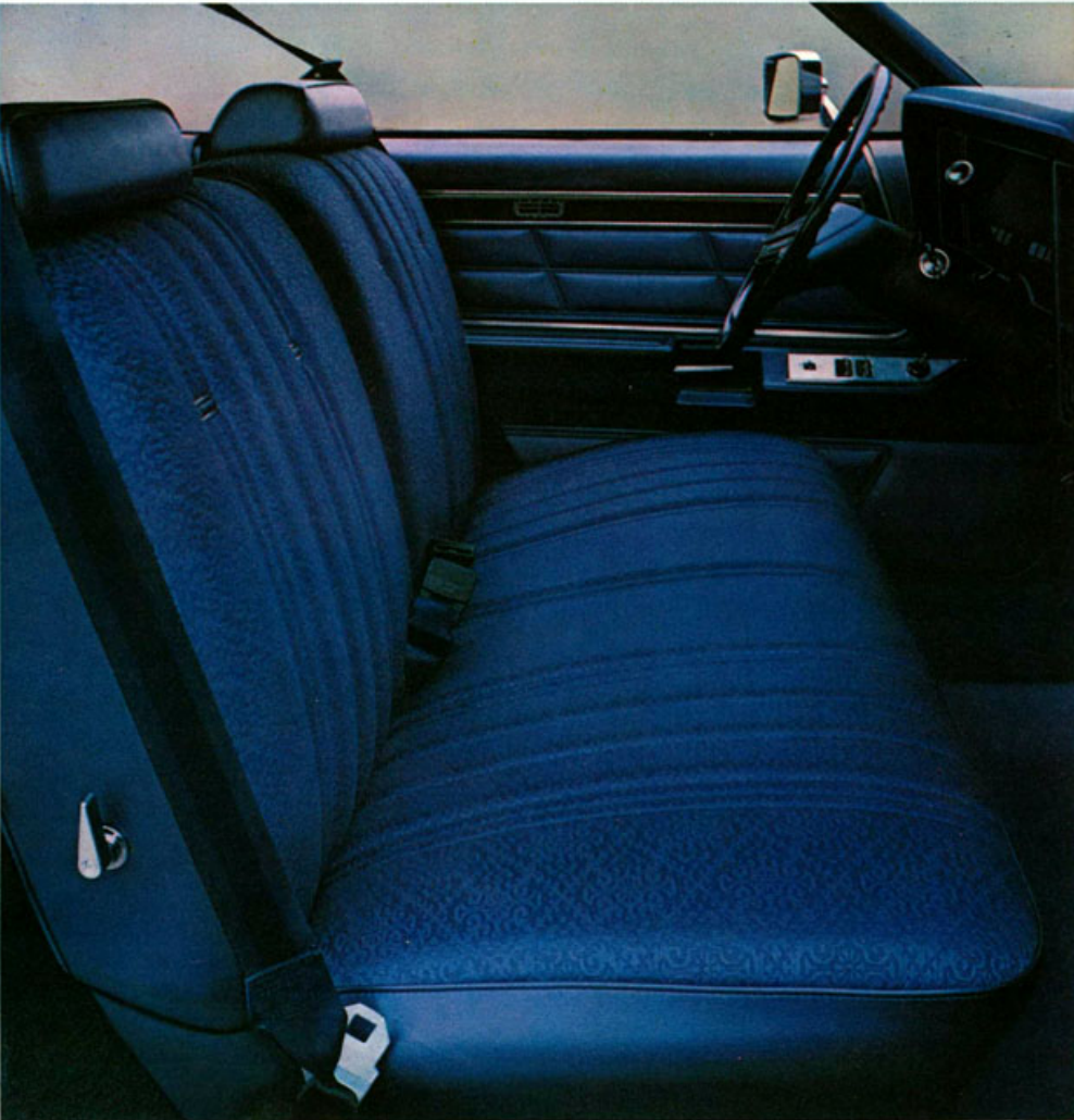
Montcalm standard cloth and vinyl interior.