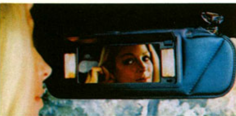
Optional illuminated visor-mounted vanity mirror.

Look below at the interior of a Mercury Meteor. It may come as a surprise to you that this is a standard interior. The picture tells you that it is beautiful, but you really have to experience this comfort to fully appreciate it.