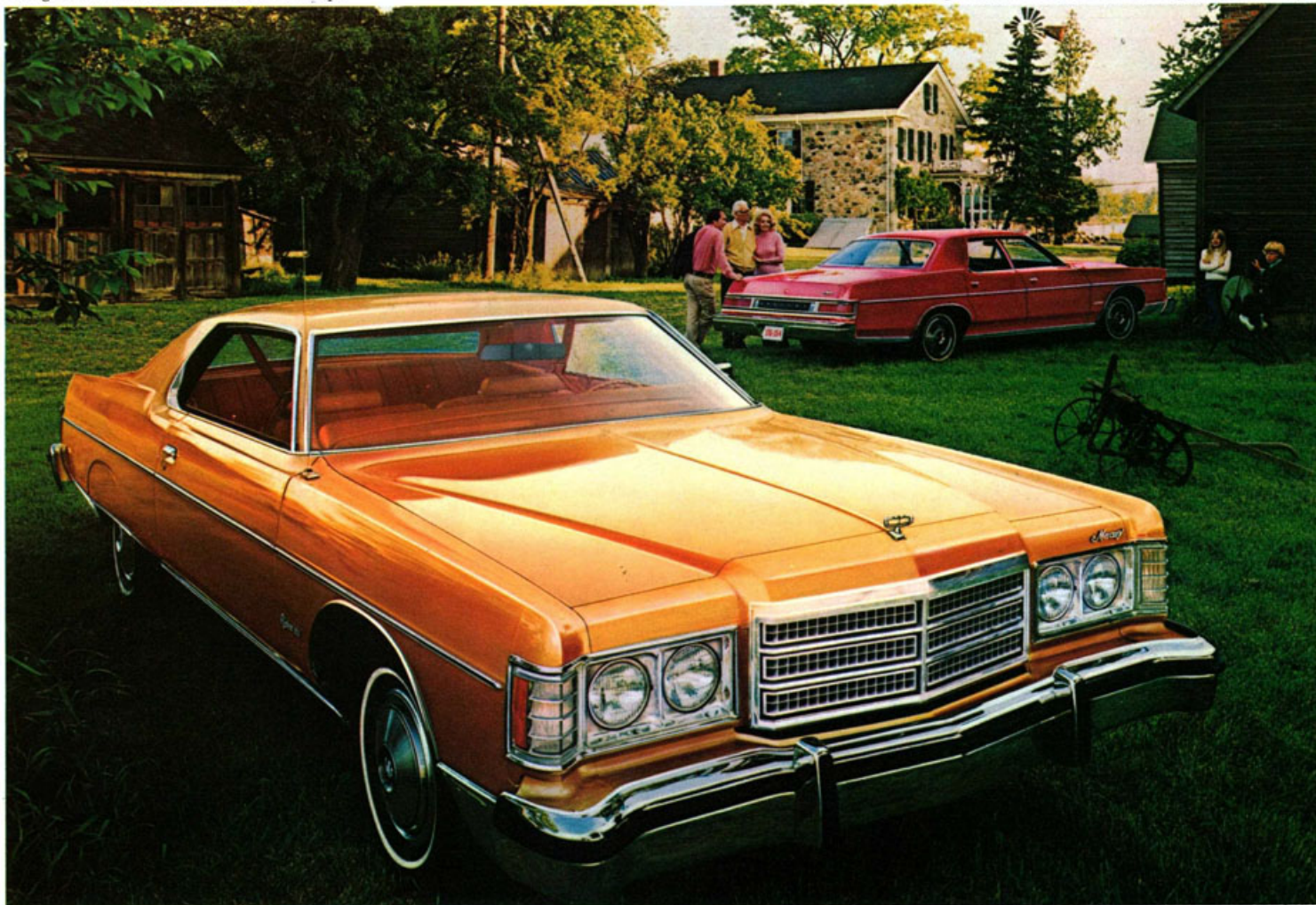
Background: Rideau 500 4-door pillared hardtop.