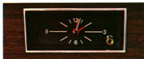
Optional electric clock.

noise and vibration. Rideau 500 is as smooth as it is quiet. That's the kind of thing we mean by value.