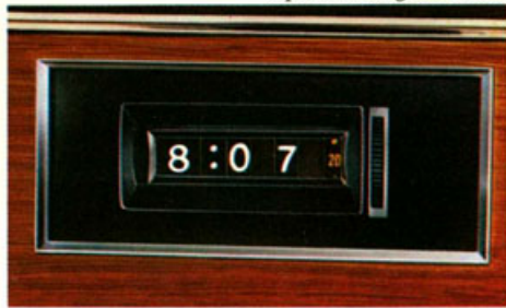
Optional Digital Clock.

you select the choice of options that best suit your needs. A number of the more popular options are illustrated and described throughout this brochure.