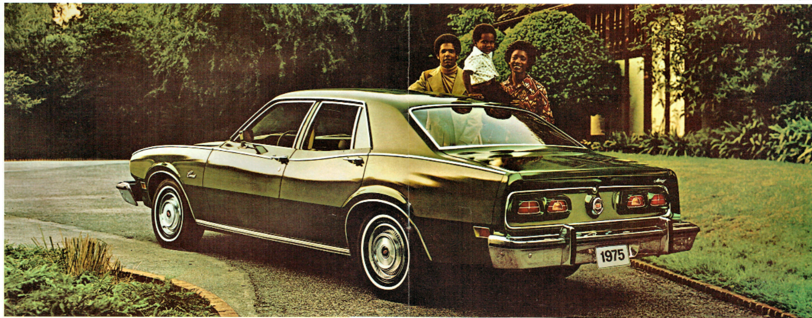
Mercury Comet 4-Door Sedan with Custom Options