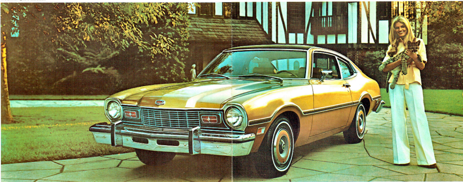
Mercury Comet 3-Door Sedan with Custom interior and exterior options also shown

Custom Interior Option: 22-oz. cut-pile carpeting • Deluxe colour-keyed seat belts • Leather-wrapped steering wheel • Dual beam dome lamp • Day/night rearview mirror • Reclining front bucket seats • Lighted glove box • Cigar lighter. Did you know every Mercury is engineered to reduce maintenance costs — such as a lifetime water pump and radiator hose that needn't be replaced for 50,000 miles?