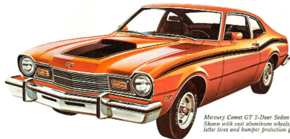
Mercury Comet GT 2-Door Sedan Shown with cast aluminum wheels, raised white letter tires and bumper protection group.