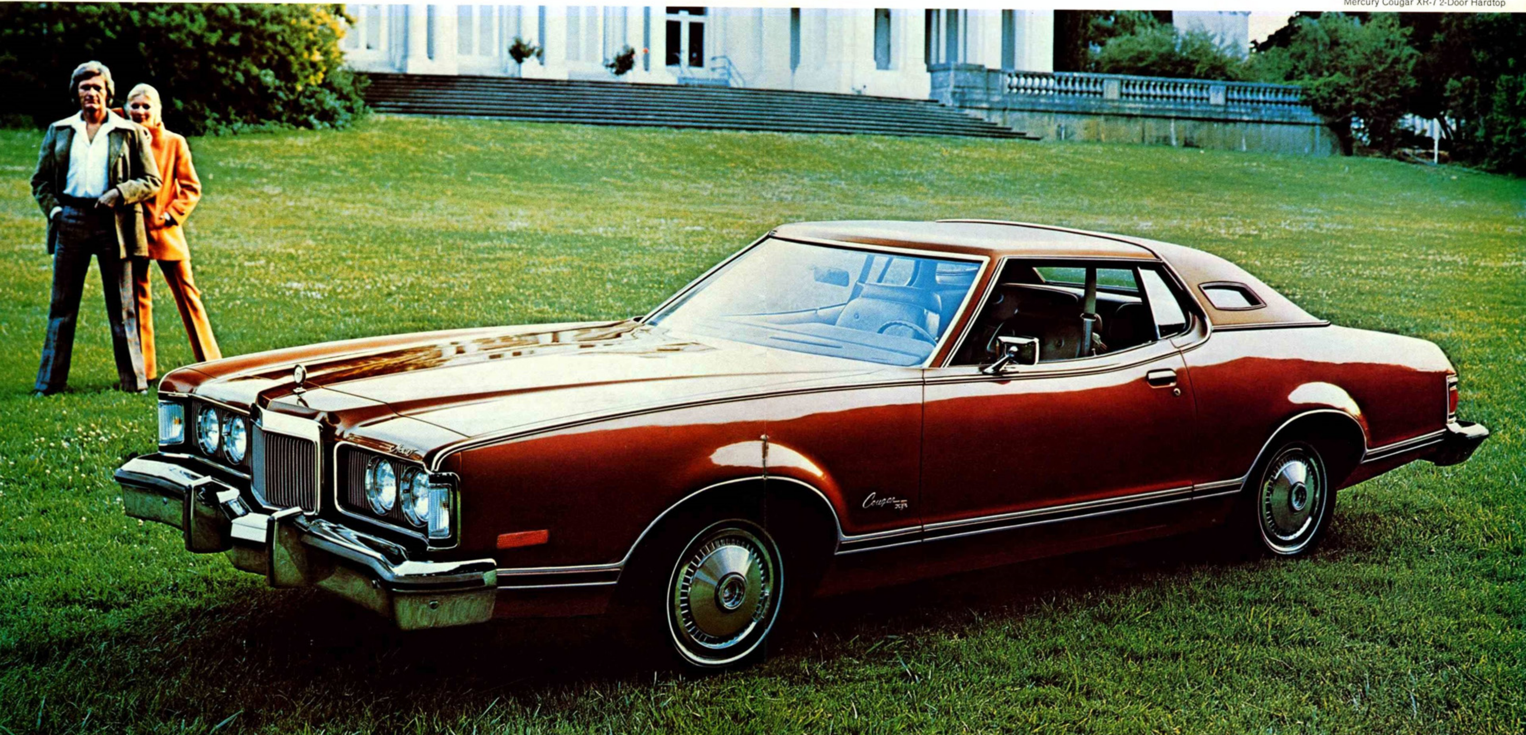
Mercury Cougar XR-7 2-Door Hardtop

Cougar XR-7's measure of luxury deserves a lot of room. So XR-7 gives you more room for legs, hips and shoulders. More elegance, too, as you can see.