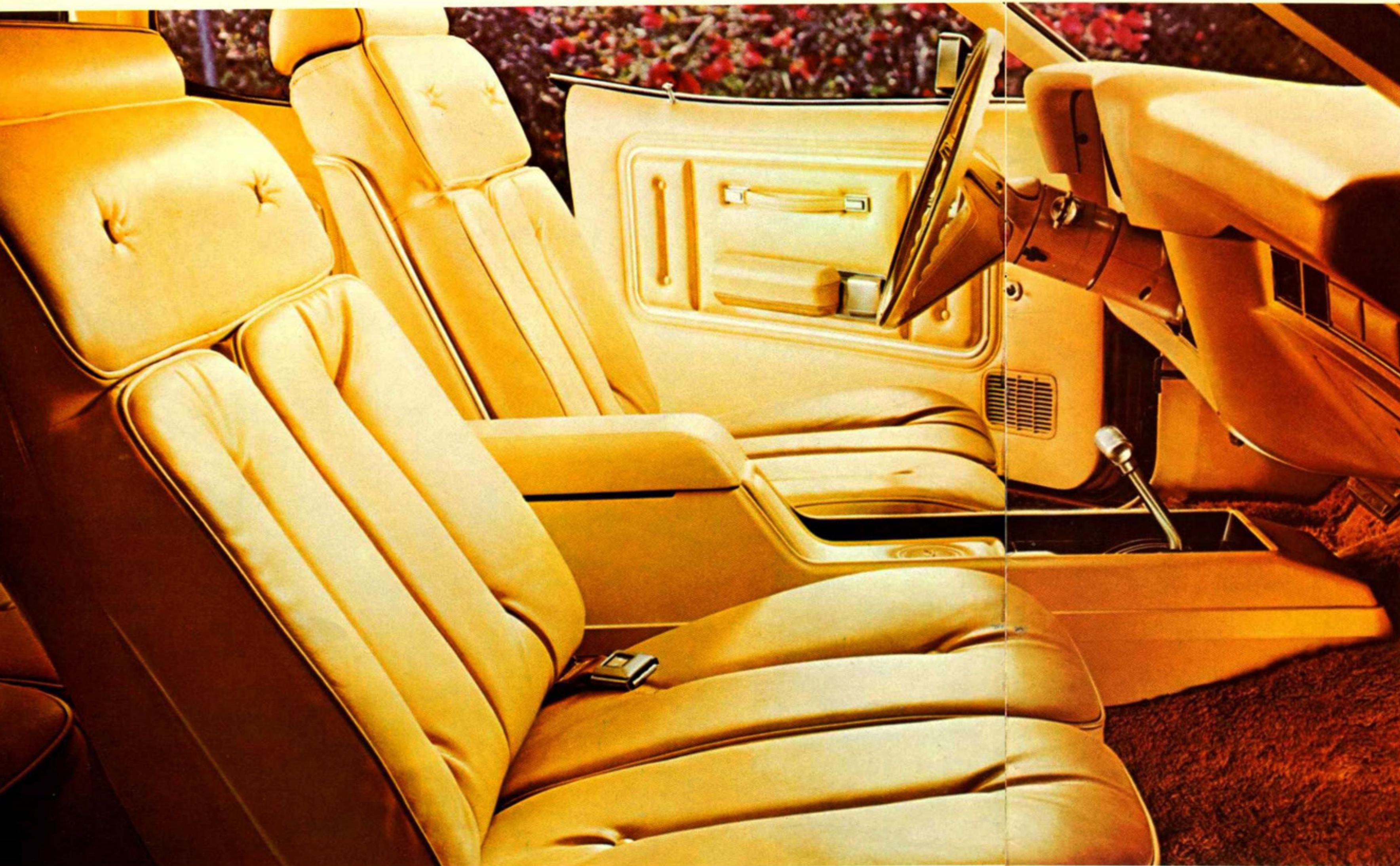
Mercury Cougar XR-7 interior