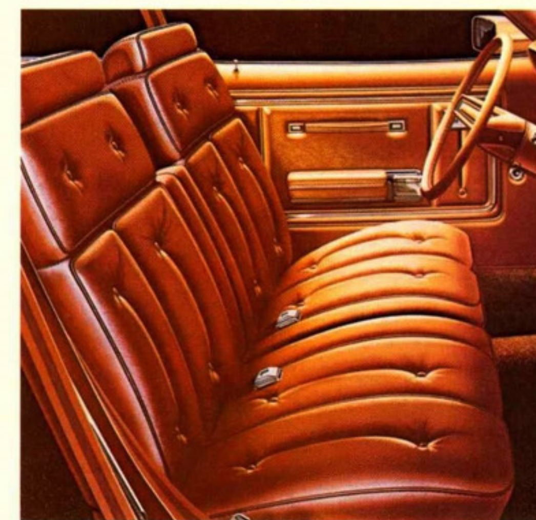
Mercury Cougar XR-7 Twin Comfort Lounge Seats