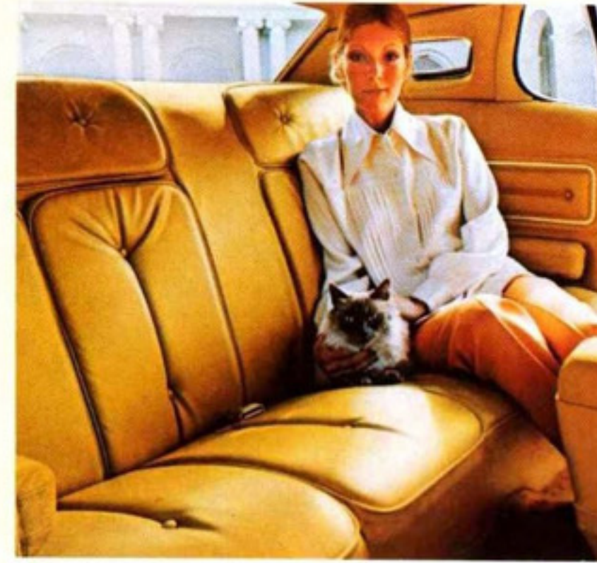
Mercury Cougar XR-7 interior

with an unusually broad choice of trim combinations, with a prestigious opera window and unique vinyl roof. Definitely on the move and definitely up. Cougar XR-7!