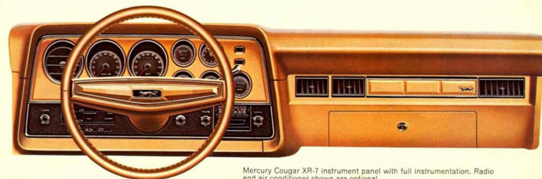
Mercury Cougar XR-7 instrument panel with full instrumentation. Radio and air conditioner shown are optional.