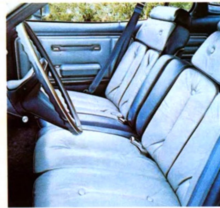
Mercury Cougar XR-7 Twin Comfort Lounge Seats

disc brakes • Steel-belted radial tires • Impact-absorbing bumpers • Dual headlamps • 3-point restraint system • Locking steering column • Power steering • Performance instrumentation • Bucket seats and console • Luxury steering wheel • Luxury-weight cut-pile carpeting • Inside hood release • \frac{3}{4} vinyl roof • Opera window • Ford Motor Company Safety Design Features • Note: Other equipment shown is optional.