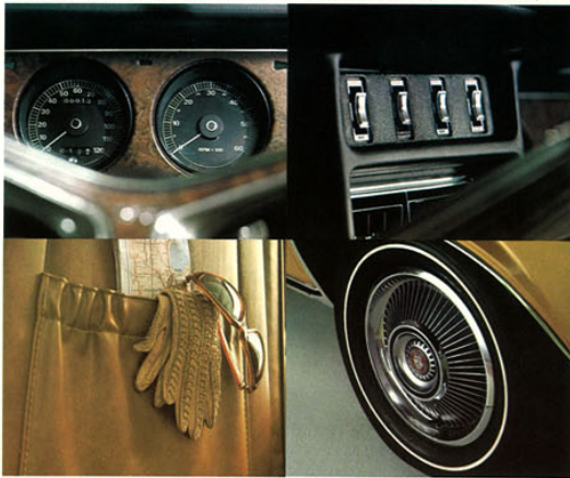
Map pockets in XR-7 seat backs.

XR-7 instruments include tachometer and trip odometer, cove-inset to permit extra legibility. A center pod houses rocker switches for map, panel and courtesy lights, defogger or convertible top.