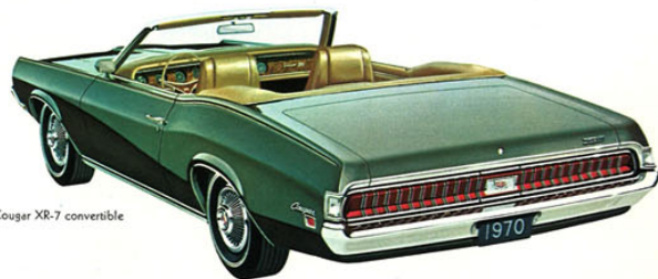
Cougar XR-7 convertible