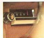
AM RADIO/STEREO SONIC TAPE