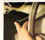
FINGERTIP SPEED CONTROL