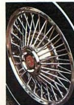
WIRE WHEEL COVERS