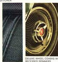
DELUXE WHEEL COVERS WITH RECESSED SPINNERS