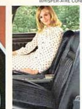
COMFORT-WEAVE VINYL, BUCKET SEATS