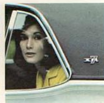
VINYL-COVERED OXFORD ROOF