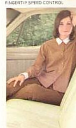
FULL-WIDTH FRONT SEAT—ROOM FOR THREE PASSENGERS