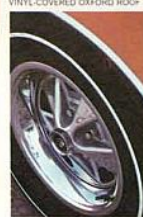
STYLED STEEL WHEELS