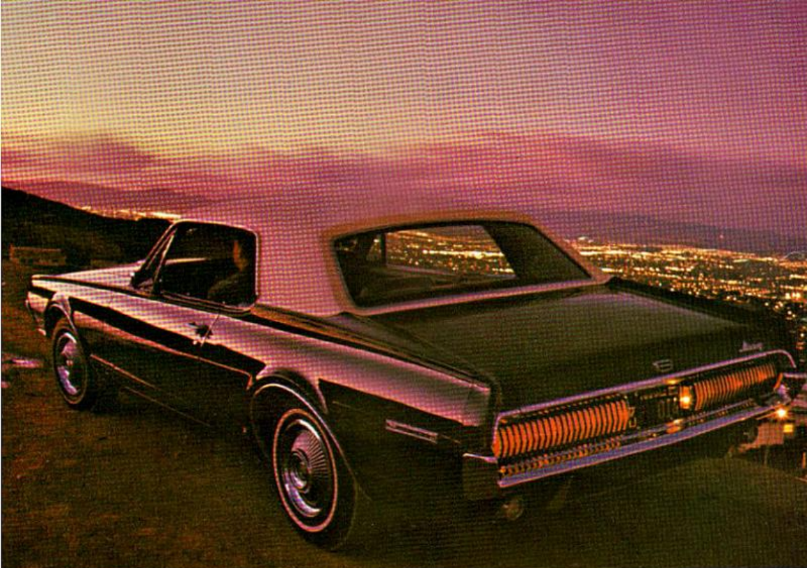
Cougar shown with optional vinyl-covered Oxford Roof.