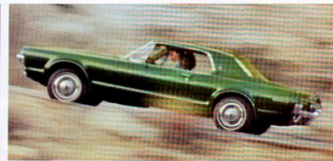
Spirited, sports car performance is very much a part of the Cougar personality with the Cougar 289 V-8 standard.