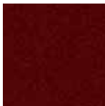
Dark Toreador Red Metallic