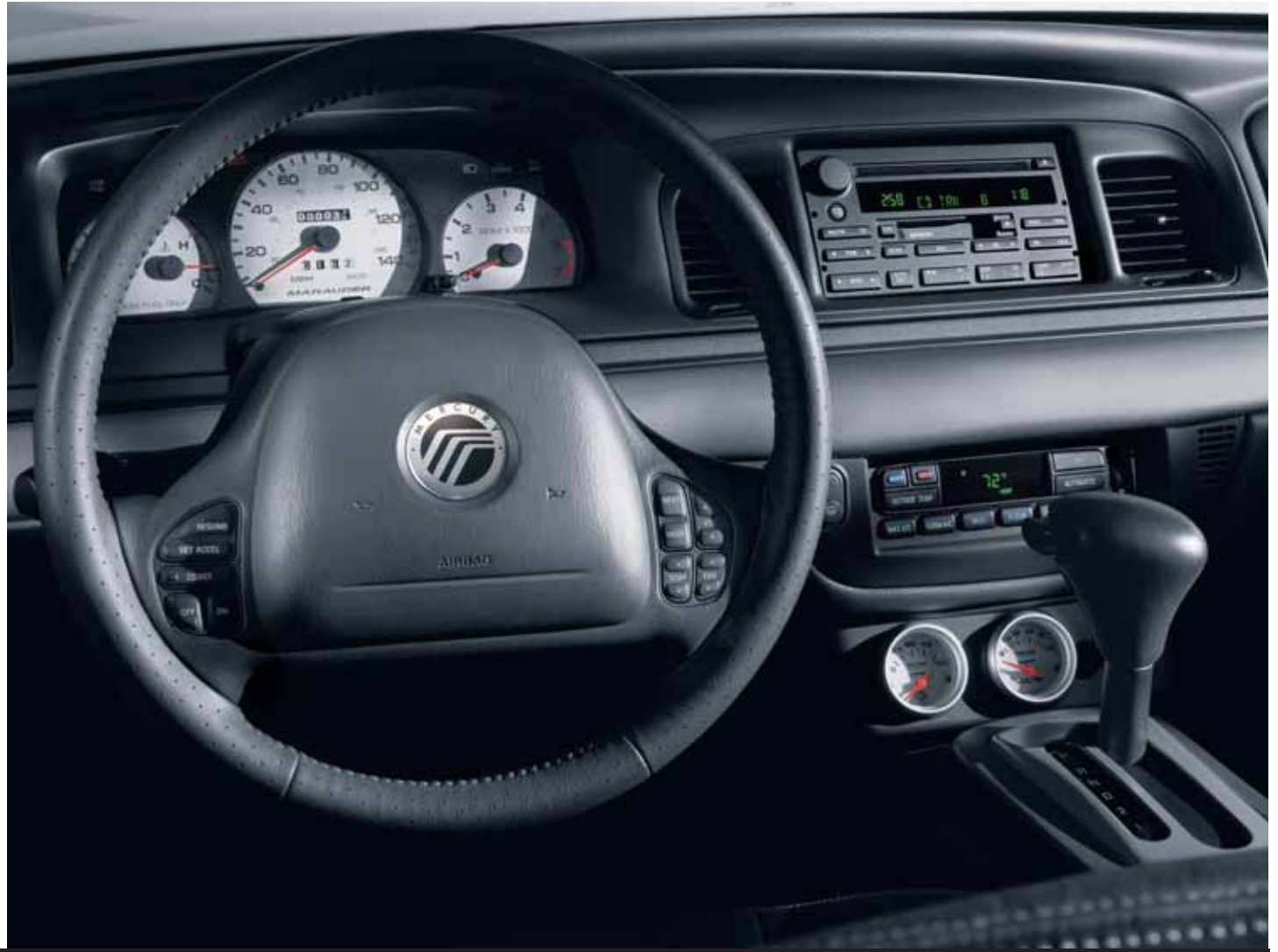
Above: Mercury Marauder driver's cockpit with leather-wrapped steering wheel and Auto Meter™ gauges. Shown on cover: Mercury Marauder in Black.

Meet Mercury Marauder, circa 2004. Like its muscle-car predecessors, this American street machine pounds out racetrack performance – with a thoroughly modern dose of refinement. Hot Rod magazine calls it “...a message only to those in the know.” After hearing the dual exhaust growl, you will understand. Immediately. Marauder projects as menacing a stance as you’ll ever see on four 18" alloy wheels. If you’re prepared to make a bold statement, align yourself with the winged god. You’ll find him throughout Mercury Marauder.