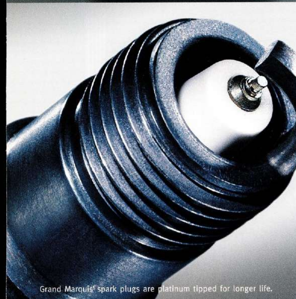
Grand Marquis® spark plugs are platinum tipped for longer life.