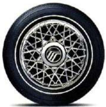
16-inch chromed locking wheel cover