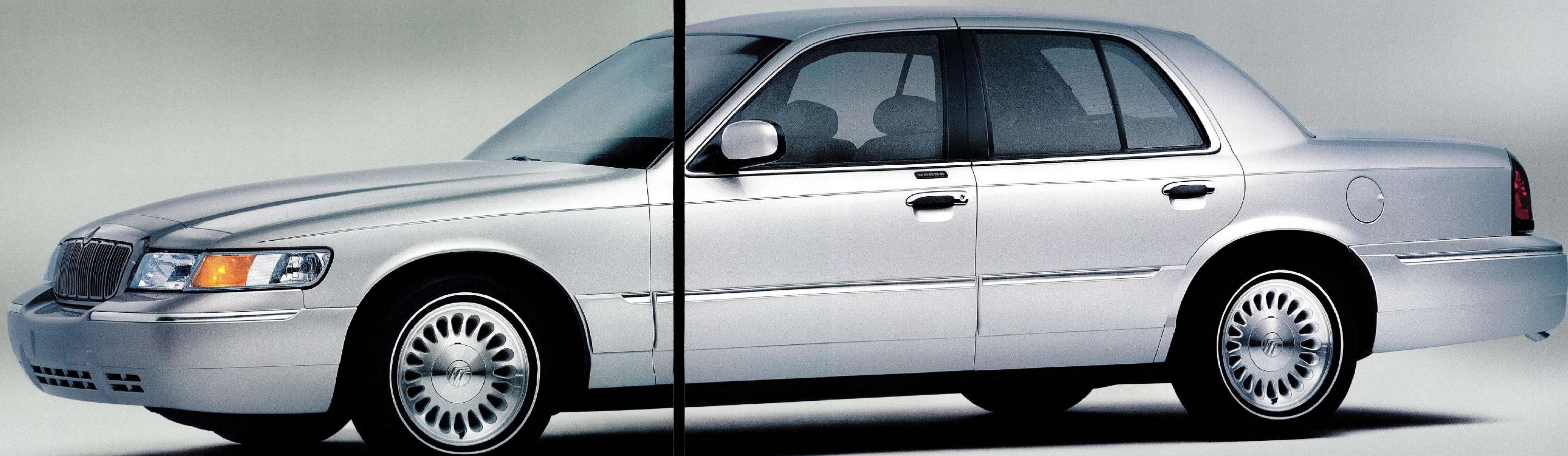
Mercury Grand Marquis LS Premium in Silver Frost Clearcoat Metallic. Shown with available equipment.