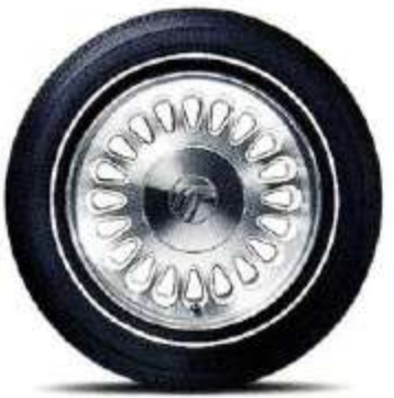
16-inch teardrop aluminum