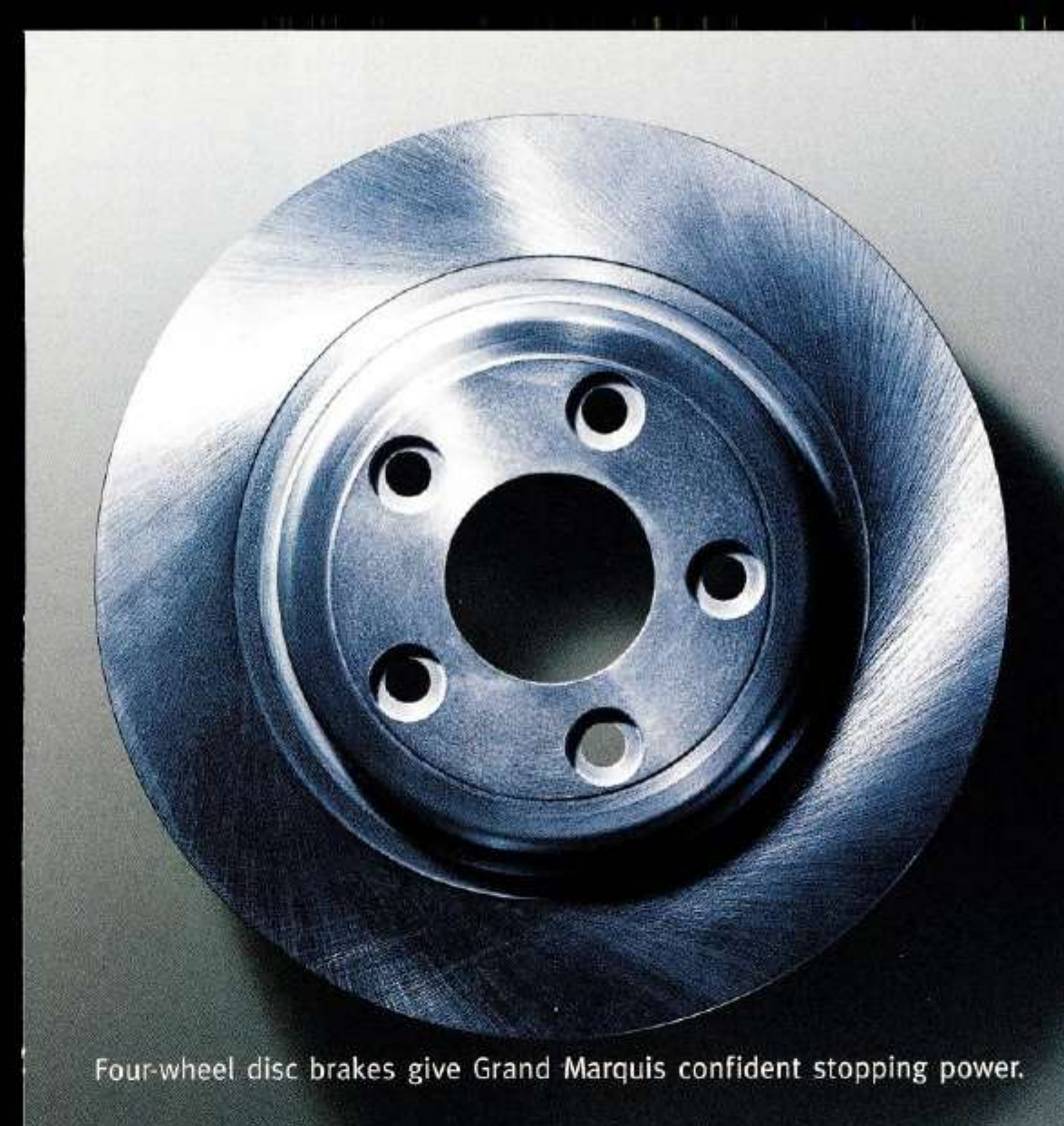
Four-wheel disc brakes give Grand Marquis confident stopping power.