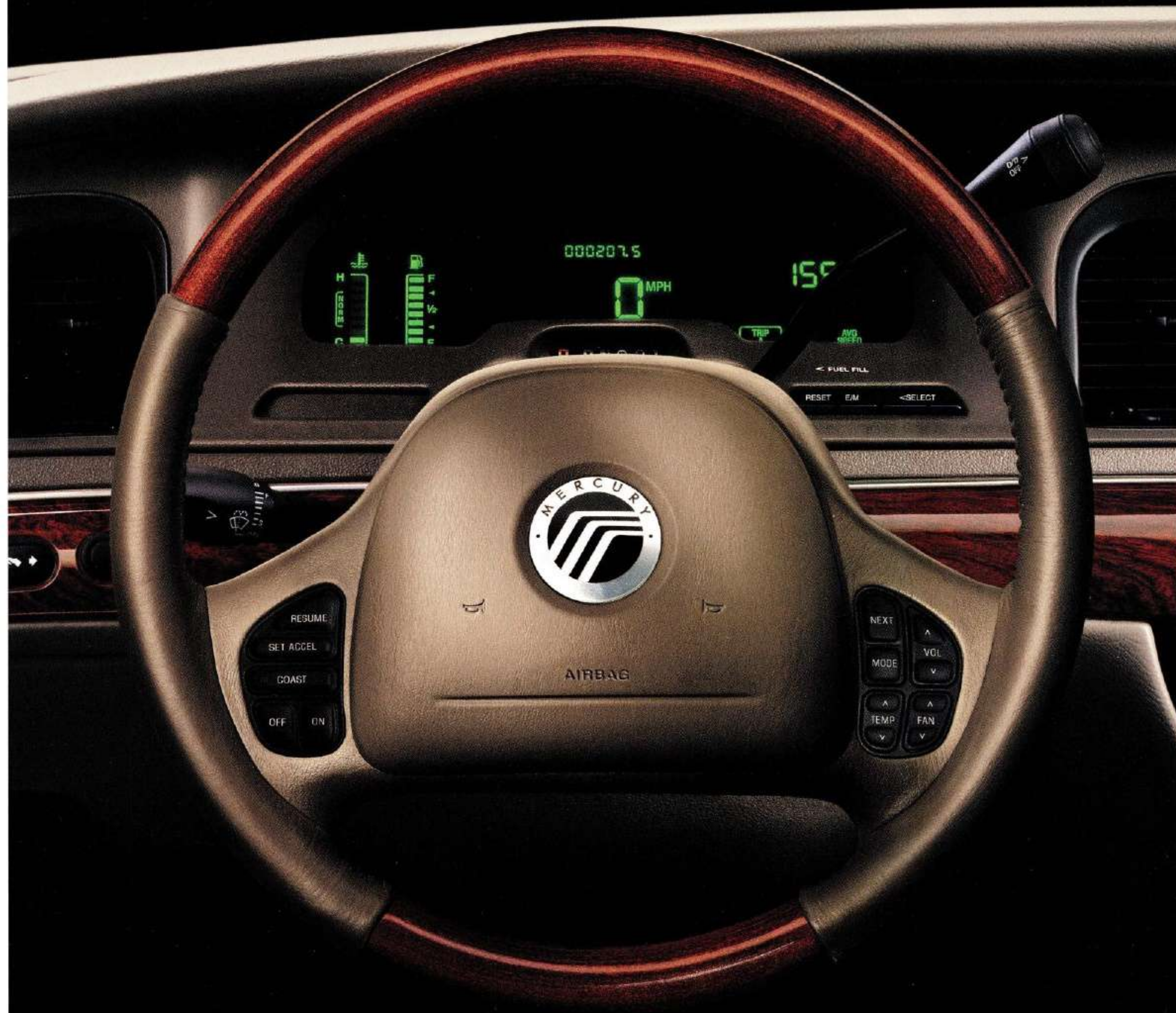
Grand Marquis LS Ultimate features a wood- and leather-trimmed steering wheel and digital instrument cluster.

Grand Marquis is equally accommodating for driver and passengers, thanks to its supportive and luxurious seating surfaces with safety belts positioned for comfort. What's more, the easy-to-reach instrument panel, standard 4-speaker audio system with AM/FM stereo/cassette, available Electronic Automatic Temperature Control and an available wood- and leather-trimmed steering wheel enhance its luxurious environment—whether you're taking a cross-country trip or just running an errand in town.