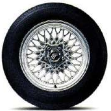
16-inch lacy spoke cast aluminum 3

To ensure we're offering our customers the best service possible, we proudly offer the Mercury Personal Consultant . Just visit our Web site at www.mercuryvehicles.com/pc and one of our manufacturer's representatives will help with anything from price quotes to product features to arranging a test drive at your local dealer—at no cost or obligation.