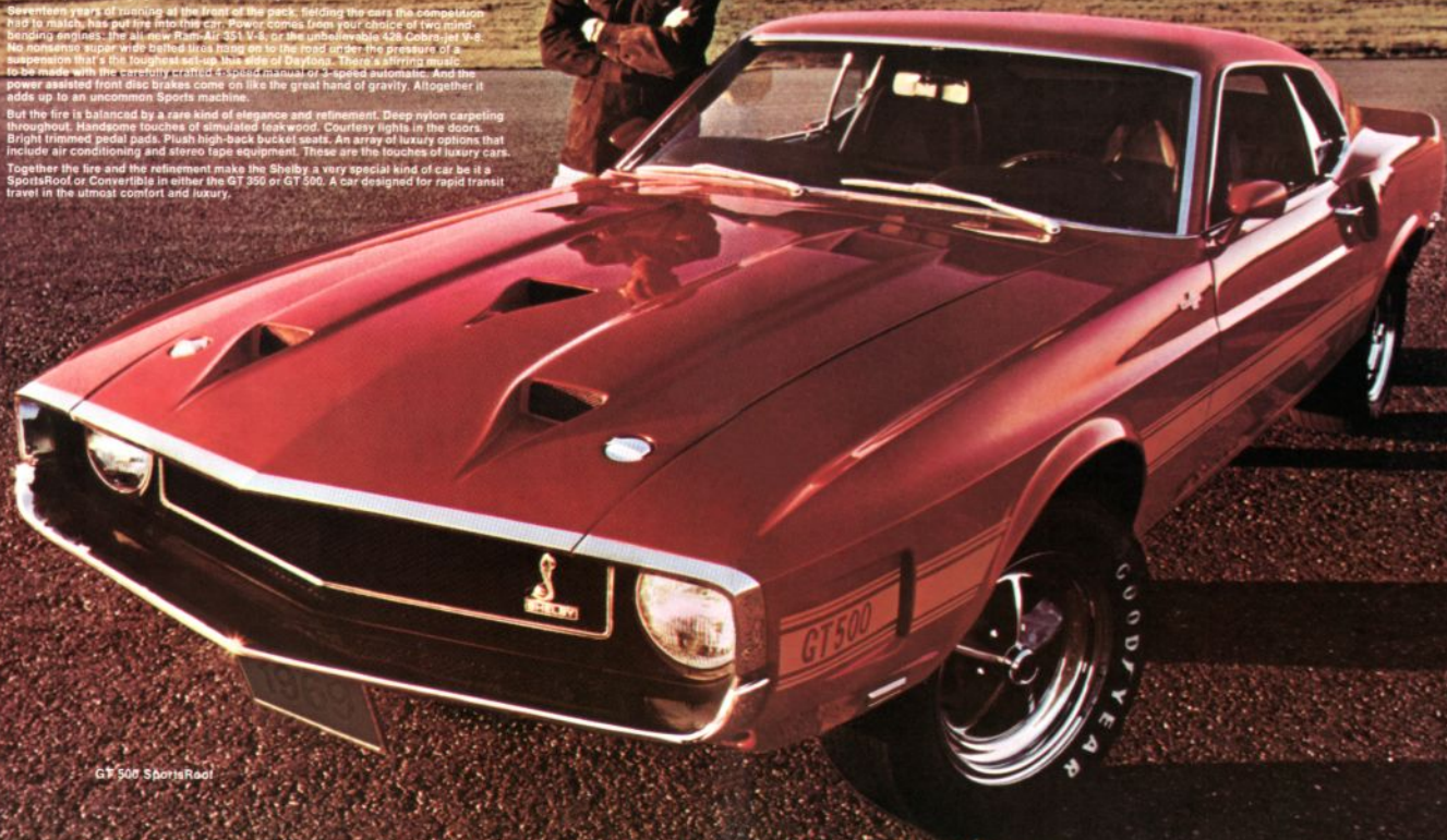
GT 500 SportsRoof

But the fire is balanced by a rare kind of elegance and refinement. Deep nylon carpeting throughout. Handsome touches of simulated teakwood. Courtesy lights in the doors. Bright trimmed pedal pads. Plush high-back bucket seats. An array of luxury options that include air conditioning and stereo tape equipment. These are the touches of luxury cars. Together the fire and the refinement make the Shelby a very special kind of car: be it a SportsRoof or Convertible in either the GT 350 or GT 500. A car designed for rapid transit travel in the utmost comfort and luxury.