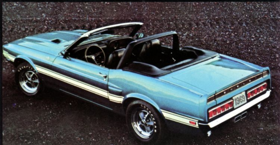
GT 500 Convertible