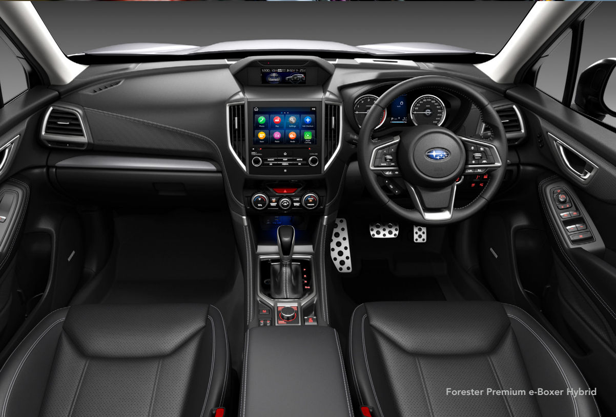
Forester Premium e-Boxer Hybrid