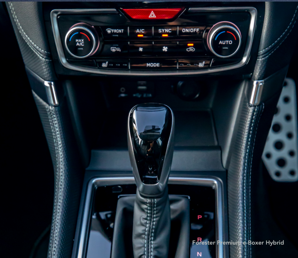
Forester Premium e-Boxer Hybrid