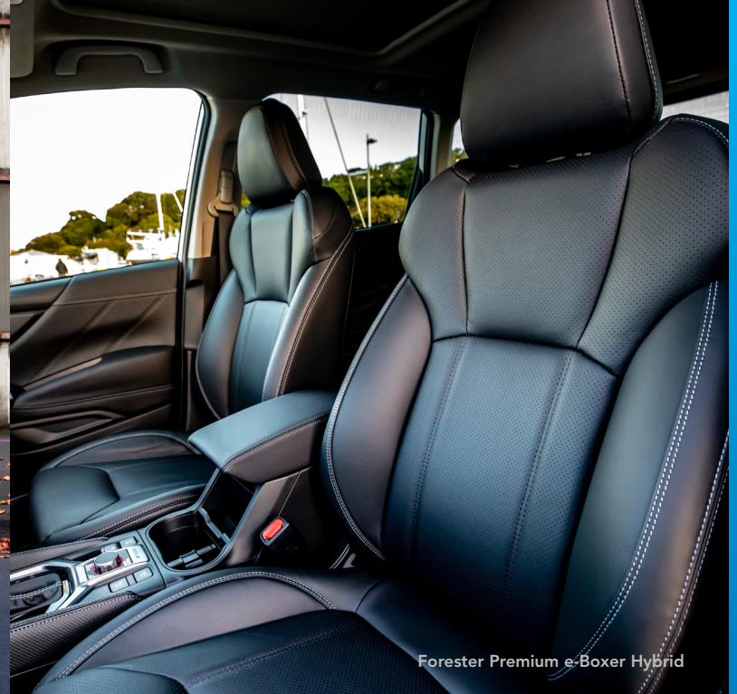
Forester Premium e-Boxer Hybrid