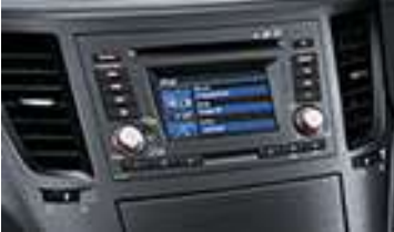
SINGLE IN-DASH CD PLAYER: Outback 2.5i