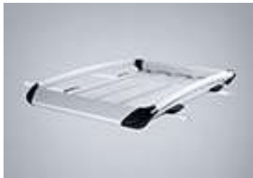
LUGGAGE RACK (SMALL)