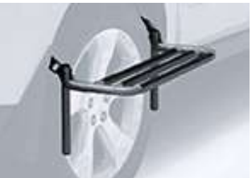
SIDE STEP UP