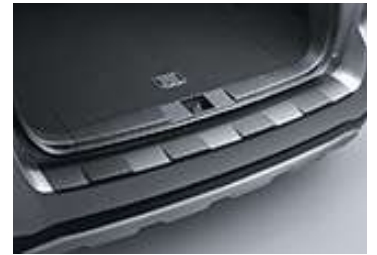
REAR STEP PANEL (RESIN)