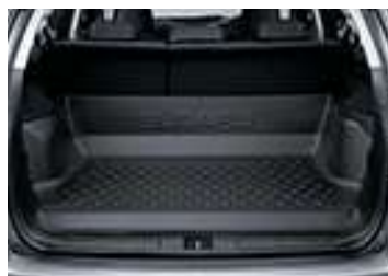
CARGO TRAY (DEEP DISH)