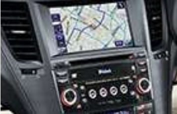
McINTOSH ENTERTAINMENT SYSTEM: Outback 3.6R Premium