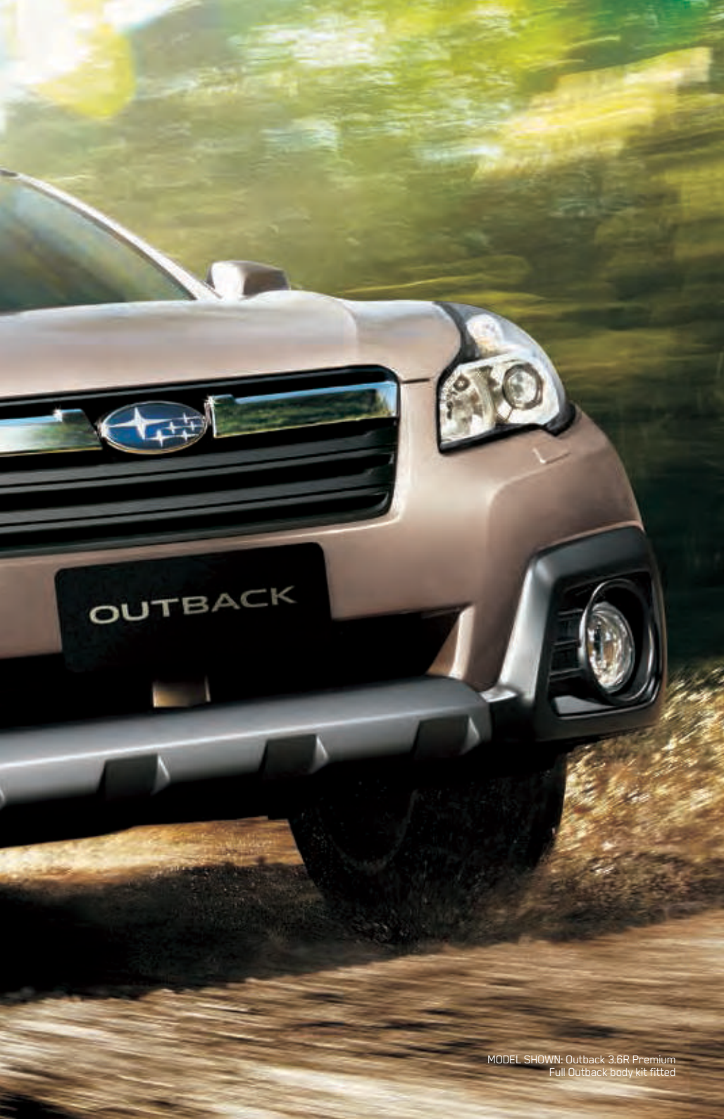
MODEL SHOWN: Outback 3.6R Premium Full Outback body kit fitted