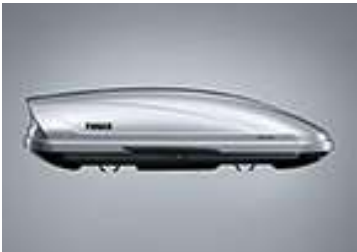
THULE MOTION 200 SILVER LUGGAGE POD