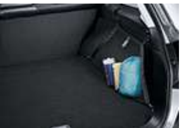
CARGO NET (SIDE x2)