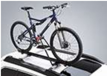
BICYCLE HOLDER (UPRIGHT)