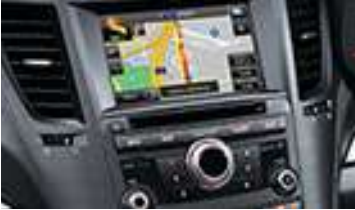
MULTI-INFORMATION IN-DASH SATELLITE NAVIGATION SYSTEM: Outback 2.5i Option Pack, Outback 2.5i Premium, Outback 2.0D and Outback 2.0D Premium