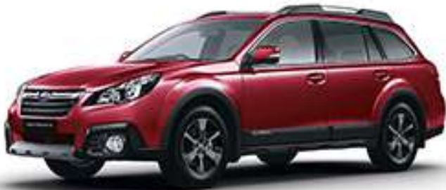
VENETIAN RED PEARL