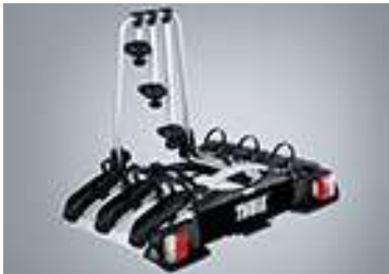
TOWBALL MOUNTED BIKE CARRIER (THREE BIKES)