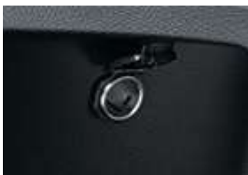
CARGO POWER SOCKET