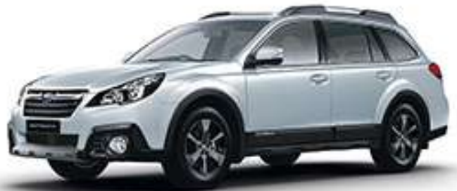
ICE SILVER METALLIC