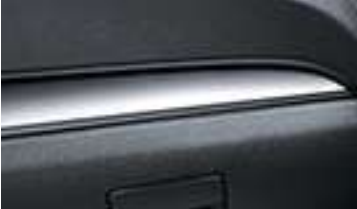
MATT SILVER: Outback 2.5i, Outback 2.5i Premium, Outback 2.0D and Outback 2.0D Premium