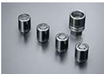
WHEEL LOCK NUTS