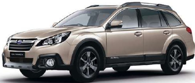
BURNISHED BRONZE METALLIC