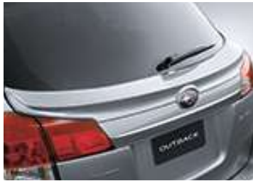
REAR WAIST SPOILER