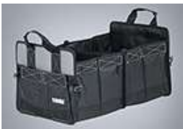
THULE GO BOX