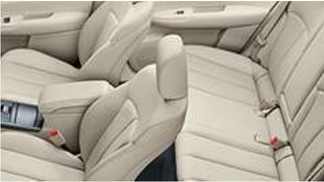
IVORY: Cloth: Outback 2.5i and Outback 2.0D Leather 1 : Outback 2.5i Option Pack, Outback 2.5i Premium, Outback 3.6R Premium and Outback 2.0D Premium