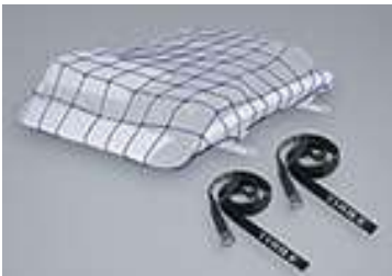
NET AND STRAPS FOR LUGGAGE RACK