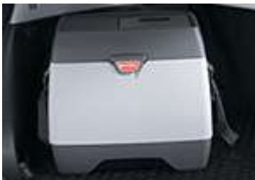
ADVENTURE PORTABLE FRIDGE (14 LITRE, 12V ONLY)