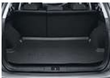
CARGO TRAY (LOW DISH)