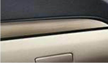
TITANIUM DRAPE: Outback 3.6R Premium