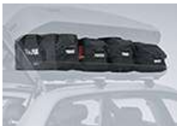
THULE GO PACK SET