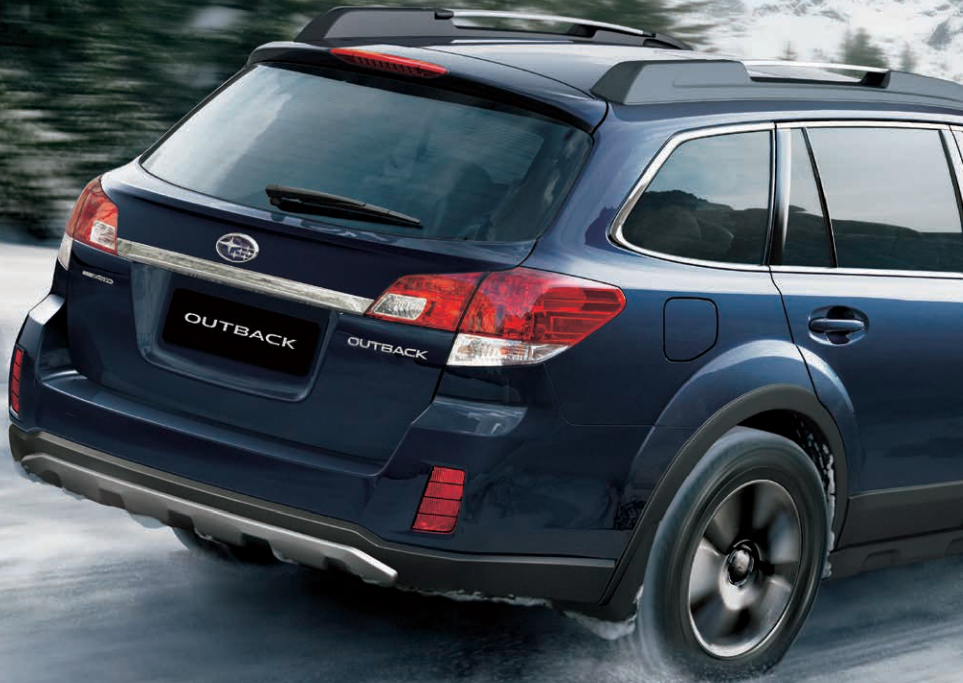
MODEL SHOWN: Outback 2.5i Premium Full Outback body kit fitted