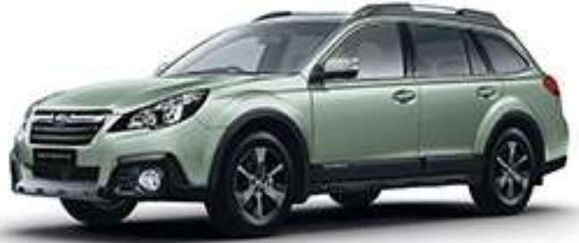
JASMINE GREEN METALLIC