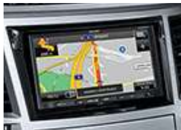
AVN NAVIGATION SYSTEM