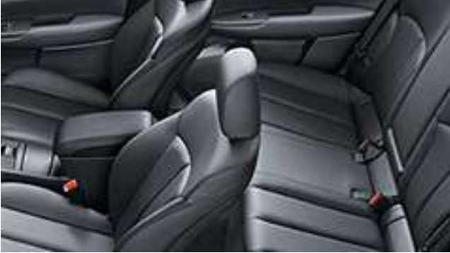
BLACK: Cloth: Outback 2.5i and Outback 2.0D Leather 1 : Outback 2.5i Option Pack, Outback 2.5i Premium, Outback 3.6R Premium and Outback 2.0D Premium