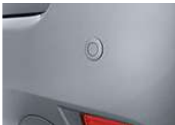
REAR PARK ASSIST