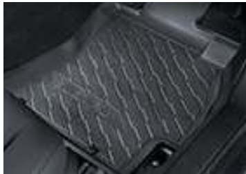
RUBBER FLOOR MAT