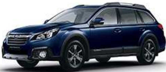
DEEP SEA BLUE PEARL