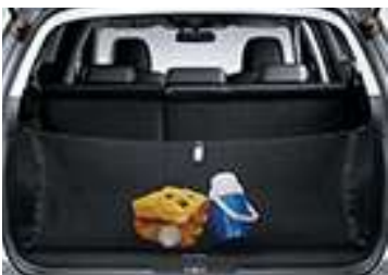
CARGO NET (REAR)