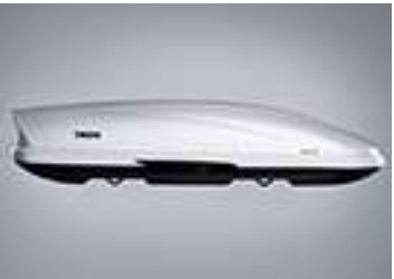
THULE MOTION 800 SILVER LUGGAGE POD