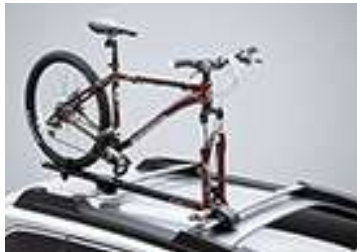
BICYCLE HOLDER (FORK MOUNTED)