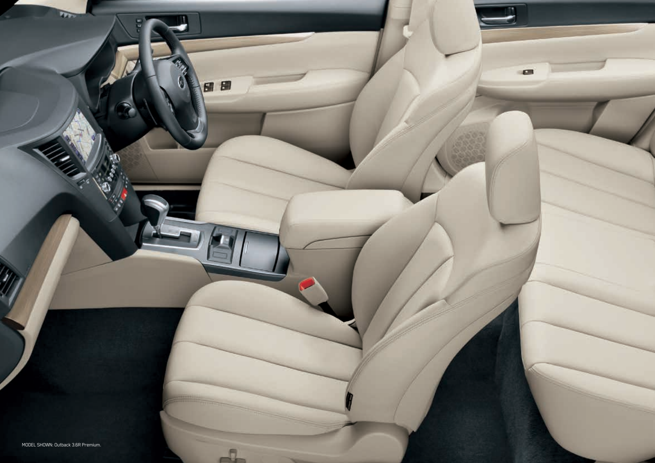
MODEL SHOWN: Outback 3.6R Premium.