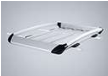
LUGGAGE RACK (LARGE)