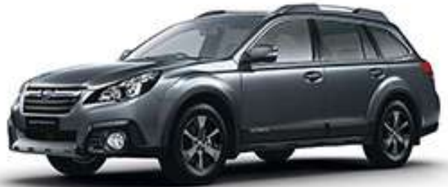
DARK GREY METALLIC