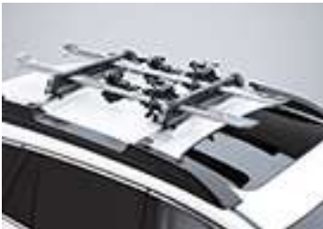
UNIVERSAL LOCKING ARMS