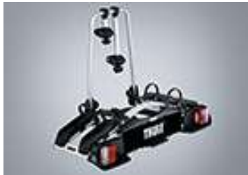
TOWBALL MOUNTED BIKE CARRIER (TWO BIKES)