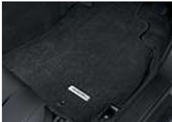
CARPET FLOOR MAT