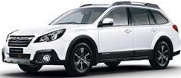
SATIN WHITE PEARL