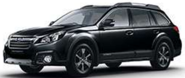
CRYSTAL BLACK SILICA