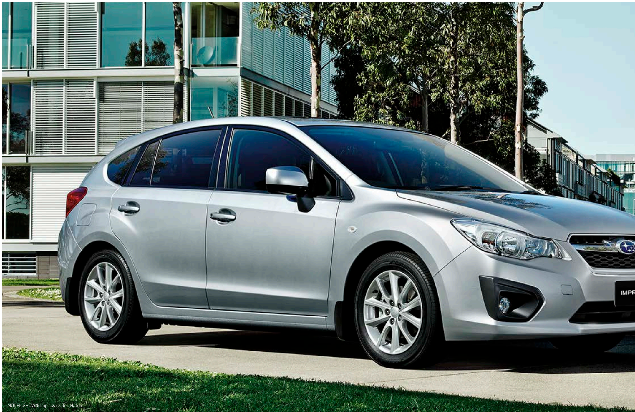
MODEL SHOWN: Impreza 2.0i-L Hatch