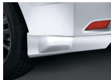
AERO MUDFLAP - REAR (IMPREZA 2.0i-S ONLY)