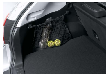
CARGO NET (SIDES)