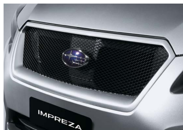
FRONT MESH GRILLE