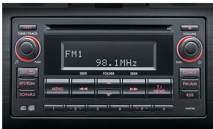
SINGLE IN-DASH CD PLAYER: IMPREZA 2.0i