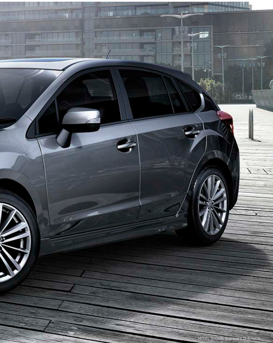
MODEL SHOWN: Impreza 2.0i-S Hatch