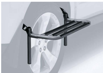
SIDE STEP UP