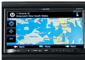
NAVIGATION UNIT 2