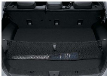
CARGO NET (REAR TAILGATE)