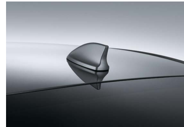
SHARK FIN ANTENNA