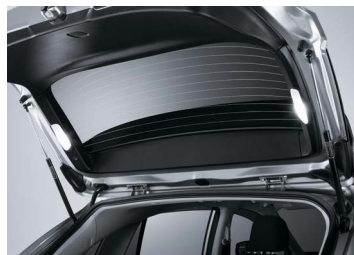
REAR HATCH LIGHT