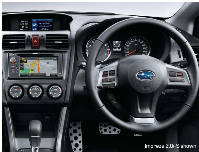
Impreza 2.0i-S shown