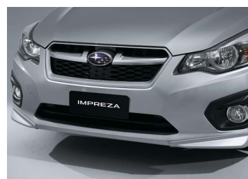
FRONT BUMPER SKIRT