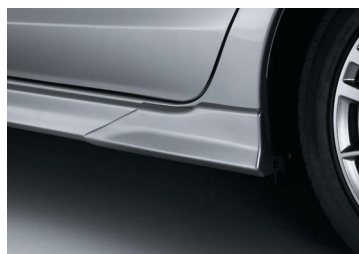
SIDE STRAKE (2.0i-S ONLY)