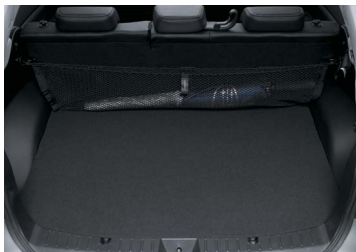
CARGO NET (REAR SEAT BACK)