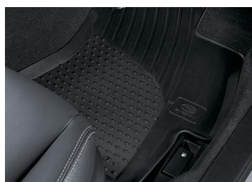
RUBBER MAT SET