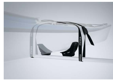
WATERCRAFT HOLDER 1