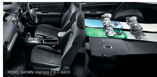
MODEL SHOWN: Impreza 2.0i-L Hatch