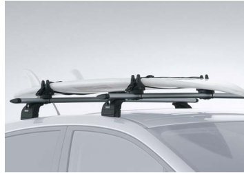
SURFBOARD CARRIER 1