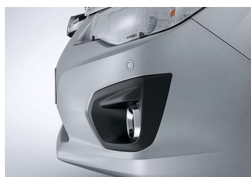
FRONT PARKING CORNER ASSISTANCE SYSTEM