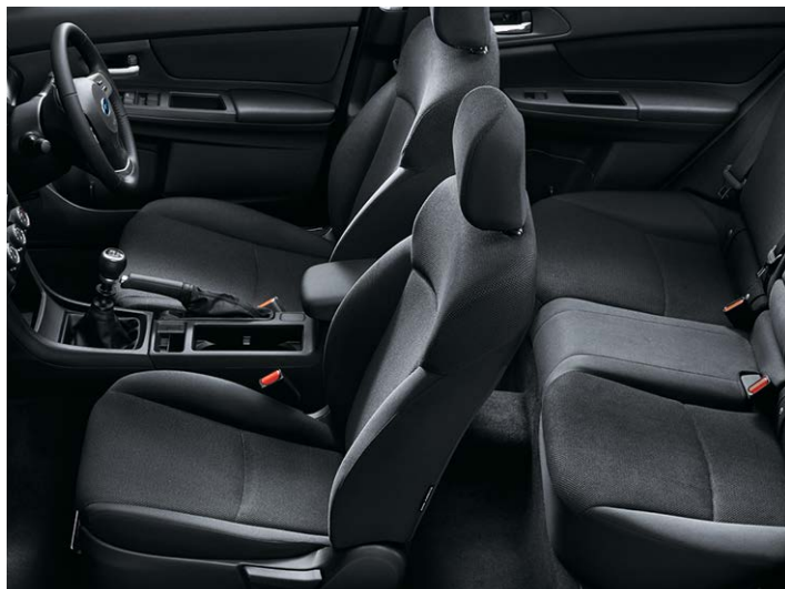
CLOTH: BLACK OR IVORY: IMPREZA 2.0i and IMPREZA 2.0i-L