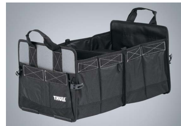
THULE GO BOX