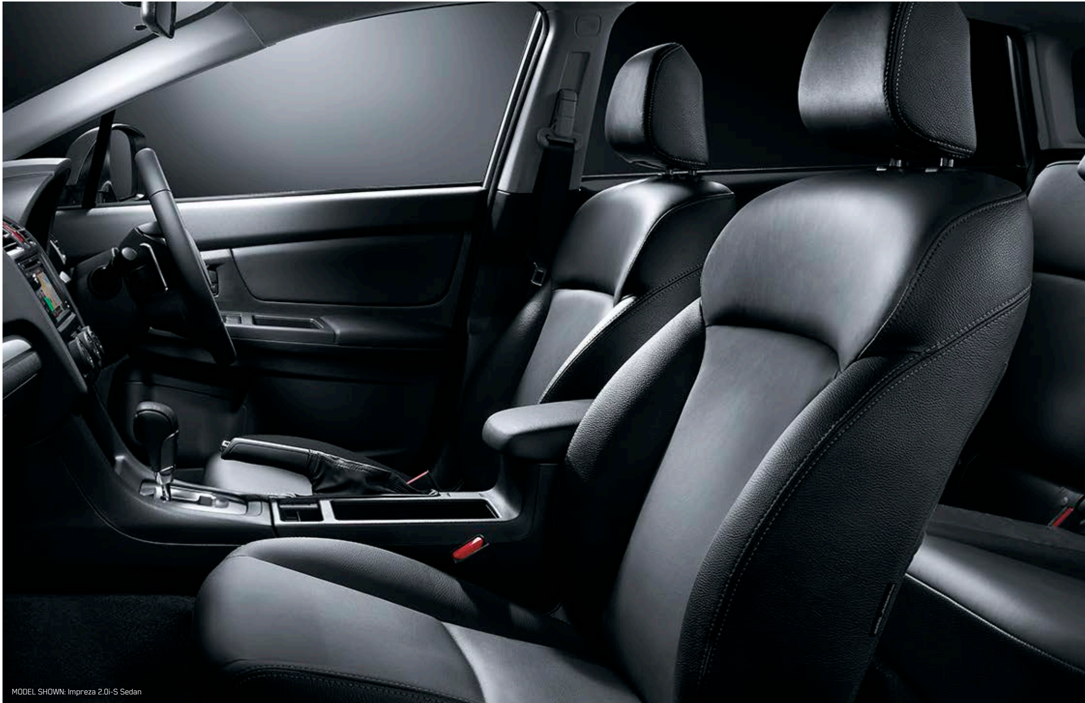
MODEL SHOWN: Impreza 2.0i-S Sedan