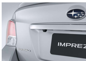
REAR REVERSE CAMERA