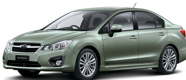
JASMINE GREEN METALLIC 1