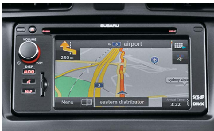
FACTORY FIT MULTI-INFORMATION IN-DASH SATELLITE NAVIGATION SYSTEM 2 : IMPREZA 2.0i-L AND IMPREZA 2.0i-S