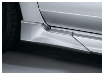
AERO MUDFLAP - FRONT (IMPREZA 2.0i-S ONLY)