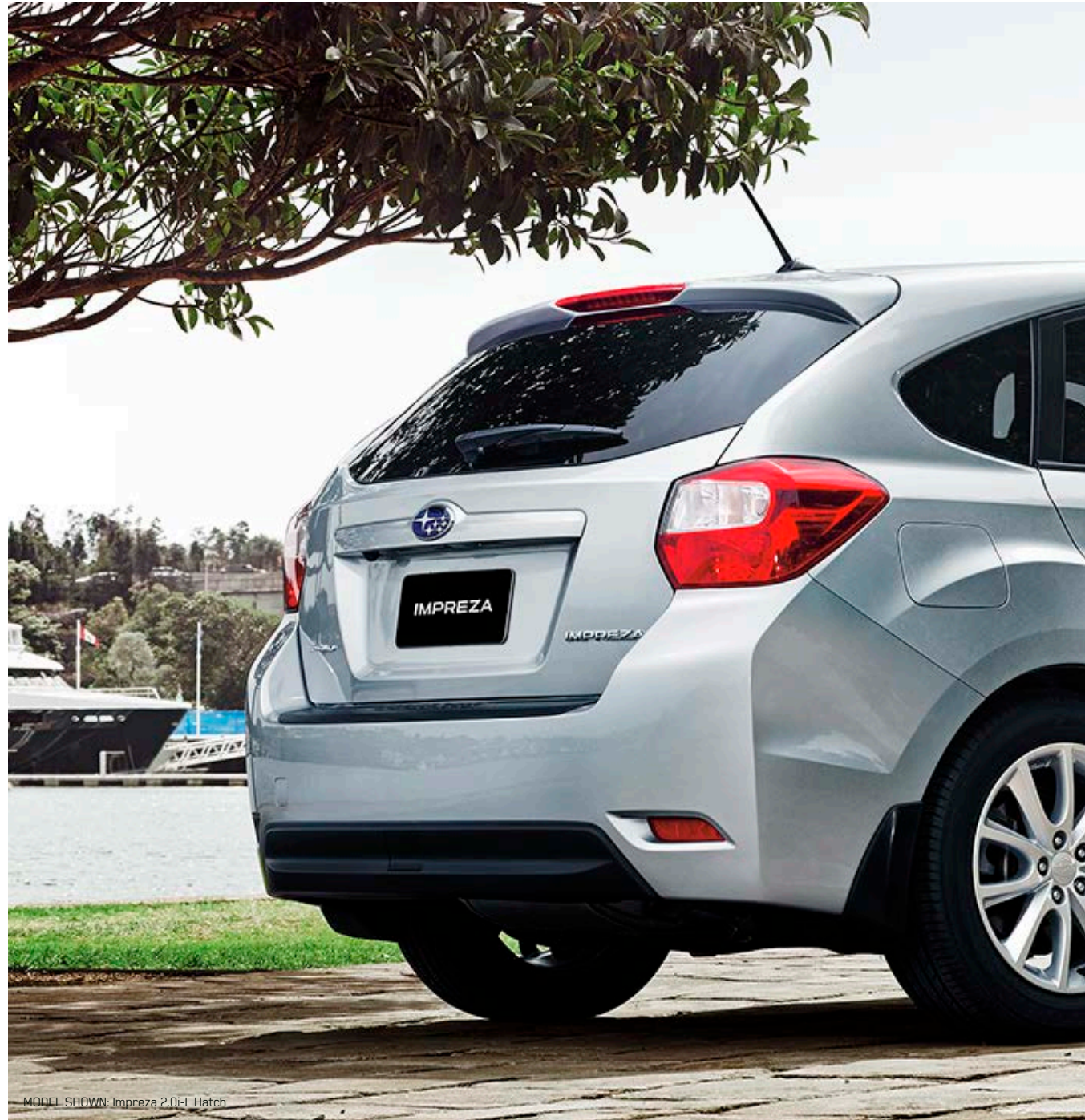
MODEL SHOWN: Impreza 2.0i-L Hatch

IN DESIGNING THE IMPREZA, SUBARU REALLY DID THINK OUTSIDE THE BOX. THEY THOUGHT Laterally. THEY DREAMED BIG. AND THEN THEY CREATED A SMALL CAR BOASTING SUBARU'S RENOWNED BOXER ENGINE, COUPLED WITH CUTTING-EDGE TECHNOLOGY, FEATURES AND STYLE. DIFFERENT FROM THE GROUND UP, IT'S THE SMALL CAR THAT STANDS OUT FROM THE CROWD.