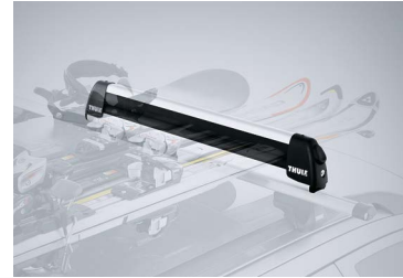
UNIVERSAL LOCKING ARMS 1