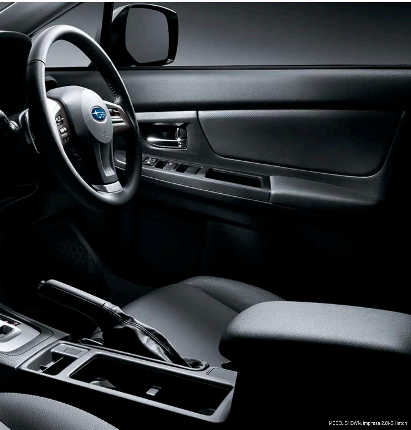
MODEL SHOWN: Impreza 2.0i-S Hatch