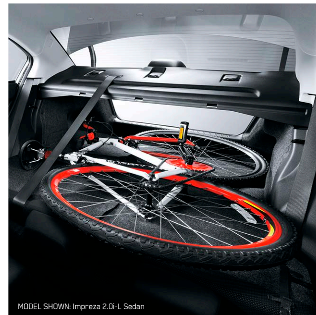
MODEL SHOWN: Impreza 2.0i-L Sedan