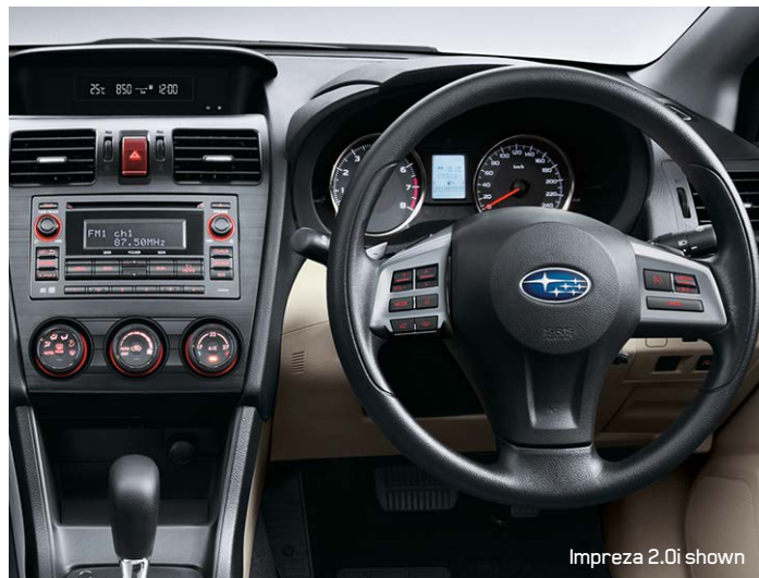
Impreza 2.0i shown