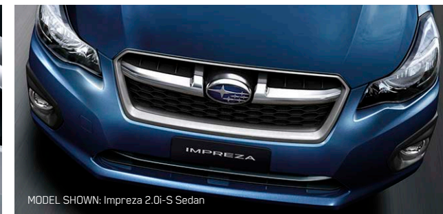
MODEL SHOWN: Impreza 2.0i-S Sedan