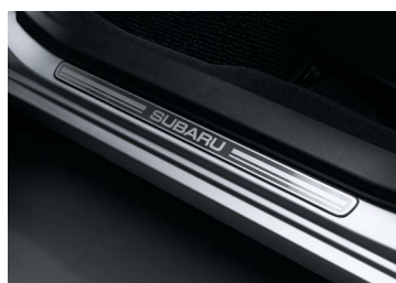
SIDE SILL PLATE