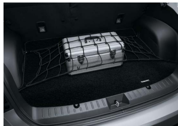
CARGO NET (FLOOR)