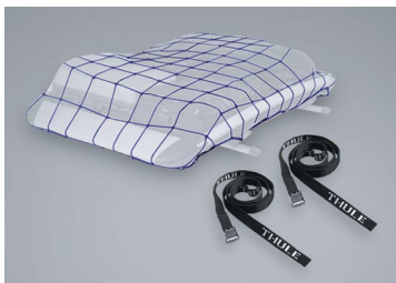
NET AND STRAPS FOR LUGGAGE RACK