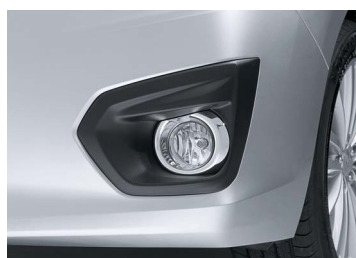
FOG LAMP KIT