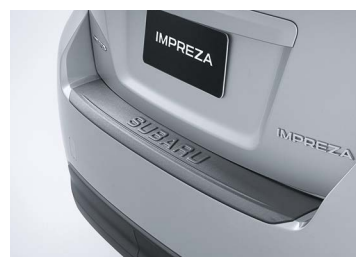
CARGO STEP PANEL - RESIN