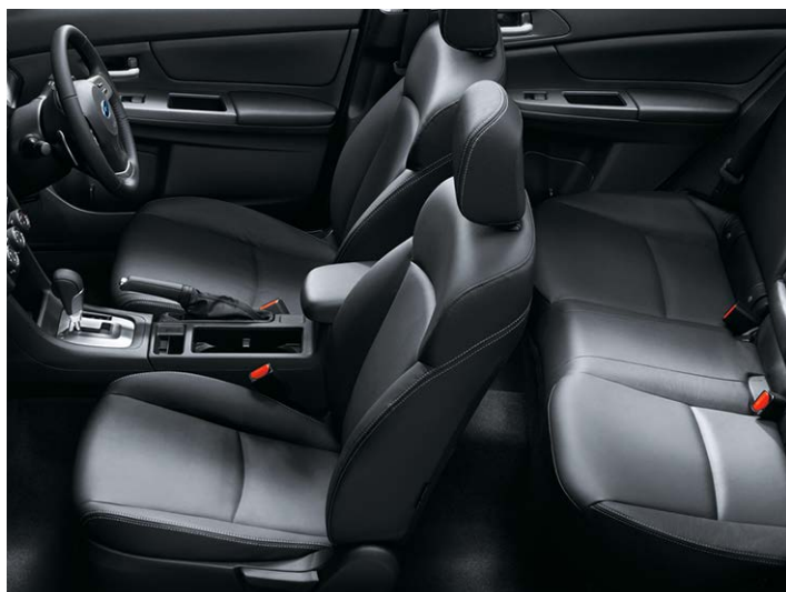
LEATHER: 1 BLACK OR IVORY: IMPREZA 2.0i-S