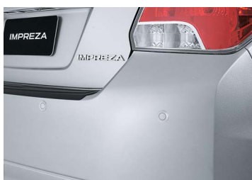
PARKING ASSIST (REAR)