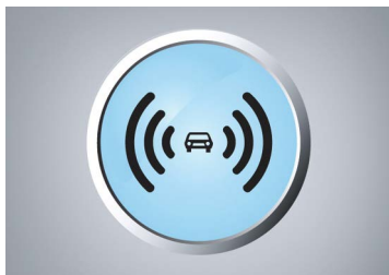
SECURITY ALARM SYSTEM