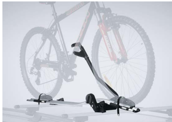
BICYCLE HOLDER 1 (UPRIGHT)