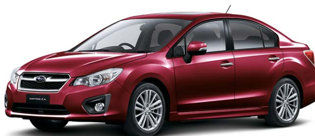
VENETIAN RED PEARL