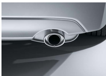
CHROME EXHAUST EXTENSION