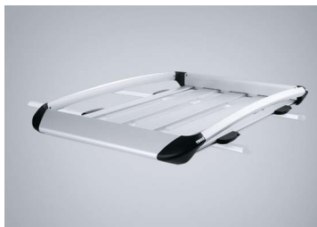
LUGGAGE RACK 1 (SMALL / LARGE)