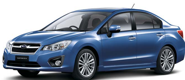
QUARTZ BLUE PEARL