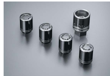
WHEEL LOCK NUTS