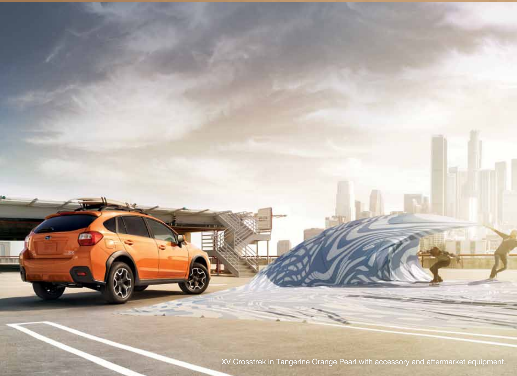
XV Crosstrek in Tangerine Orange Pearl with accessory and aftermarket equipment.