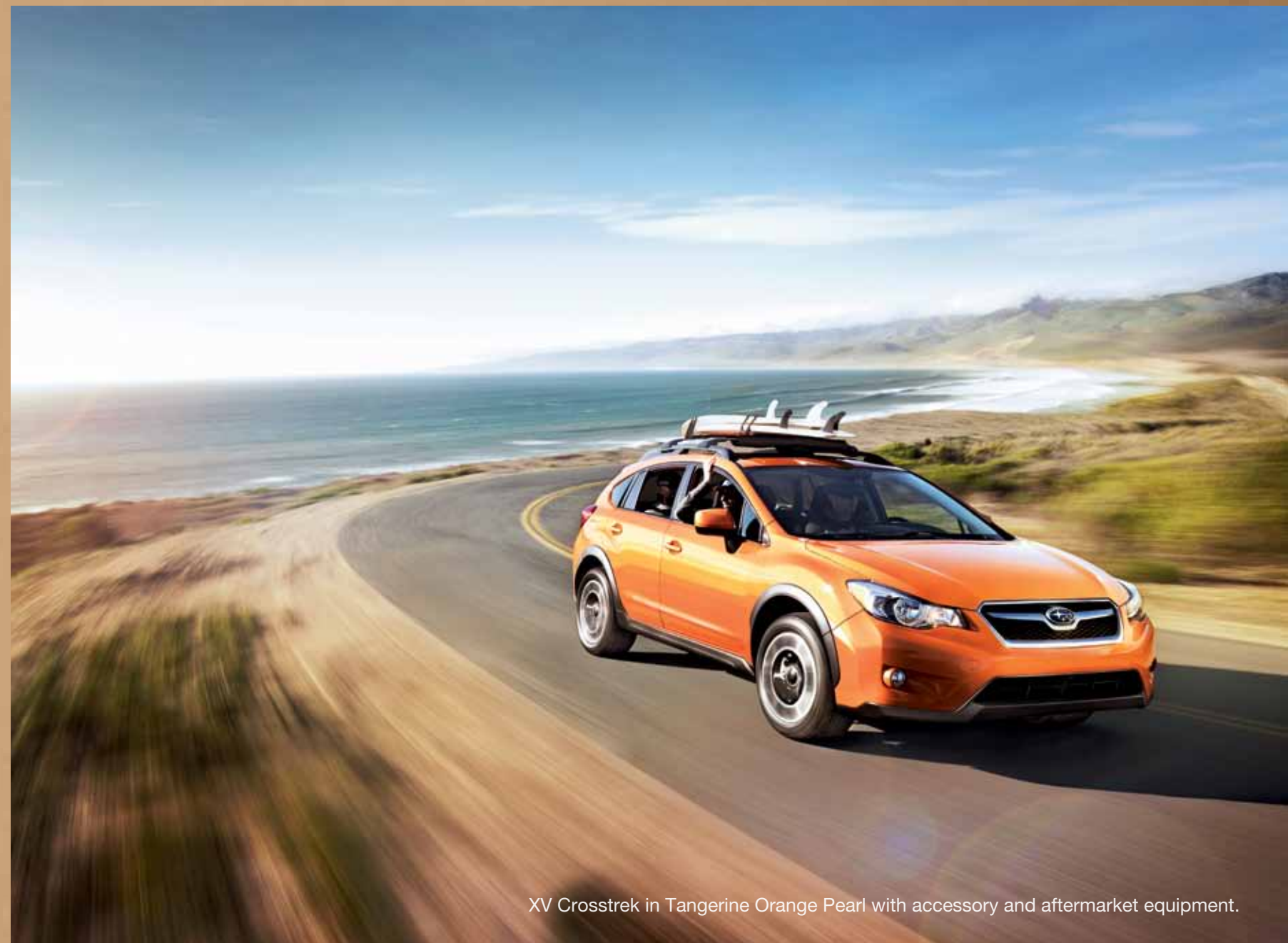
XV Crosstrek in Tangerine Orange Pearl with accessory and aftermarket equipment.

Jump in the smartly designed, all-new and spacious Subaru XV Crosstrek and you'll know that Subaru engineers had more than driving in mind. Sturdy, adventure-friendly, ecologically aware, and equipped with all of the versatility you need, the XV Crosstrek was made to get in and out of all the places where you make life happen.