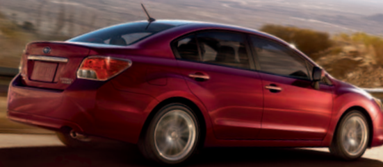
Impreza 2.0i Limited 4-door in Venetian Red Pearl.