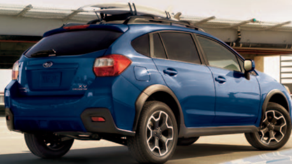
XV Crosstrek 2.0i Premium in Marine Blue Pearl with accessory and aftermarket equipment