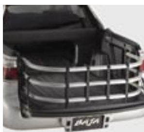
Cargo bed extender

Personalize your Subaru Baja with a wide range of interior and exterior accessories. Visit your Subaru Dealer for complete details.