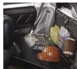
Interior cargo nets