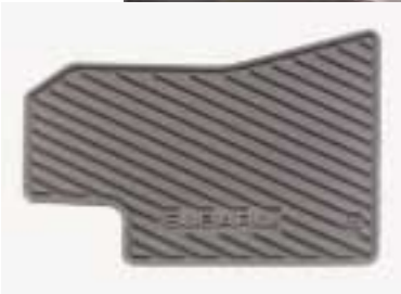
All weather heavy-gauge, custom fitted protective mats.