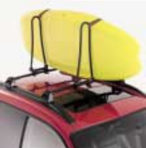
Kayak carrier. Attaches quickly and easily to cross bars. Carries two kayaks.