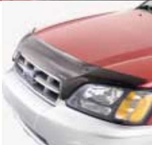
Hood protector. Durable acrylic plastic wrap-around design helps protect the Baja hood from stone chips and bugs.