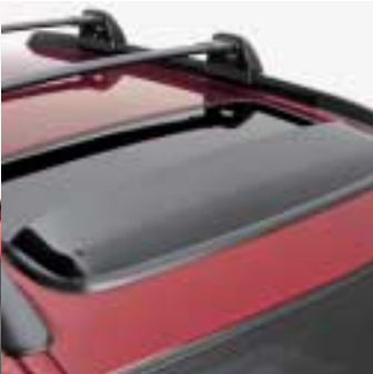
Moonroof air deflector. Helps reduce wind noise and cuts sun glare.