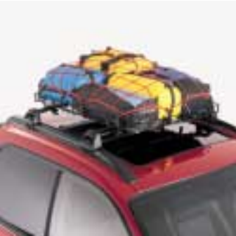
Roof cargo basket. Adds increased cargo carrying capacity.