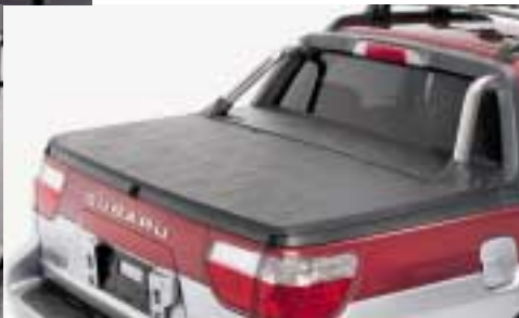
Bed cover (Tonneau). Unique weather resistant vinyl and plastic cover helps protect bed cargo area from the elements. Vinyl cover may be rolled up and secured to access bed area.