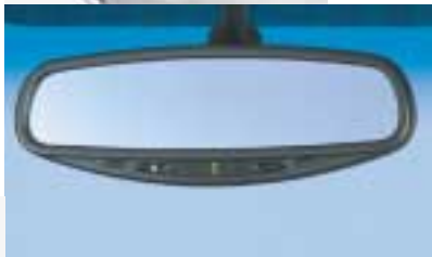
Auto-dimming mirror/compass. Includes electronic compass. Mirror darkens when headlights are detected from rear of vehicle.