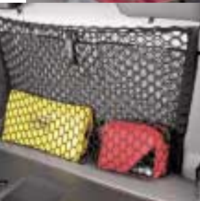
Cargo net, vertical. For secure storage of items behind the rear seat.