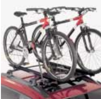
Bike attachment. Transports two bicycles in secure fashion.