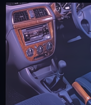
Wood Effect Dash Panel Kit Wood Effect Handbrake Lever