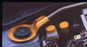
Front Strut Brace