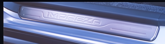
Stainless Steel Entry Guard

Please note that these accessories are NOT included on the standard Impreza WRX UK300.