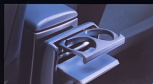
Rear Cup Holder