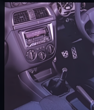
Carbon Effect Dash Panel Kit Carbon Effect Gear Knob Carbon Effect Handbrake Lever