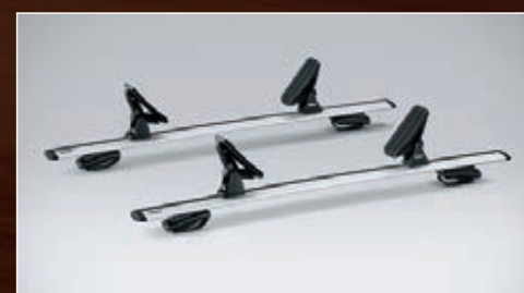
KAYAK CARRIER - DOCKGLIDE