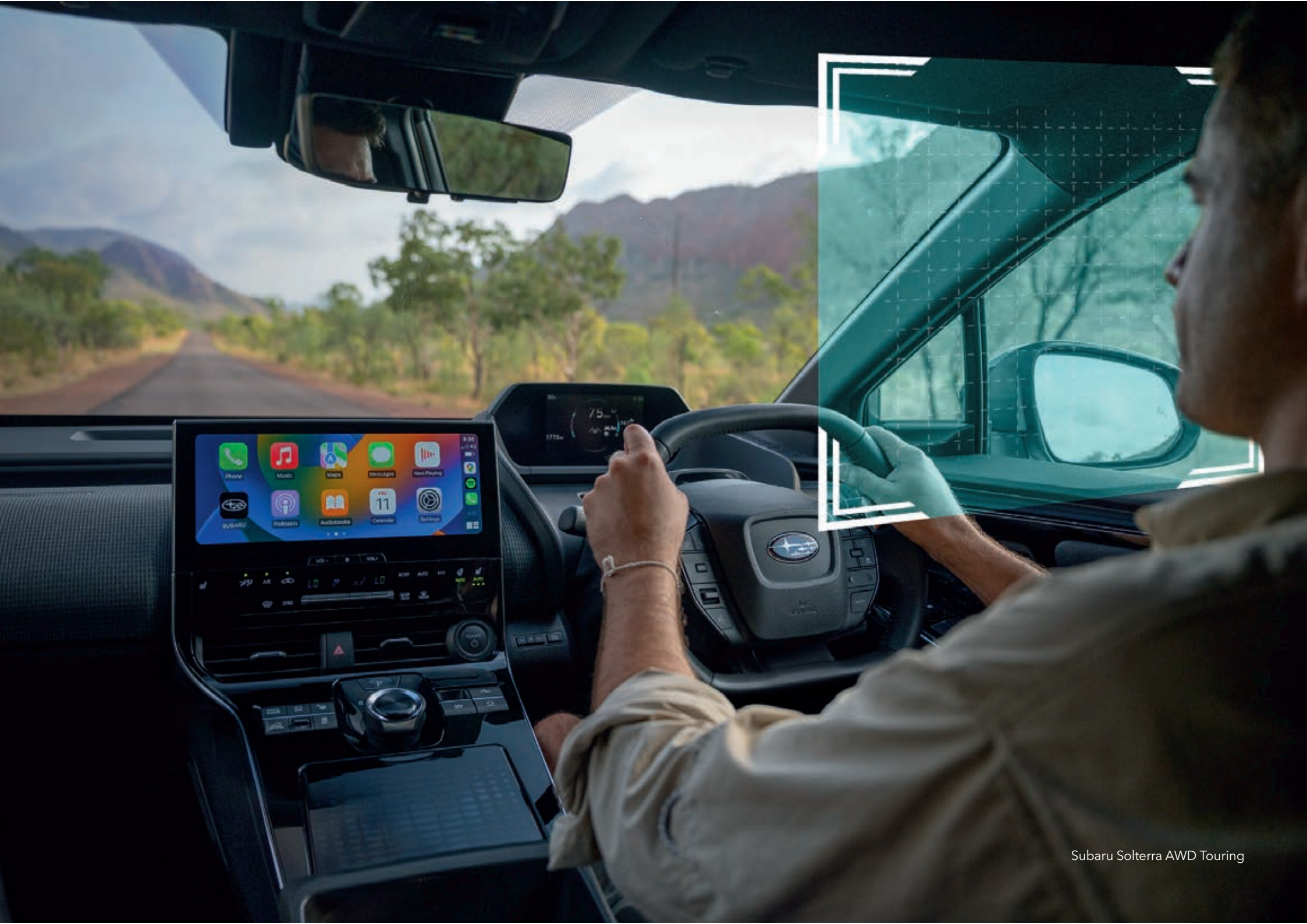
Subaru Solterra AWD Touring