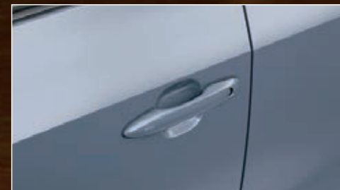
PROTECTION FILM DOOR HANDLE