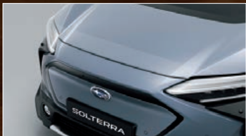
PROTECTION FILM HOOD