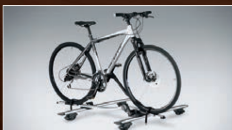
BIKE HOLDER - SILVER