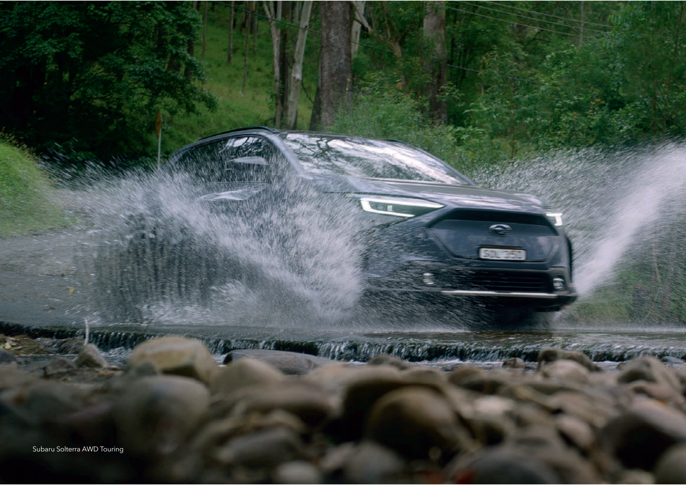
Subaru Solterra AWD Touring