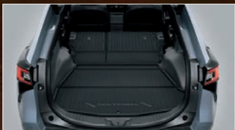
REAR BACK SEAT PROTECTOR