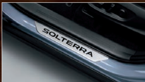
ALUMINIUM SCUFF PLATE