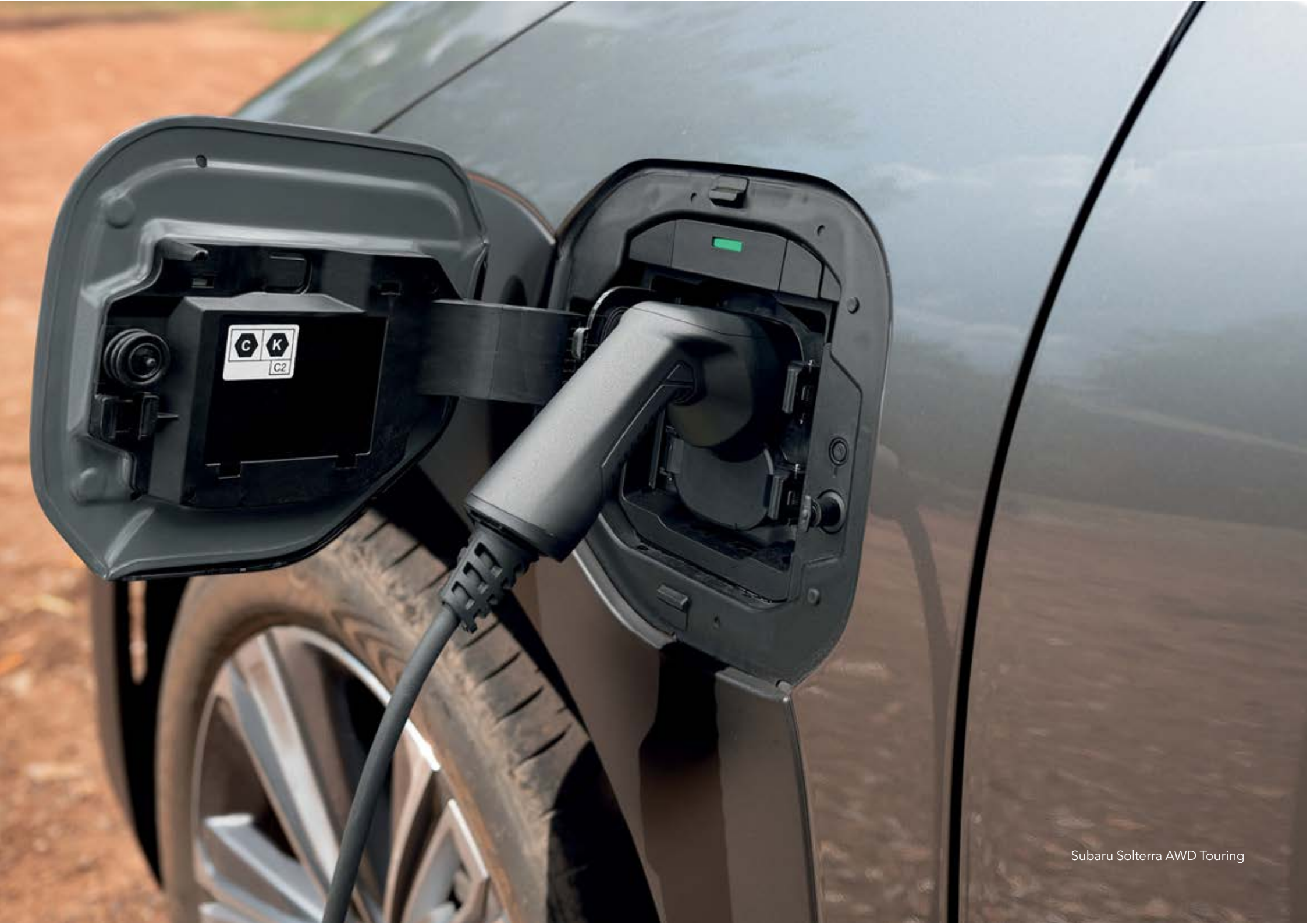
Subaru Solterra AWD Touring