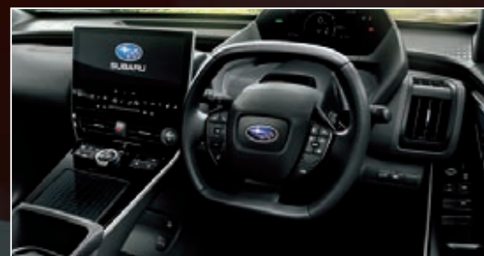
HEATED STEERING WHEEL

Premium 10 speaker Harman Kardon® 4 sound system available on the Subaru Solterra AWD Touring only.