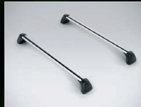
ROOF CROSSBARS 1