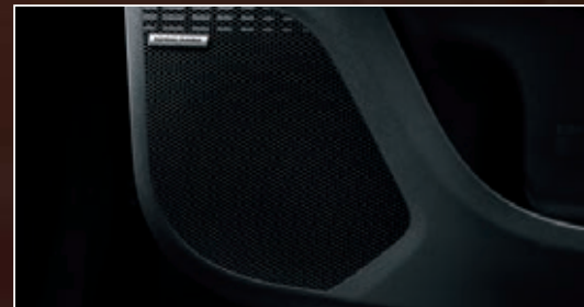
10 HARMAN KARDON® 4 SPEAKERS

Premium 10 speaker Harman Kardon® 4 sound system available on the Subaru Solterra AWD Touring only.