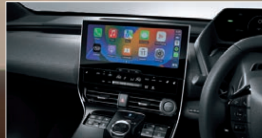
12.3" TOUCHSCREEN INFOTAINMENT SYSTEM