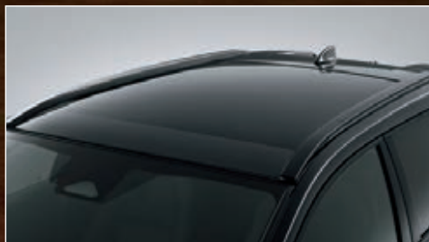
PROTECTION FILM ROOF