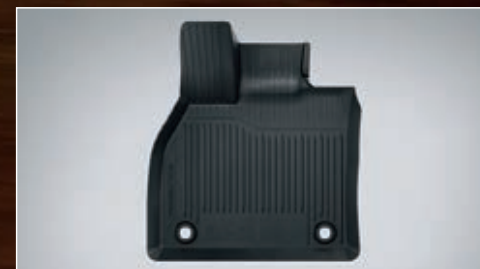
FLOOR MAT RUBBER