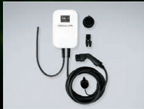
OCULAR LTE PLUS - 3 PHASE

With a world waiting to be discovered beyond your driveway, Subaru Solterra has the accessories to make every trip epic. Traverse country lanes and back roads with premium accessories designed to make the most of every season, from surf to snow.