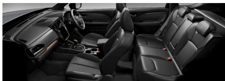
Black Leather (2.5i-S EyeSight)