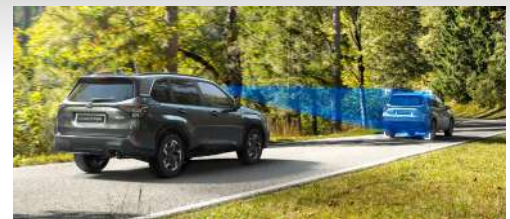
Eyesight Driver Assist Technology