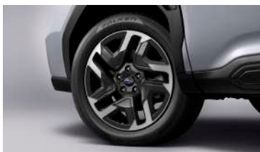
18-inch Aluminium-alloy Wheels