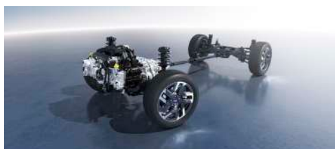
Lineartronic + Active Torque Split AWD