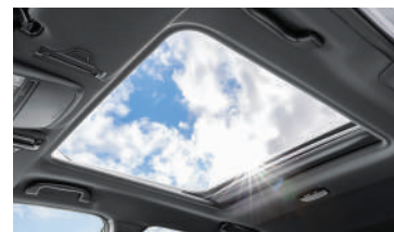
Power-sliding, Tilt-adjustable Glass Sunroof