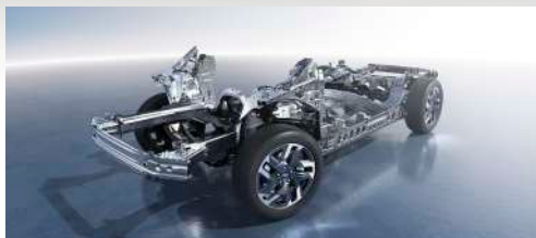
Subaru Global Platform

Subaru's core technologies identify the Subaru brand and give you the unique driving feel you can find only in a Subaru. These core systems allow Subaru vehicles to live up to its standards in performance, comfort, safety, and reliability while keeping its promise to deliver enjoyment and peace of mind to all passengers.