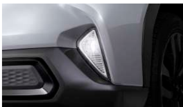
LED Front Fog Lamps