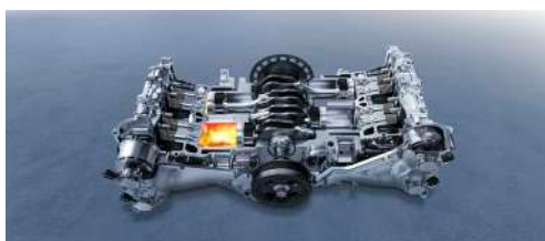
SUBARU BOXER Engine