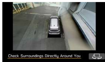
Multi View Monitor