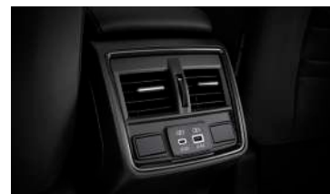
Rear Ventilation System