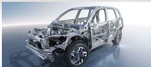
Full Inner Frame Structure