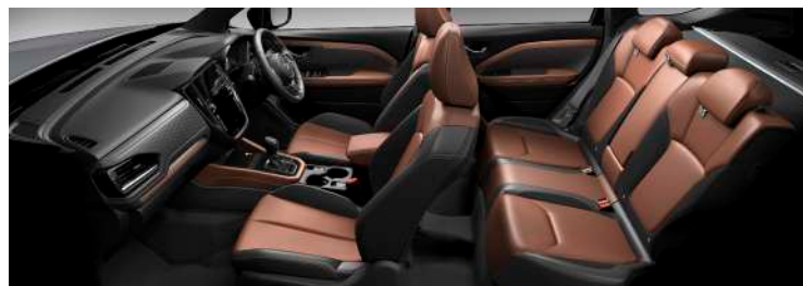
Brown Leather (2.5i-S EyeSight)**