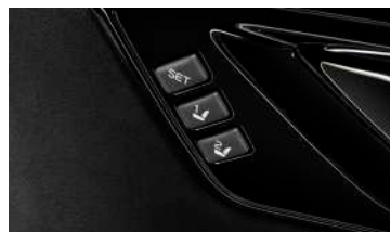
Seat Position Memory Switch