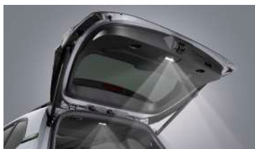
LED Rear Gate Light