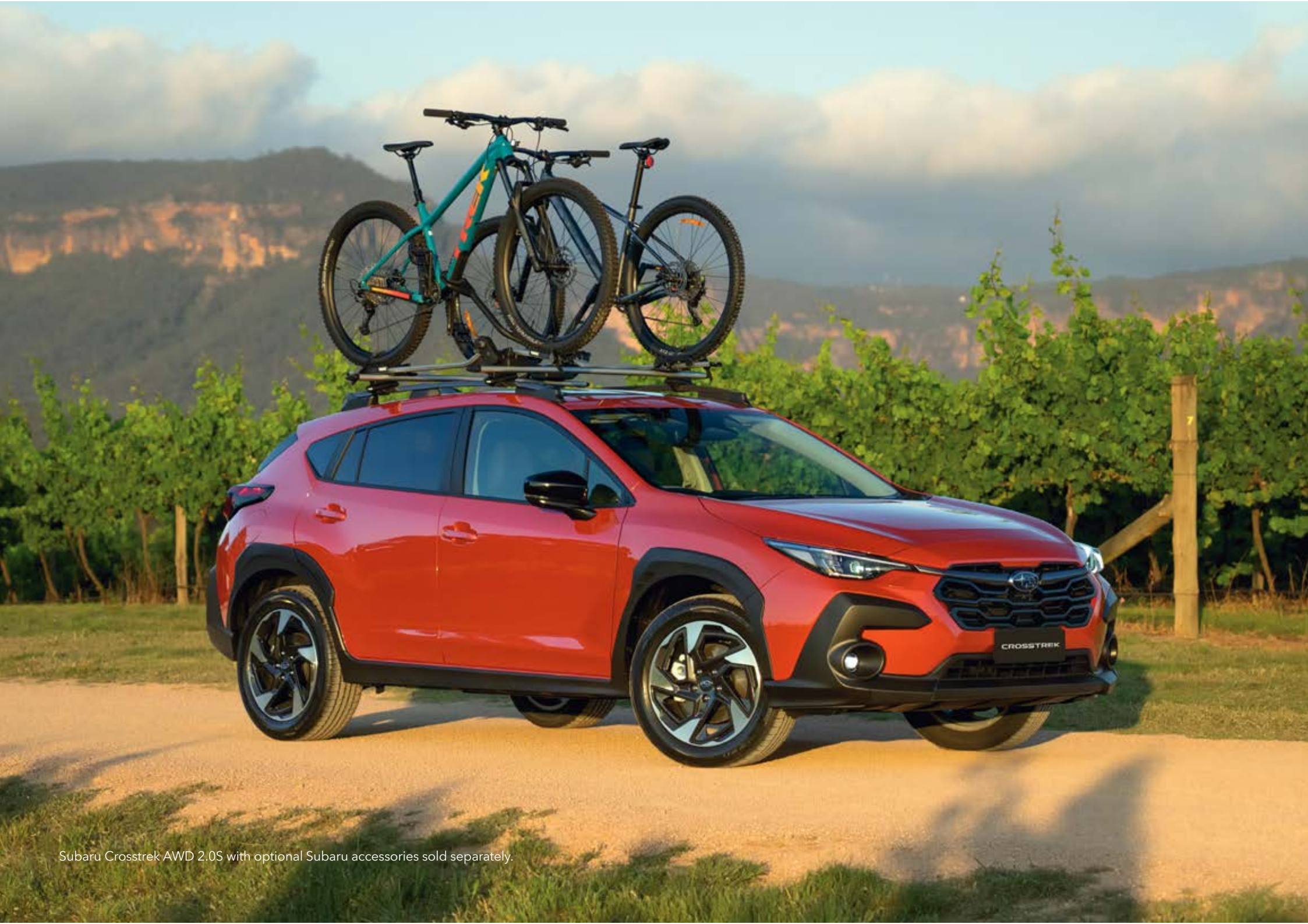
Subaru Crosstrek AWD 2.0S with optional Subaru accessories sold separately.