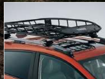
THULE ROOF BASKET