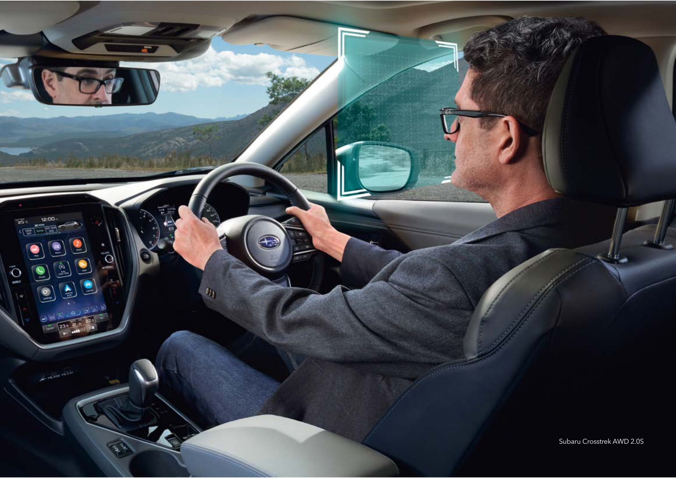
Subaru Crosstrek AWD 2.0S