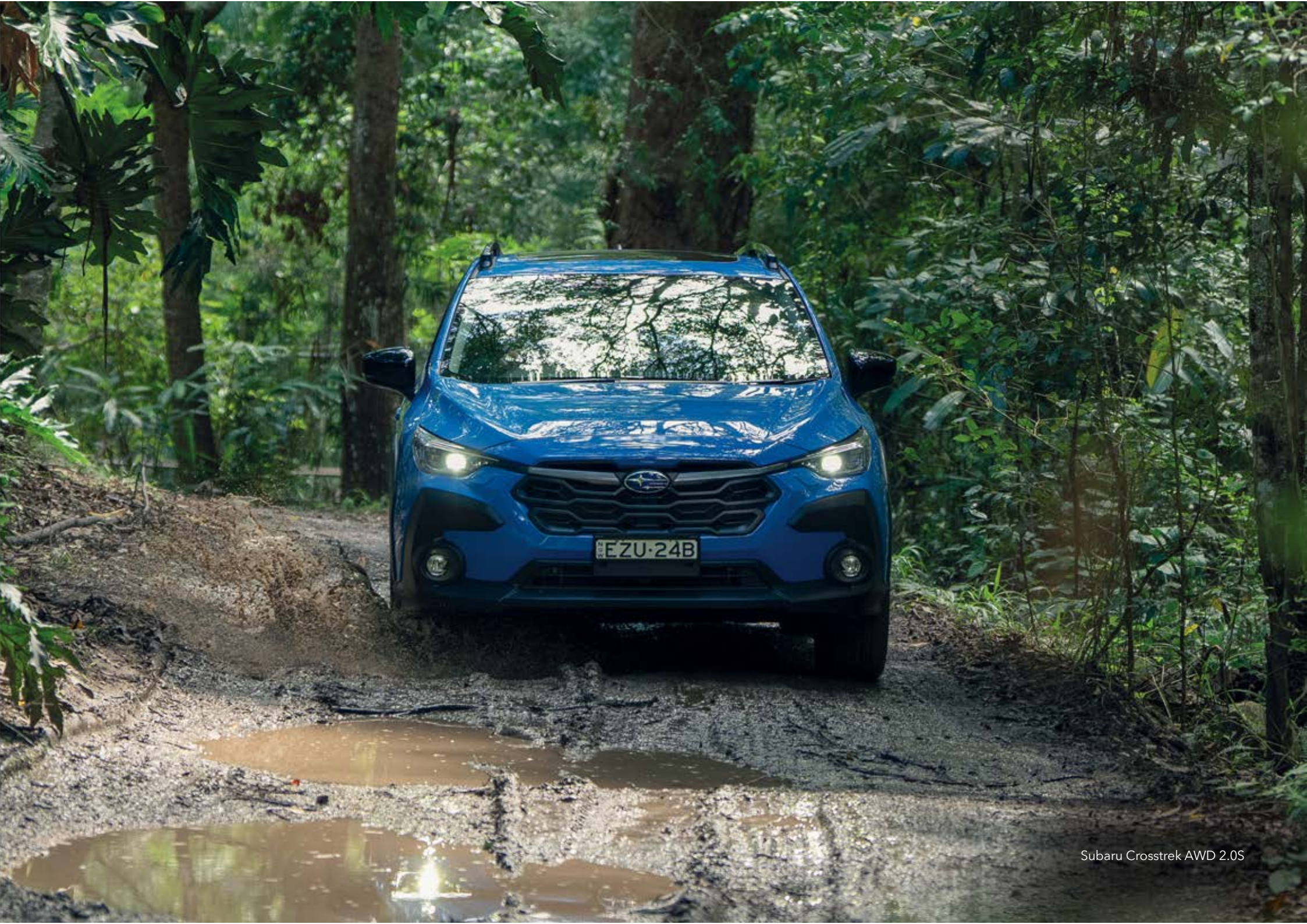
Subaru Crosstrek AWD 2.0S