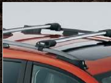
LOW PROFILE CROSS BARS