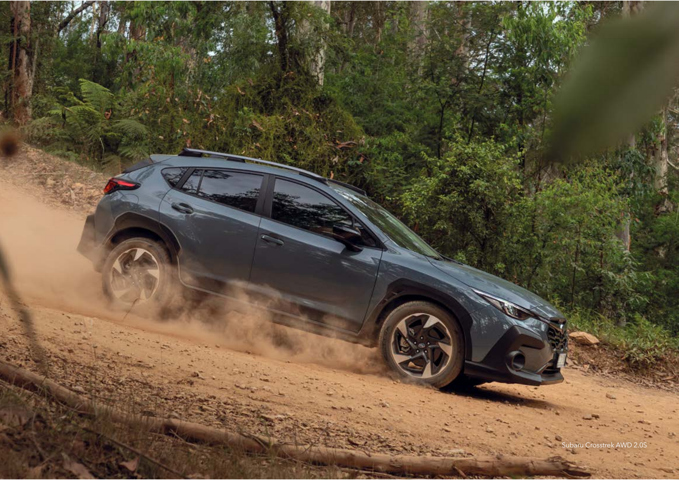
Subaru Crosstrek AWD 2.0S