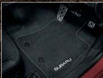
CARPET MAT SET