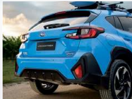
Subaru Crosstrek AWD Hybrid S