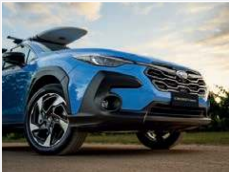
Subaru Crosstrek AWD Hybrid S

The future is now, with Subaru e-Boxer technology driving the Subaru Crosstrek Hybrid variants. The dynamic plug-free hybrids seamlessly team power from a compact battery and quiet electric motor, with the petrol engine for the ultimate in driving efficiency.