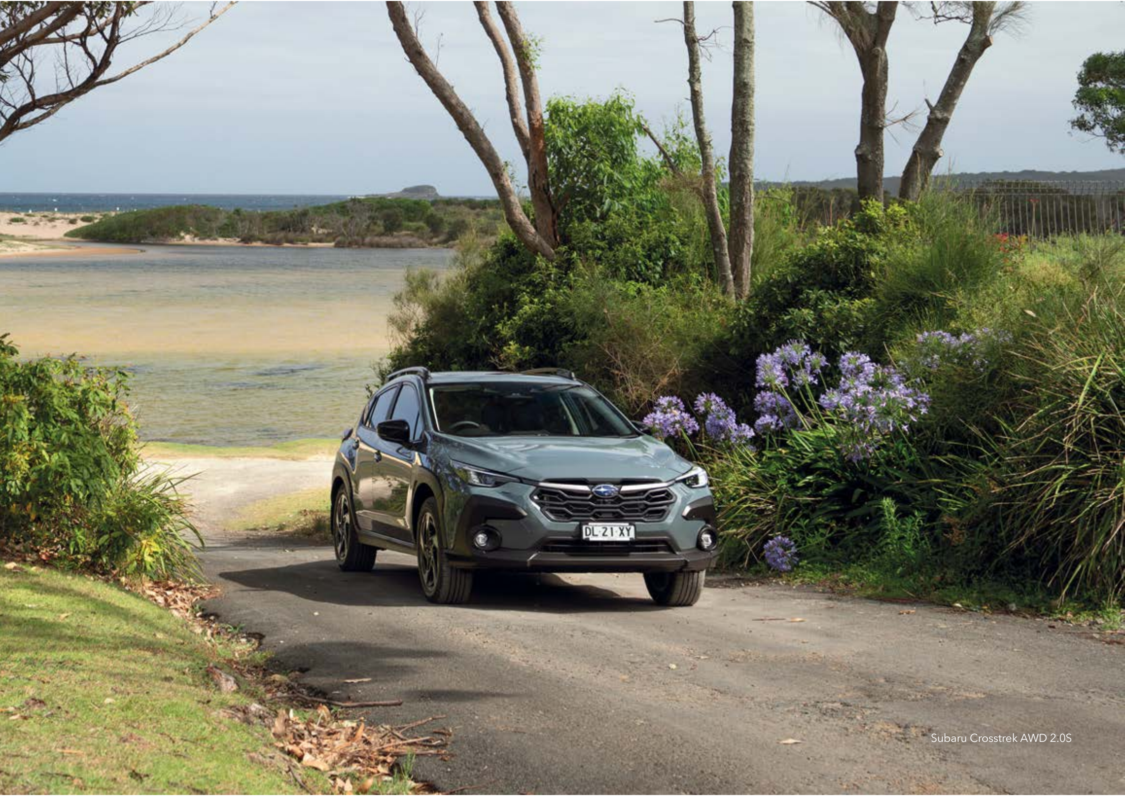
Subaru Crosstrek AWD 2.0S