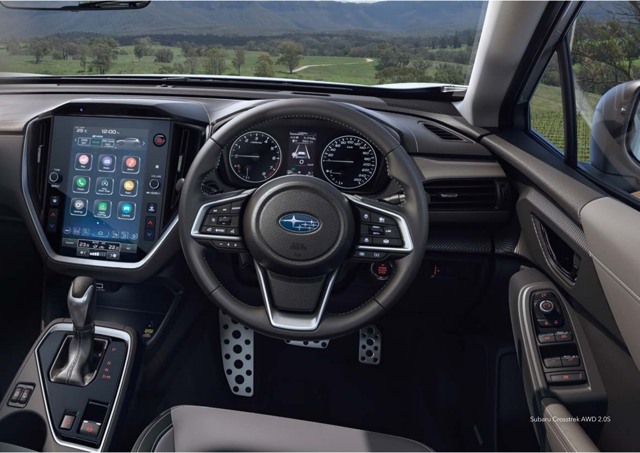
Subaru Crosstrek AWD 2.0S