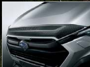
FRONT NOSE GARNISH