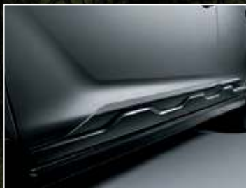
DOOR UNDER GARNISH