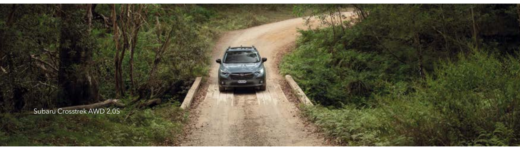
Subaru Crosstrek AWD 2.0S