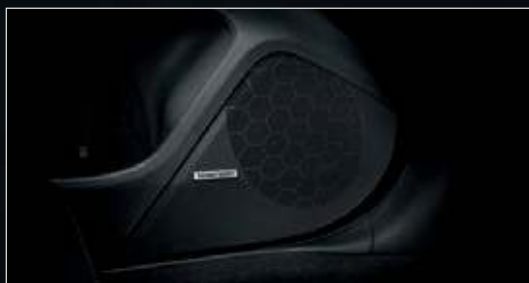
Subaru Crosstrek AWD 2.0S

Featuring the advanced, multi-function infotainment command centre, which can be controlled with the power of your voice or the flick of a finger, to select different audio options and adjust the dual zone air-conditioning.