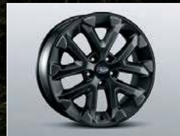
18 IN RUGGED WHEEL SET (MATT BLACK)