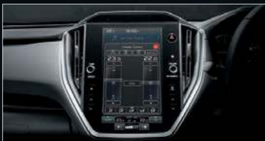
Subaru Crosstrek AWD 2.0S

A cabin intuitive to the rhythm of your drive starts with the centre information display that features a tablet-like 11.6" touchscreen with quick response touch and crystal clear high definition graphics coupled with wireless Apple CarPlay® and Android Auto™ smartphone connectivity 1 as standard. The sleek modernist cabin keeps you in tune with your contacts, podcasts and favourite apps, digital radio 2 (DAB+) streams crisp, clear sound, while Bluetooth ® 3 wireless technology, and handy USB-A and USB-C connection keeps everyone fired up.