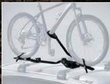
BIKE HOLDER - BLACK (PRORIDE)