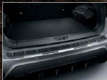
CARGO STEP PANEL (RESIN)