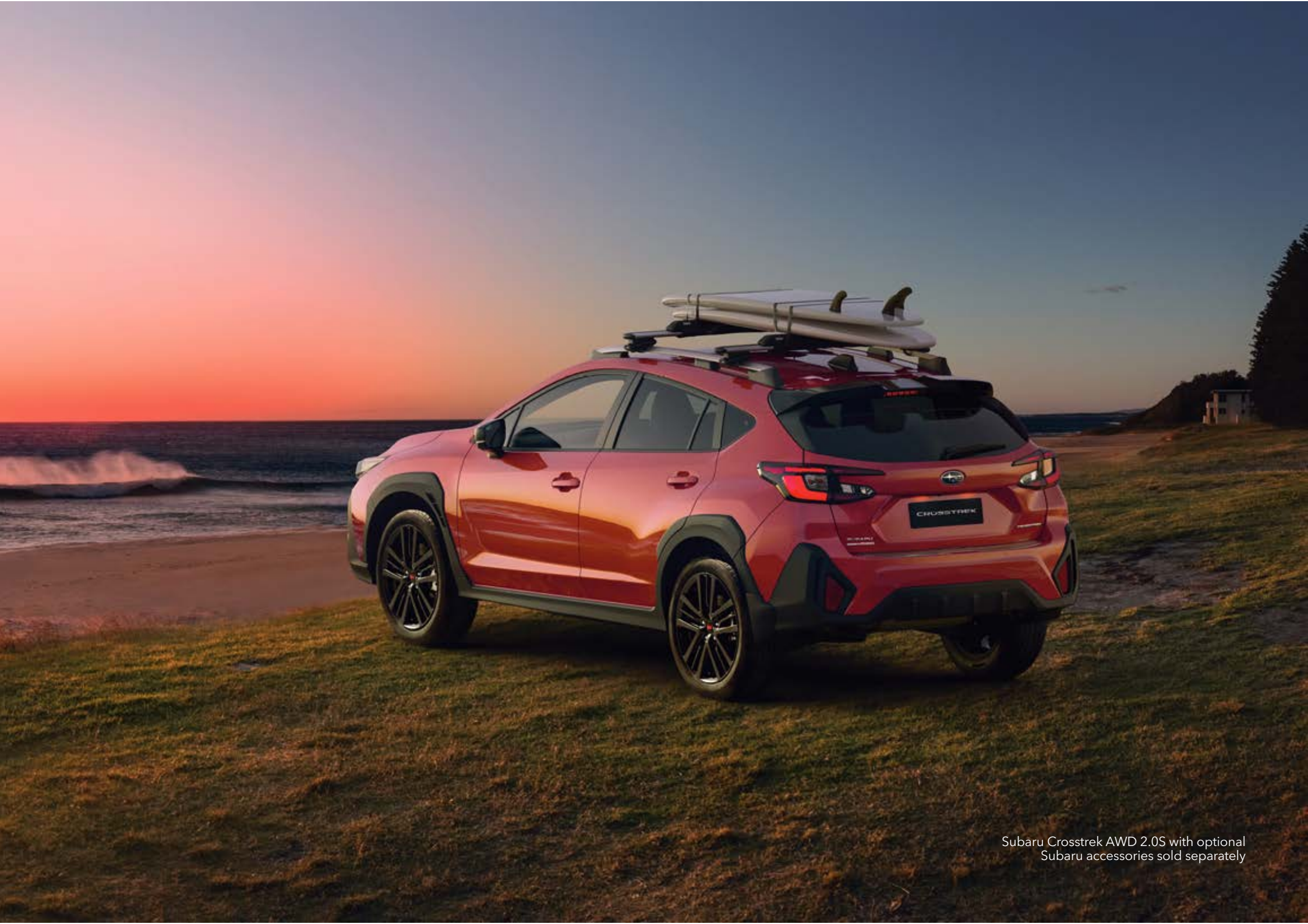
Subaru Crosstrek AWD 2.0S with optional Subaru accessories sold separately