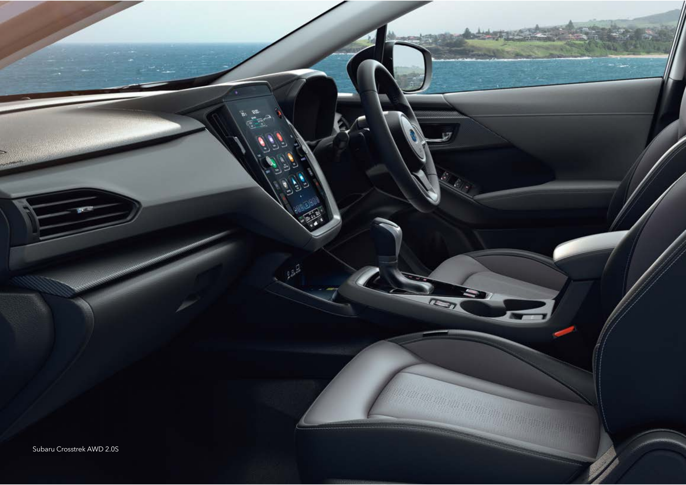
Subaru Crosstrek AWD 2.0S