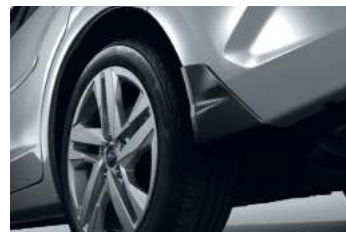
Mud Flap Set*