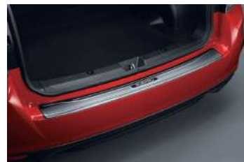
Rear Step Panel