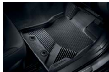
Rubber Mat Set