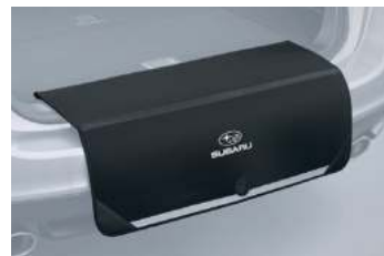
Bootlip & Bumper Protector