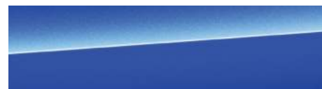
Sapphire Blue Pearl