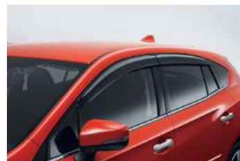
Window Weather Shield

Your Subaru isn't complete until you make it 'your Subaru'. So pick the accessories that will make it perfectly equipped for your lifestyle. You can find more accessory options at subaru.co.nz/accessories