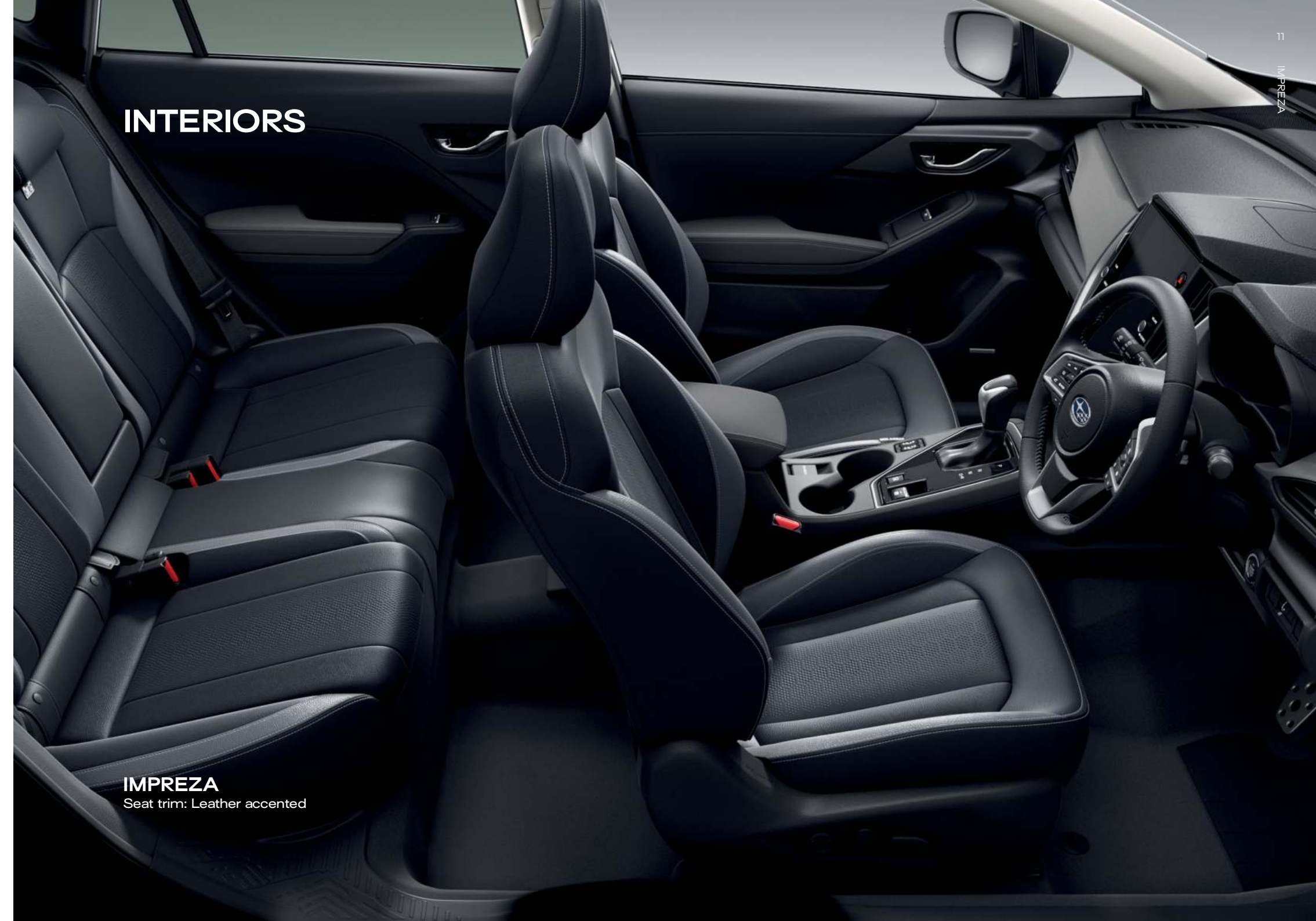
IMPREZA Seat trim: Leather accented