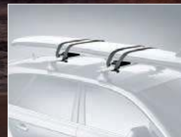
PADDLE BOARD & MAL CARRIER