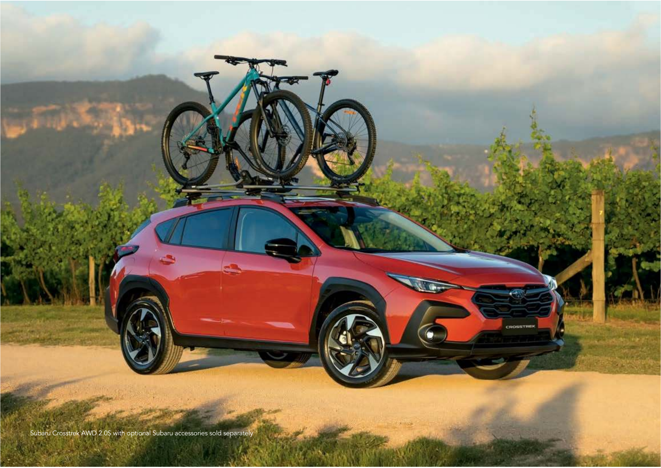
Subaru Crosstrek AWD 2.0S with optional Subaru accessories sold separately