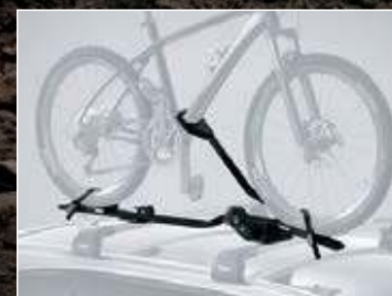
BIKE HOLDER - BLACK (PRORIDE)