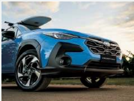
Subaru Crosstrek AWD Hybrid S

The future is now, with Subaru e-Boxer technology driving the all-new Subaru Crosstrek Hybrid variants. The dynamic plug-free hybrids seamlessly team power from a compact battery and quiet electric motor, with the petrol engine for the ultimate in driving efficiency.