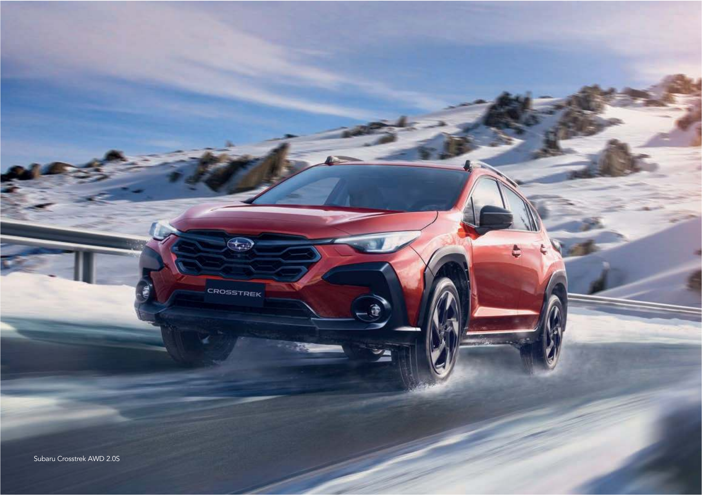
Subaru Crosstrek AWD 2.0S