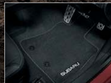
CARPET MAT SET