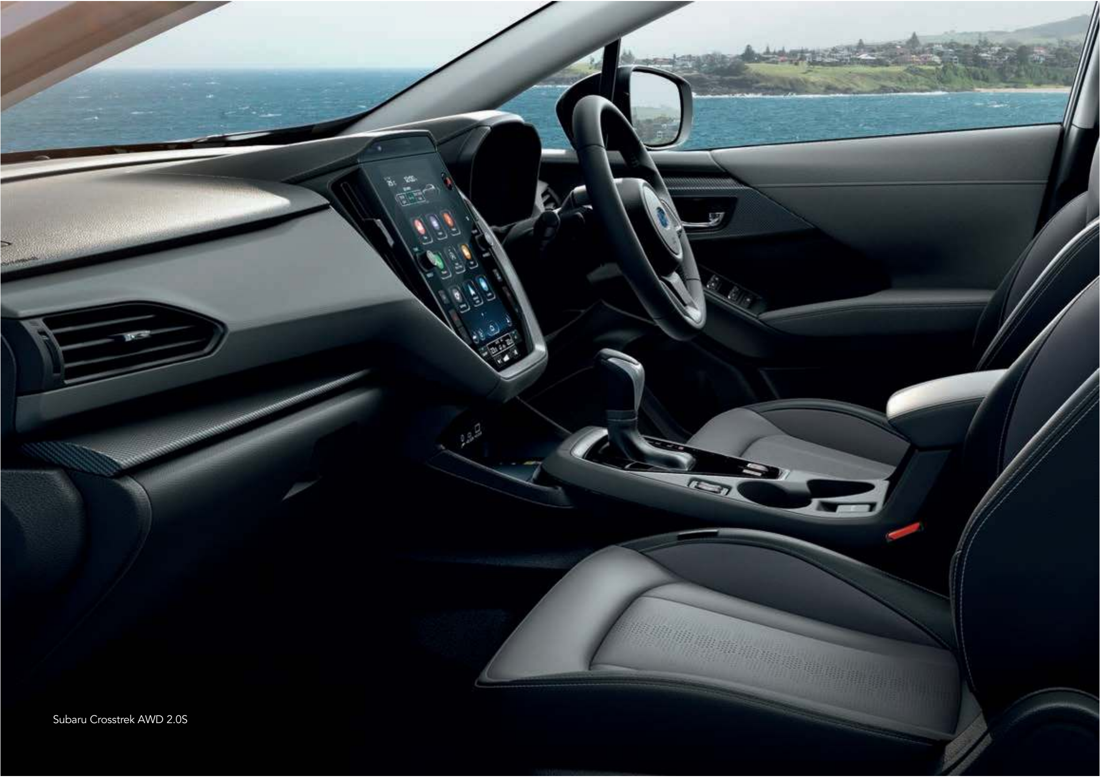
Subaru Crosstrek AWD 2.0S