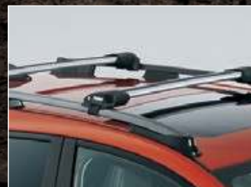
LOW PROFILE CROSS BARS