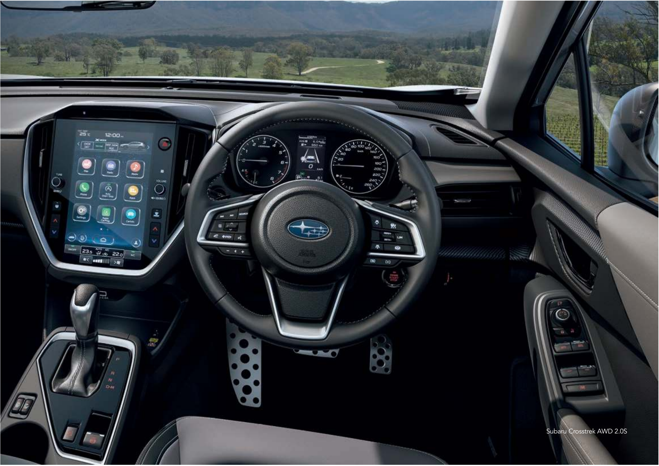
Subaru Crosstrek AWD 2.0S