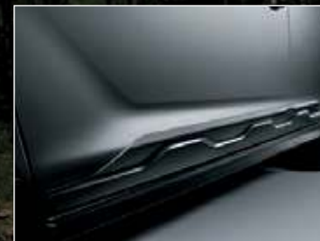
DOOR UNDER GARNISH