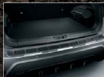
CARGO STEP PANEL (RESIN)