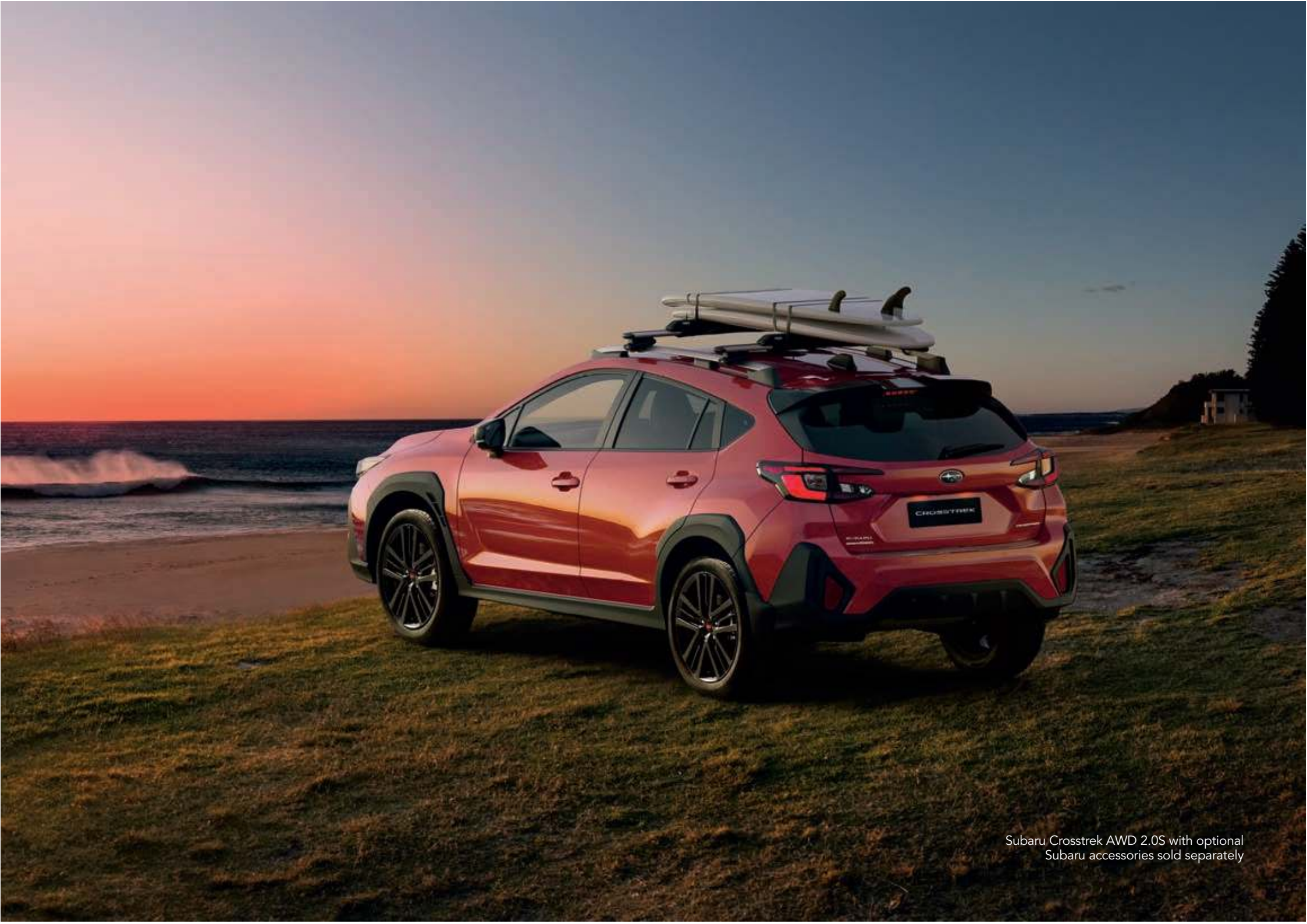
Subaru Crosstrek AWD 2.0S with optional Subaru accessories sold separately