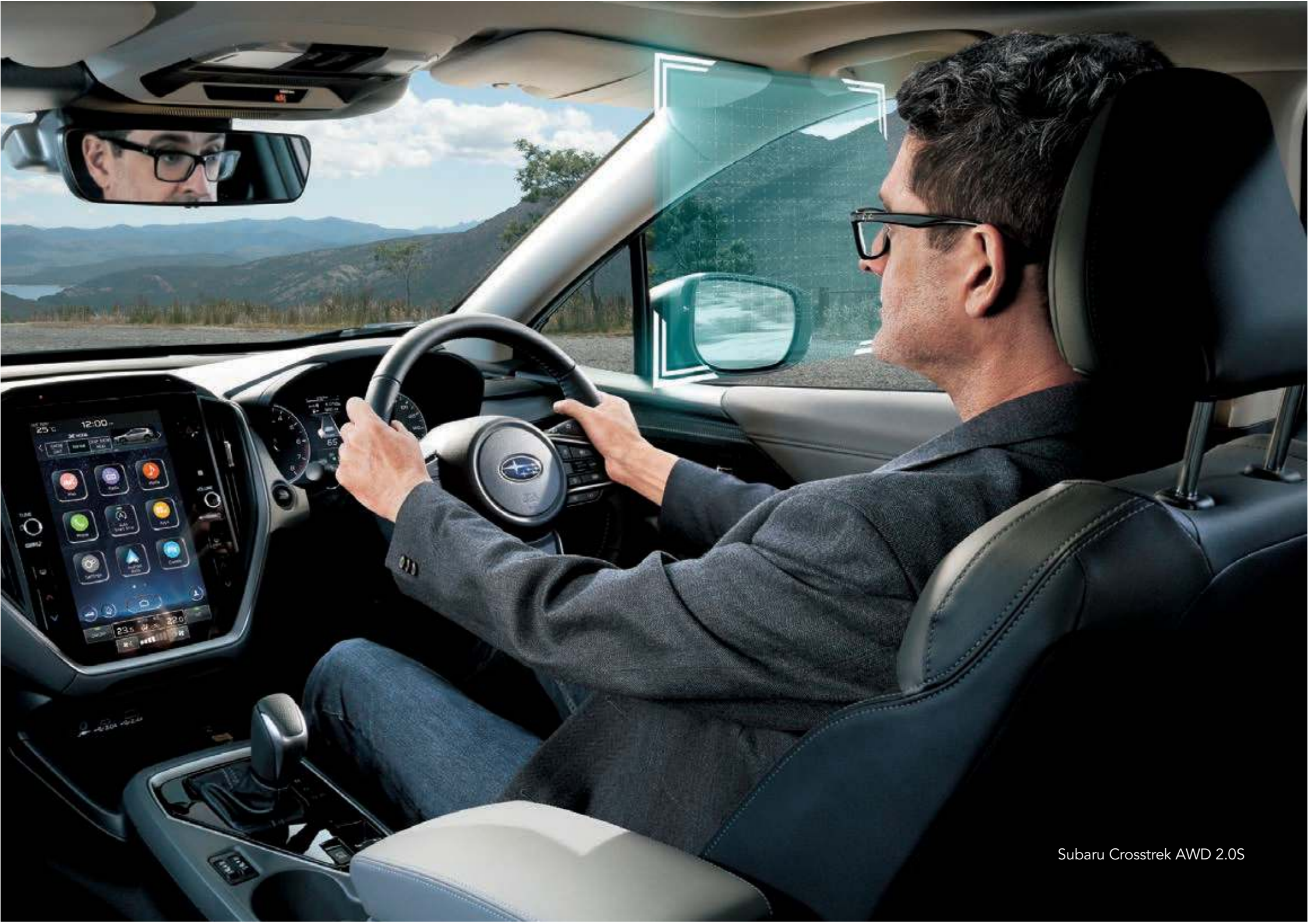
Subaru Crosstrek AWD 2.0S