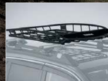
THULE ROOF BASKET