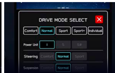
5 driving modes