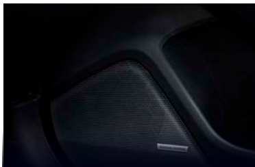
10 Harman Kardon® speakers, subwoofer and amplifier