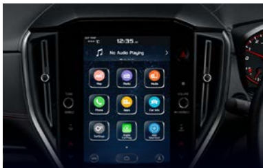
11,6" infotainment touch screen

Be the master of your own universe thanks to the tablet-like 11,6" infotainment touch screen with lightning-fast response and crystal clear, high-definition graphics. Tap into your contacts, send messages, bring up maps, select different driving modes, adjust the dual zone air-conditioning system and access compatible apps, news, music, podcasts and more. This advanced, multi-function infotainment control centre can be controlled with the mere power of your voice or the flick of a finger.