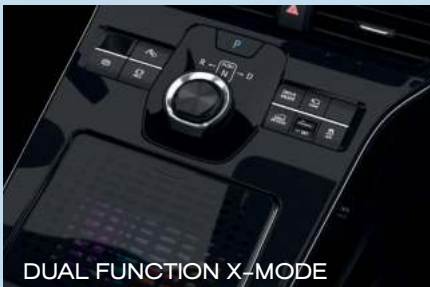
DUAL FUNCTION X-MODE