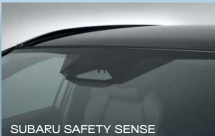
SUBARU SAFETY SENSE