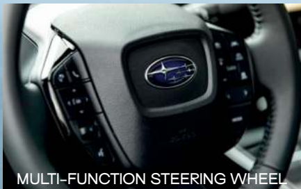
MULTI-FUNCTION STEERING WHEEL