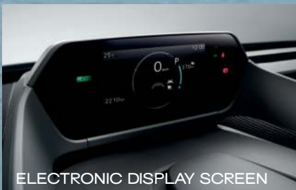
ELECTRONIC DISPLAY SCREEN