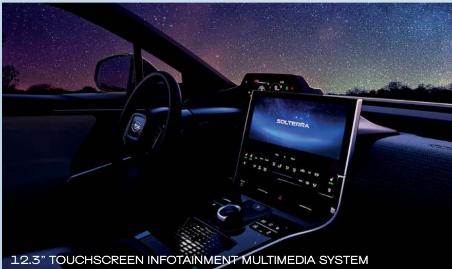
12.3" TOUCHSCREEN INFOTAINMENT MULTIMEDIA SYSTEM