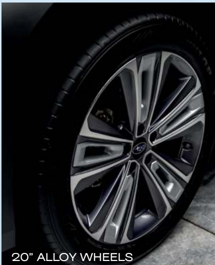
20" ALLOY WHEELS