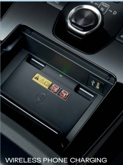
WIRELESS PHONE CHARGING