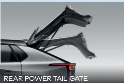
REAR POWER TAIL GATE