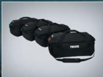
THULE GO PACK SET