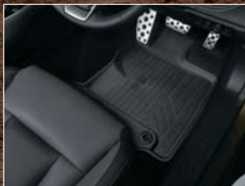
RUBBER MAT SET