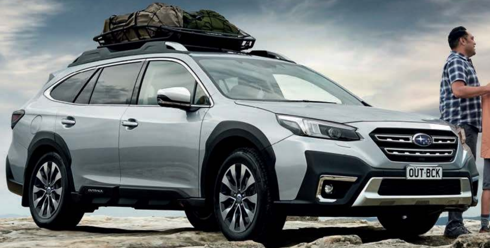
Subaru Outback AWD Touring shown with optional Subaru accessories sold separately.