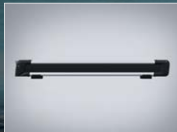
DELUXE SKI CARRIER 6 PAIR