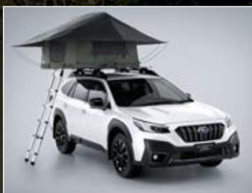
THULE ROOF TOP TENT 2 – OPEN

Maximise your next outdoor adventure with Subaru's full range of customised lifestyle accessories. Fit out your Subaru Outback with a multi accessory pack or choose individual items, like the durable Lifestyle Awning Kit 1 or Roof Top Tent 2 for easy, go anywhere camping. Or use the impressive towing capability to take your latest toy, with accessories to complement your favourite activities. For the full list of accessories available see the following pages.