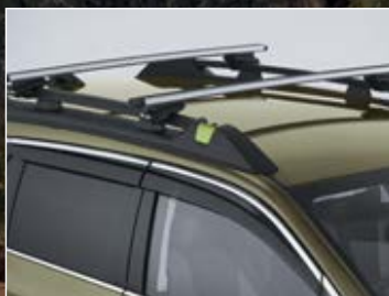
ROOF CROSS BARS Maximum load 100kg