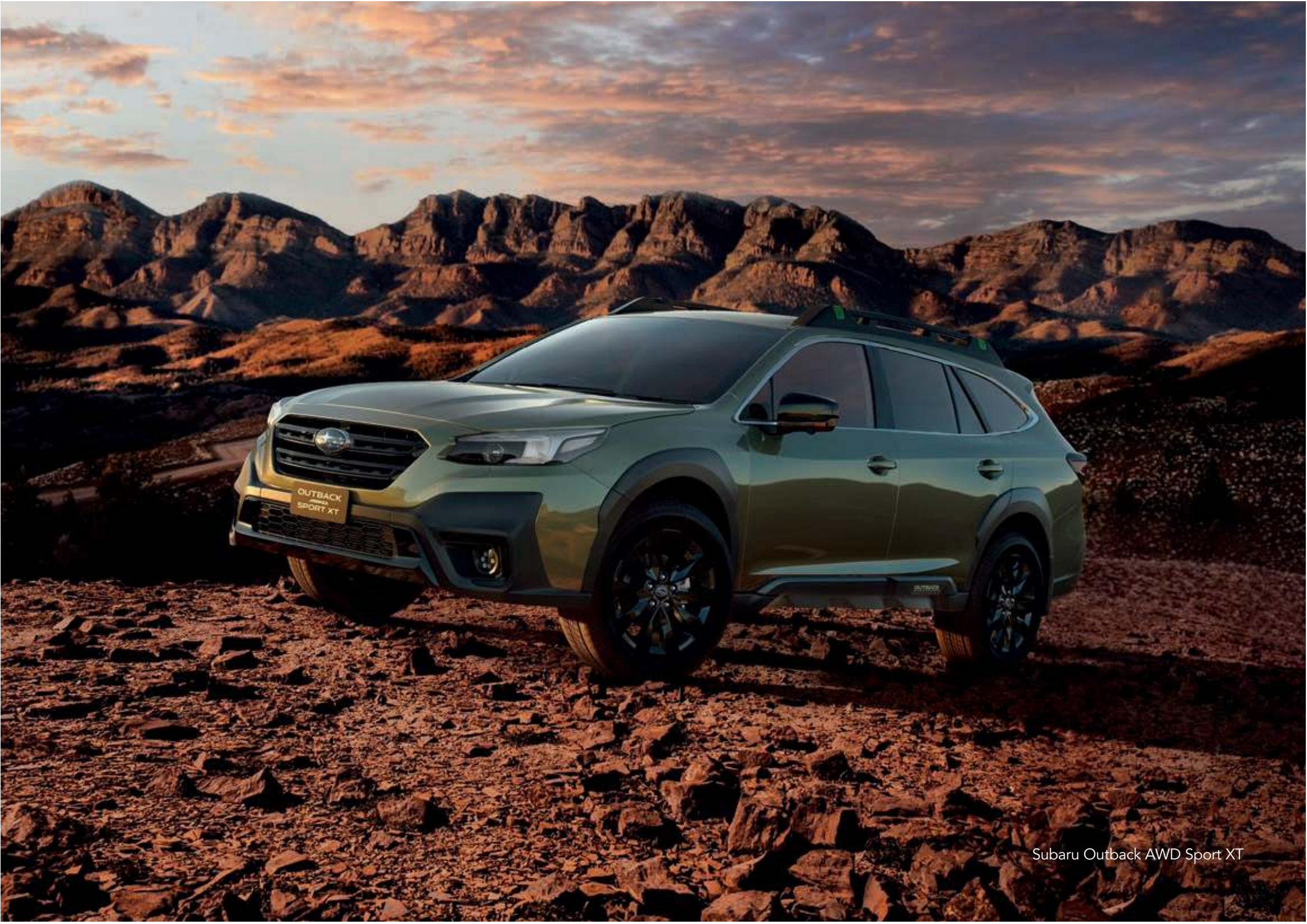
Subaru Outback AWD Sport XT