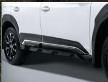
SIDE DOOR CLADDING