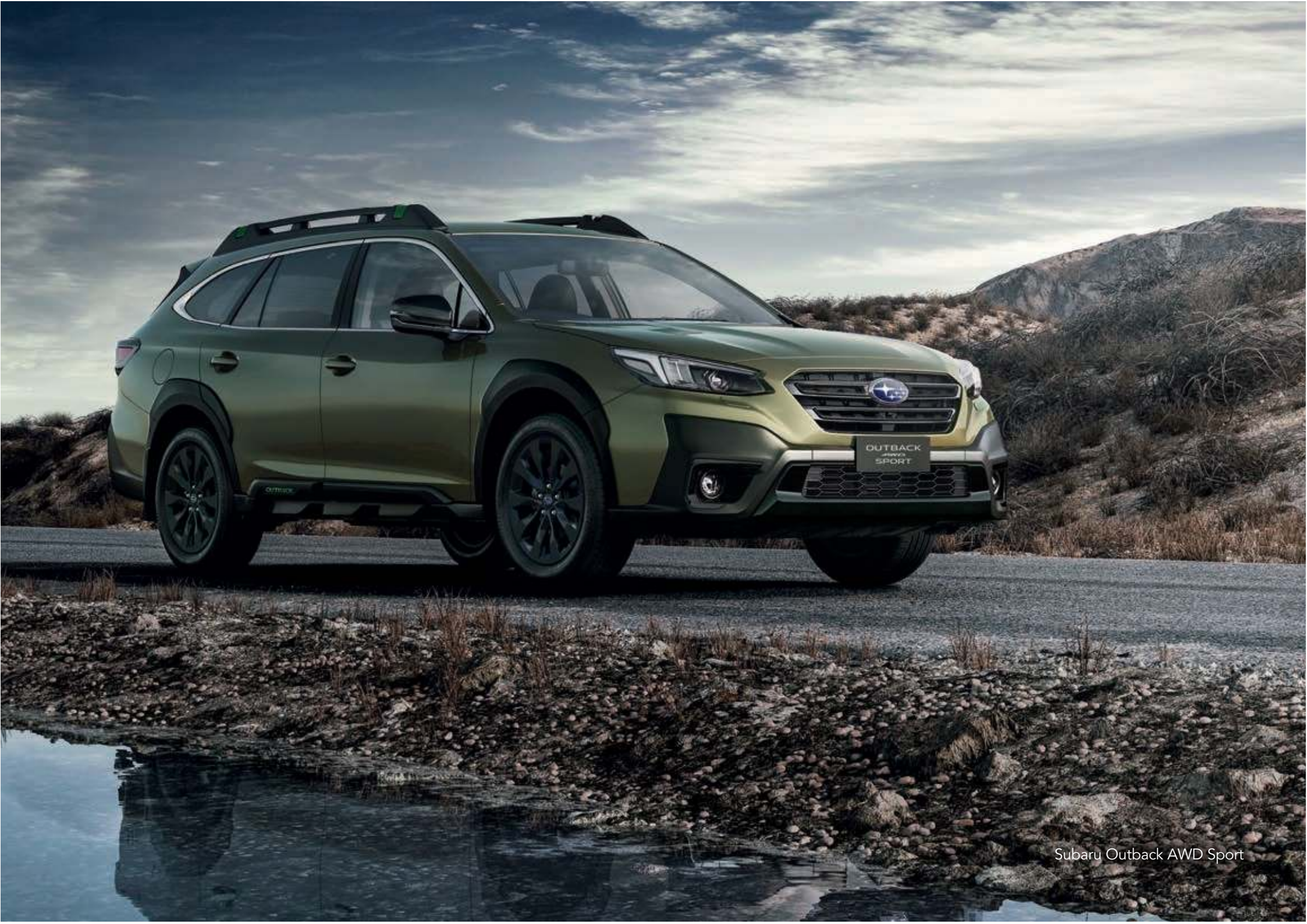
Subaru Outback AWD Sport