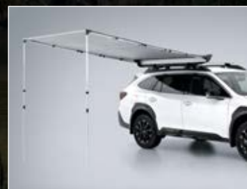
LIFESTYLE AWNING KIT 1 – OPEN