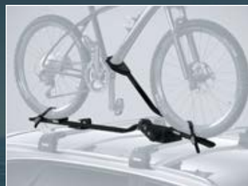
BICYCLE HOLDER (BLACK)