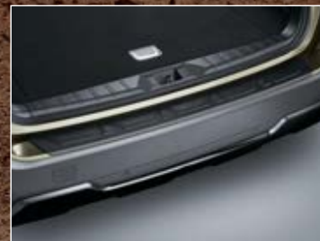
CARGO STEP PANEL (RESIN)