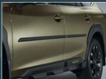
BODY SIDE MOULDS