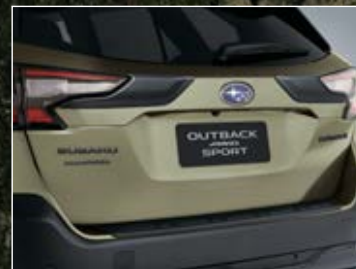
REAR GATE MOULD