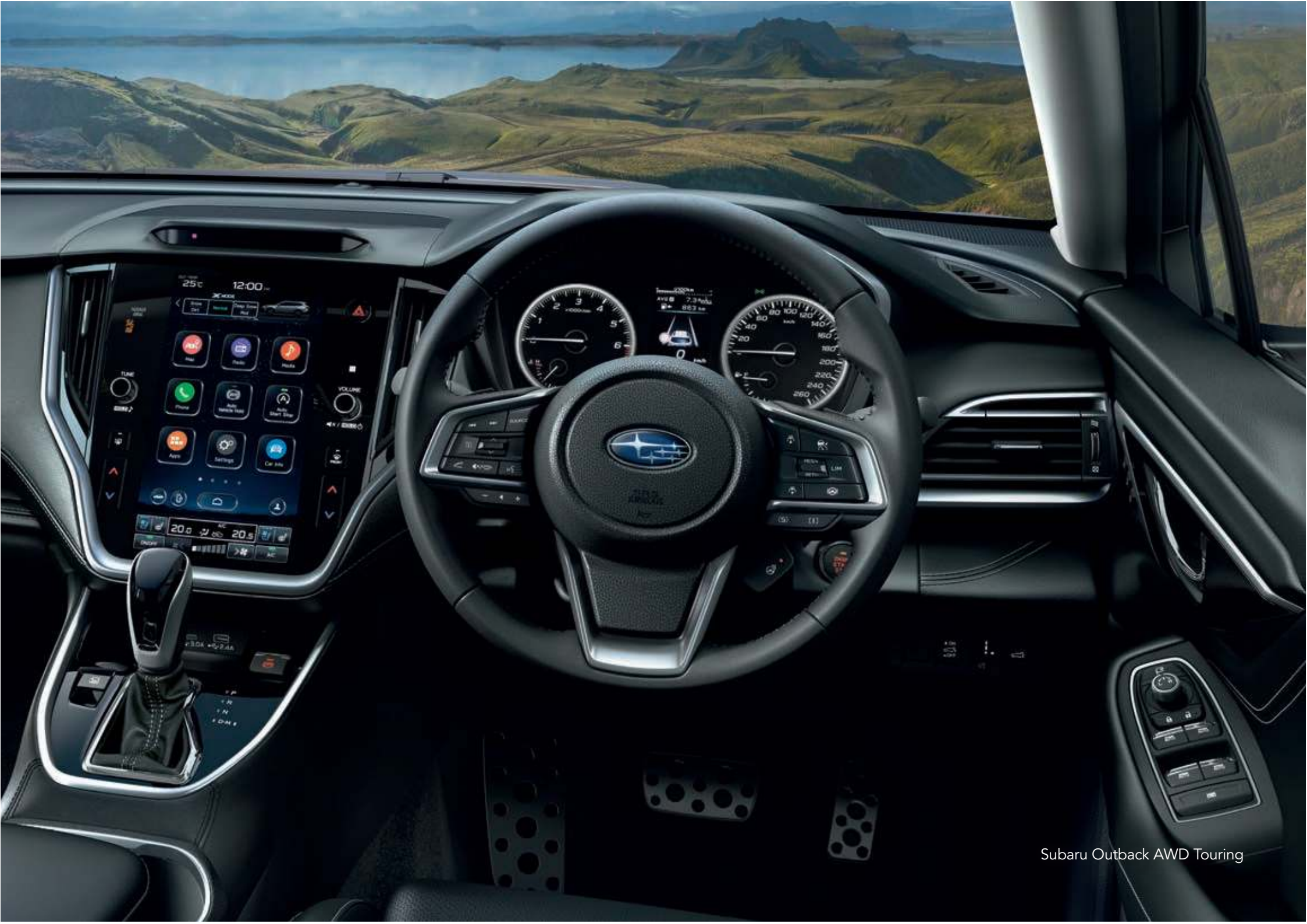
Subaru Outback AWD Touring