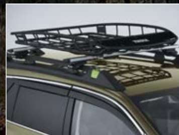
THULE ROOF BASKET