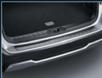
CARGO STEP PANEL (STAINLESS)