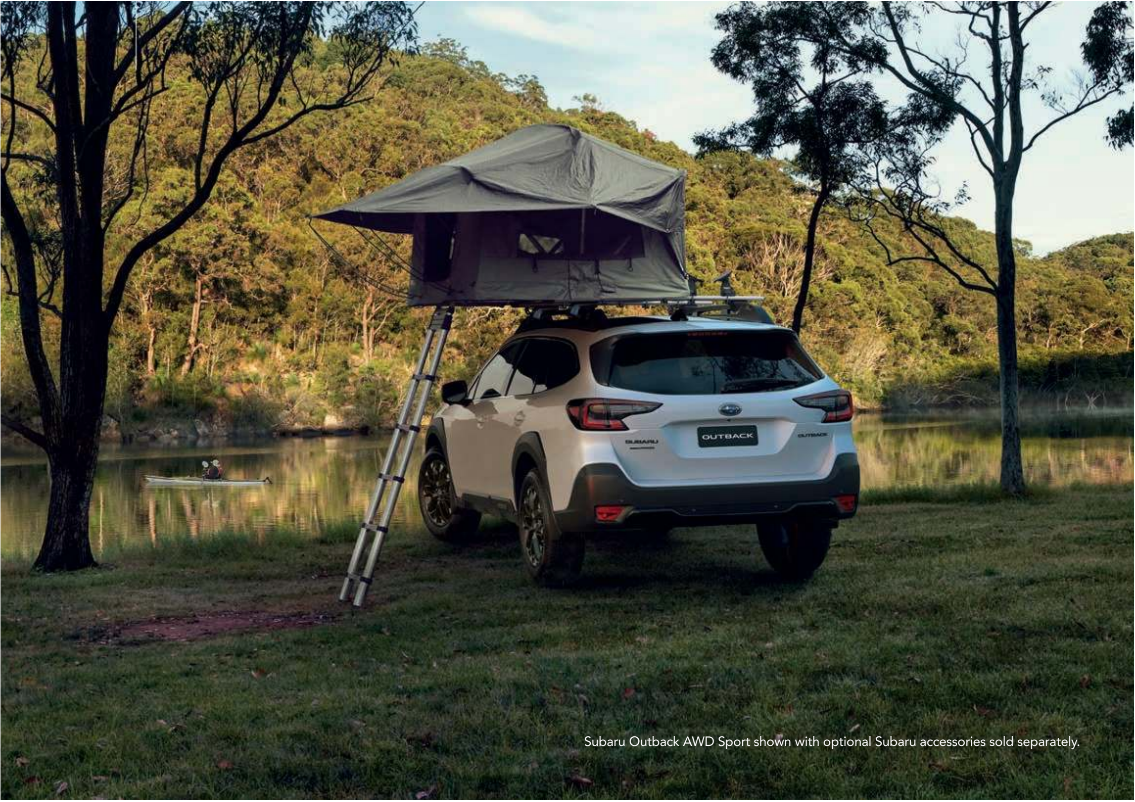
Subaru Outback AWD Sport shown with optional Subaru accessories sold separately.