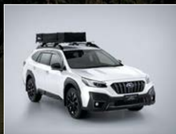
THULE ROOF TOP TENT 2 – CLOSED