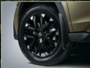
18" RUGGED WHEEL SET