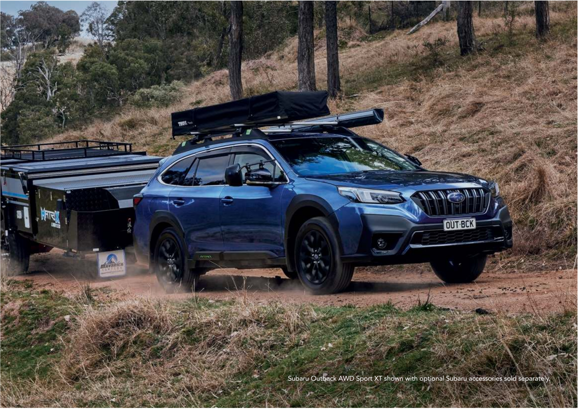
Subaru Outback AWD Sport XT shown with optional Subaru accessories sold separately.