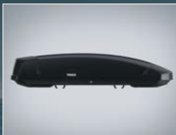
ROOF BOX – THULE FORCE XT XL