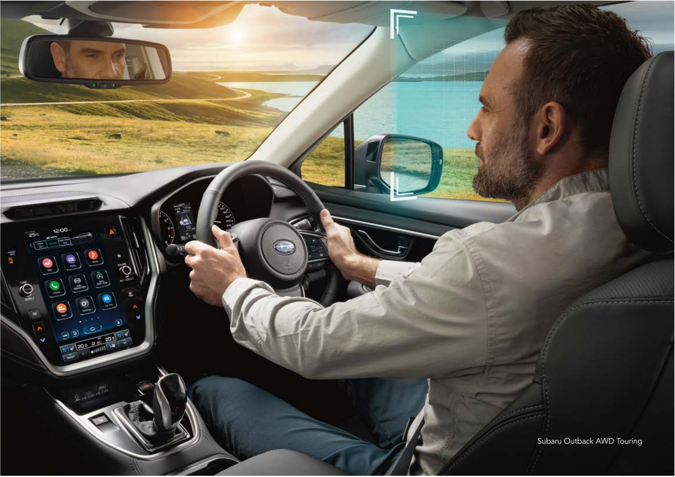
Subaru Outback AWD Touring