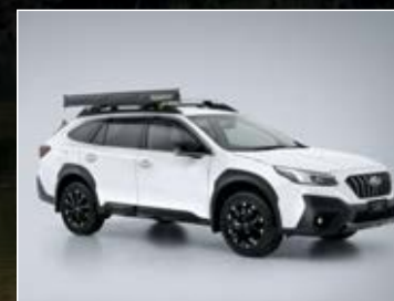
LIFESTYLE AWNING KIT 1 – CLOSED