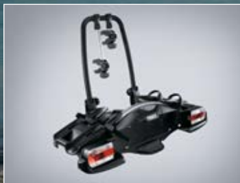
TOW BAR MOUNTED BIKE CARRIER (2 BIKES)