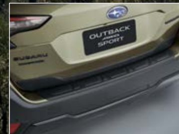
REAR GATE GUARD