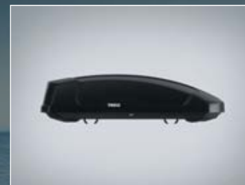
ROOF BOX – THULE VECTOR M