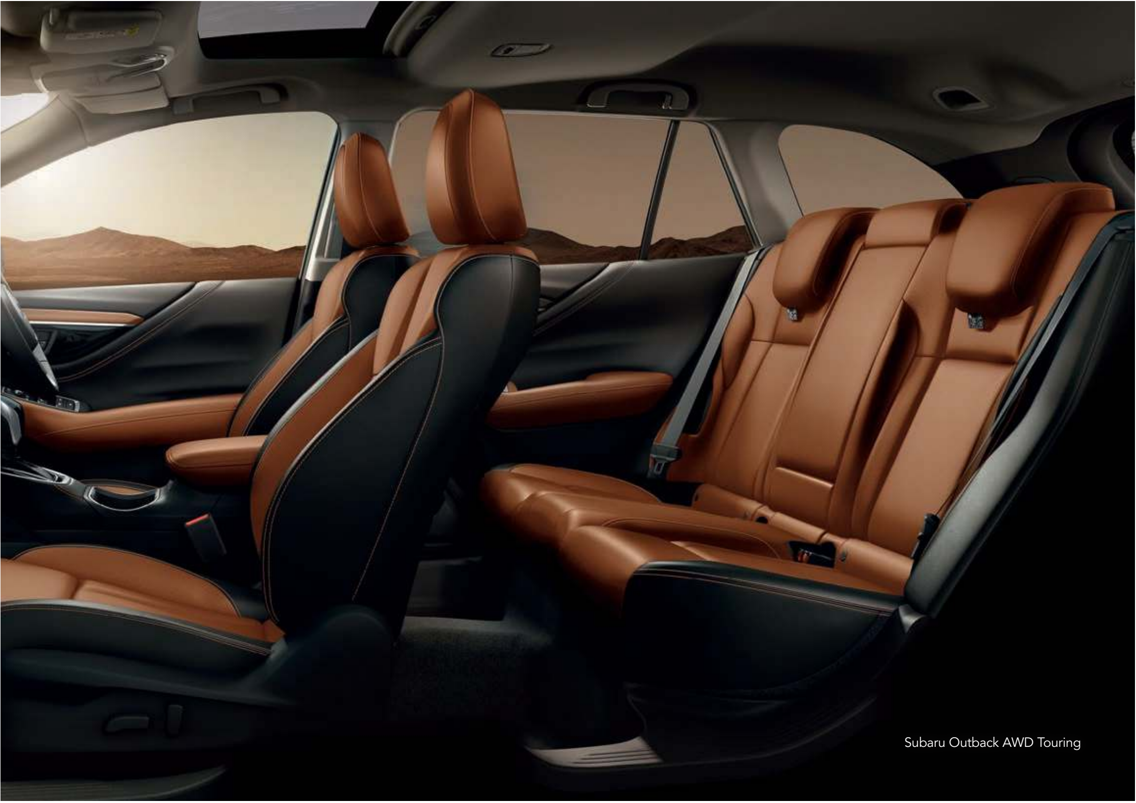
Subaru Outback AWD Touring