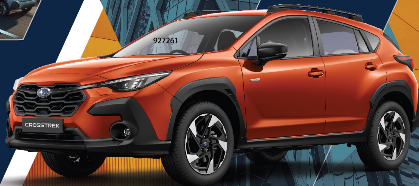
BOLD FRONT GRILLE

The Crosstrek expresses your outstanding personality through its sleek design. With a forward stance and a narrowed, light cabin, it gives its viewers a sense of agile driving. It is also newly styled with a set of 18-inch wheels to evoke a sense of power.