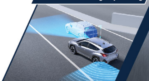
Pre-Collision Braking with Autonomous Emergency Steering