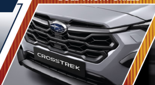
BOLD FRONT GRILLE