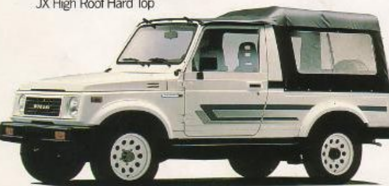
JX High Roof Hard Top