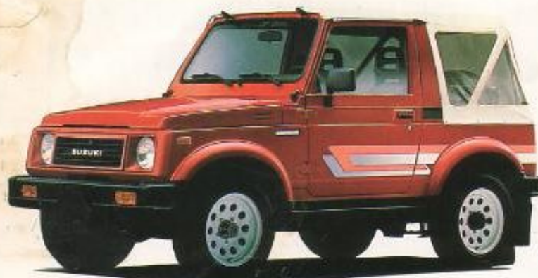
JA/JX Soft Top Give 100K, accentuated by your matched flared guards.

Bigger and better rear vision mirrors, bigger bumpers front and back, new wheels and new grille complete the picture on the outside.