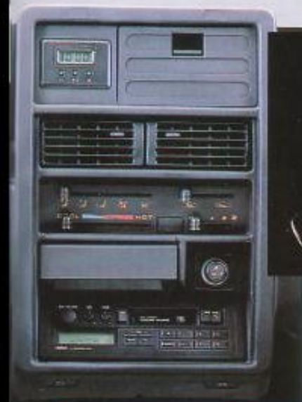
Stereo cassette optional