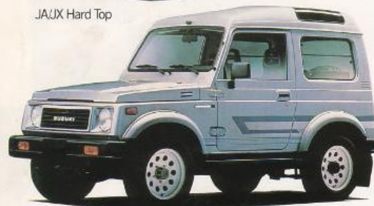
JA/JX Hard Top