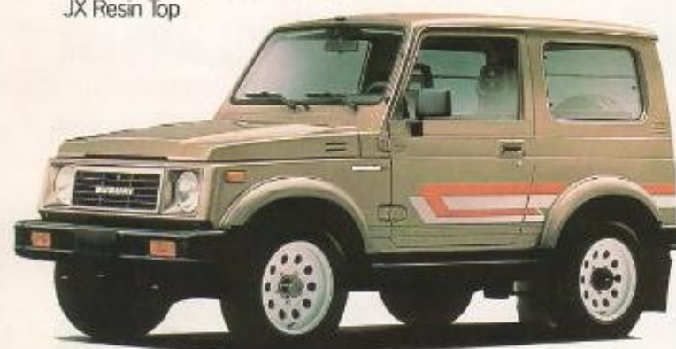
JX Resin Top

Inside it's a whole new story too, with completely new dash and trim. It's a whole new look.