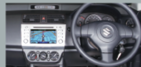
An integrated Car Navigation System with Rear View Camera