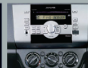
Integrated Sound System