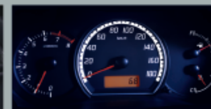
Sporty, Easy-to-Read Tachometer with tripmeter & illumination control