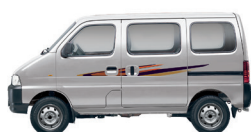
Metallic Silky Silver