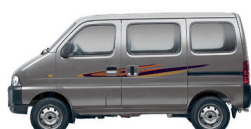
Metallic Glistening Grey