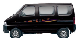
Pearl Midnight Black