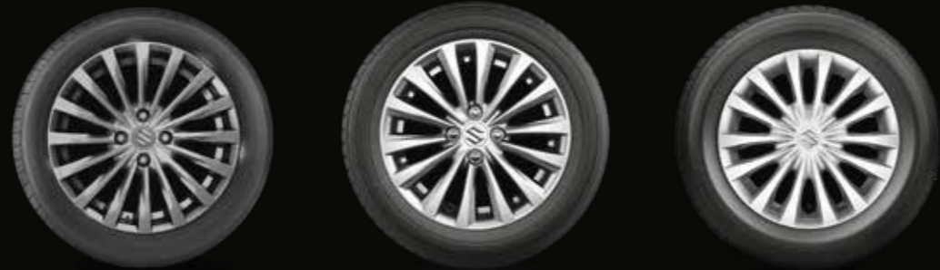
ALLOY WHEELS FOR 195/55 R16 TYRE