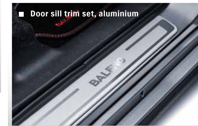
■ Door sill trim set, aluminium