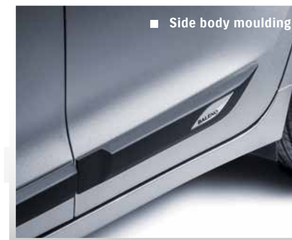
■ Side body moulding