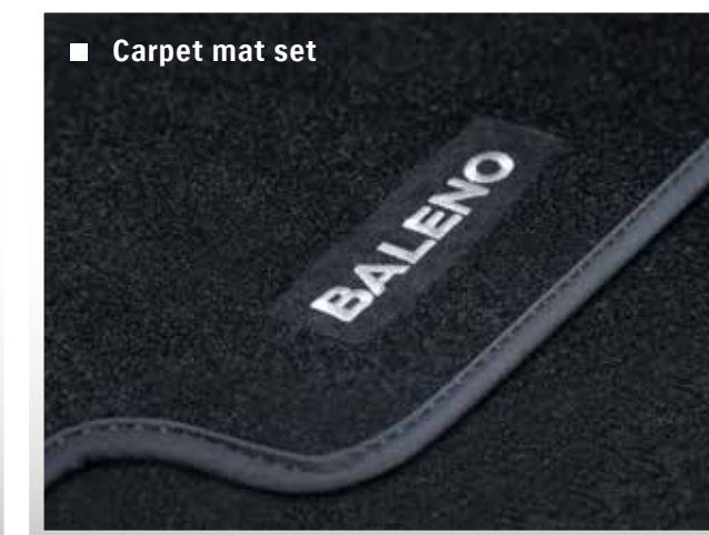
■ Carpet mat set