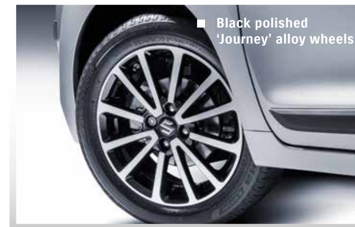
■ Black polished 'Journey' alloy wheels