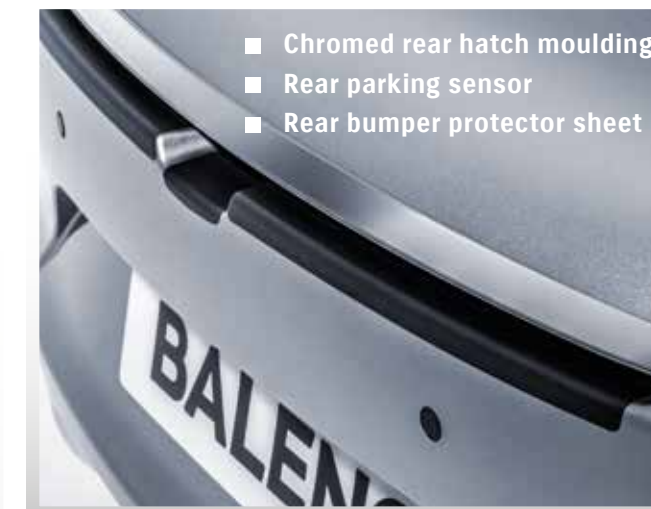
■ Chromed rear hatch moulding ■ Rear parking sensor ■ Rear bumper protector sheet