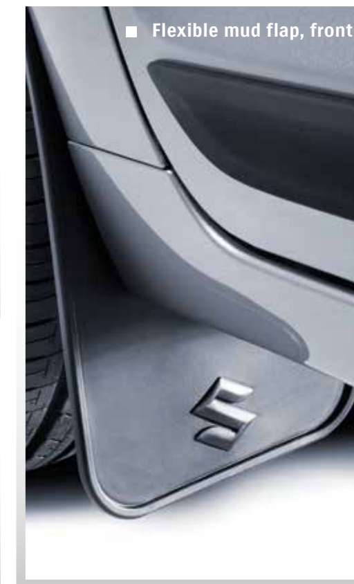
■ Flexible mud flap, front