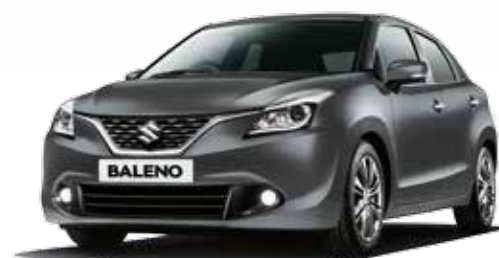
Glistening Grey Metallic