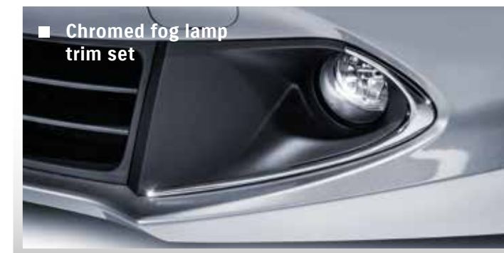
■ Chromed fog lamp trim set