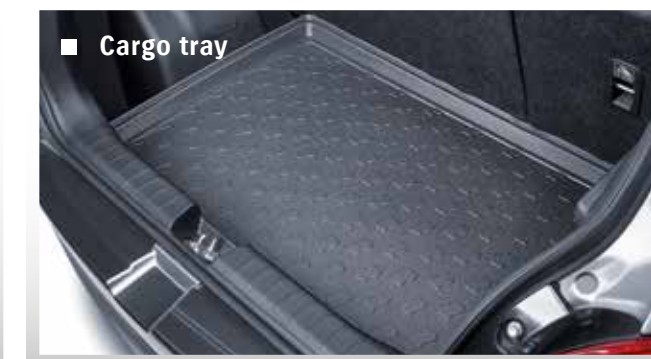
■ Cargo tray