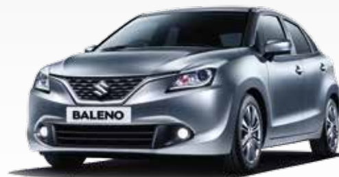
Premium Silver Metallic