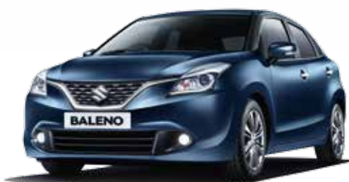
Ray Blue Metallic