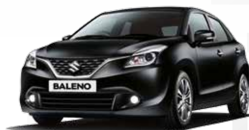
Midnight Black Pearl